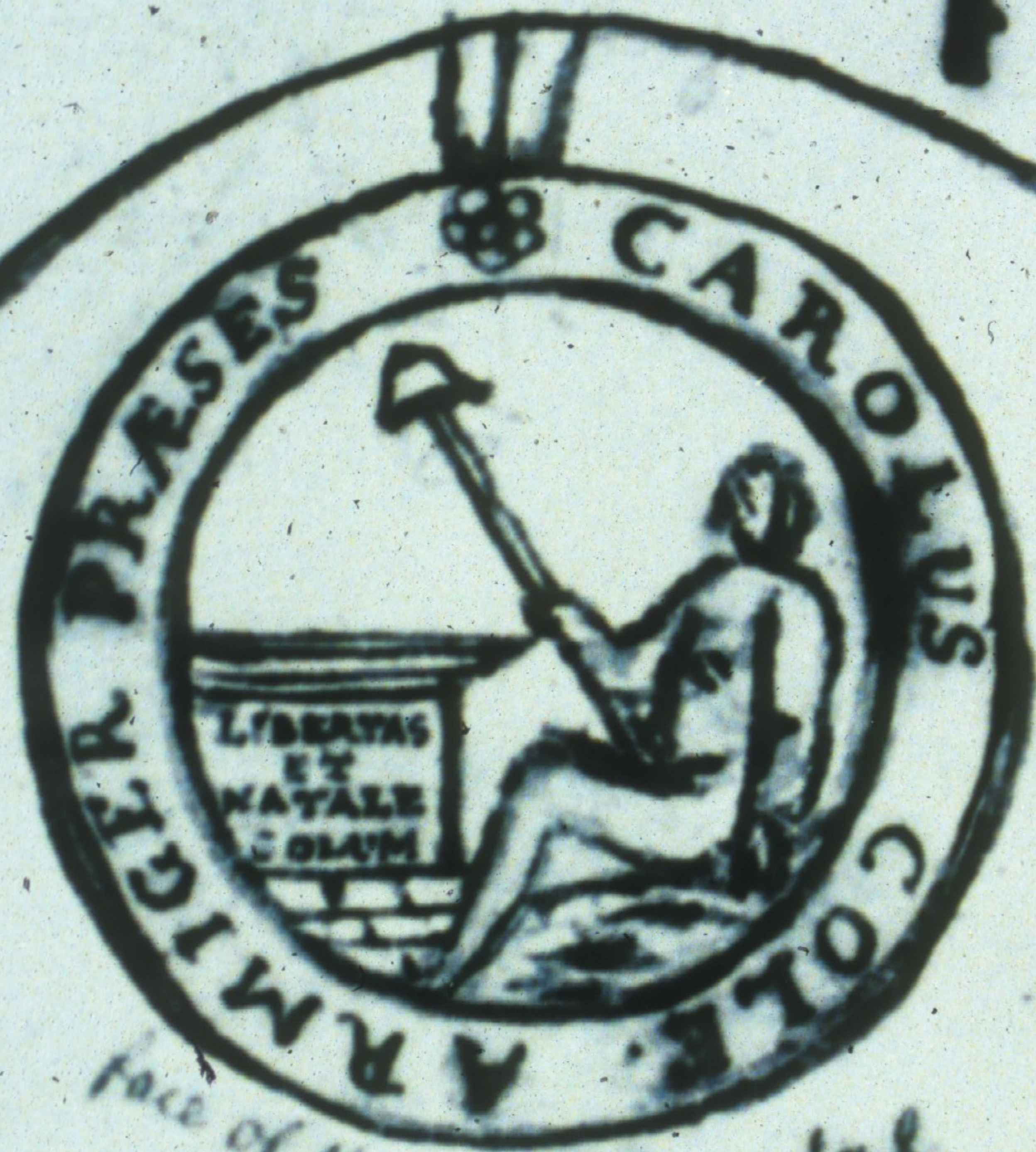
face of the Club medal