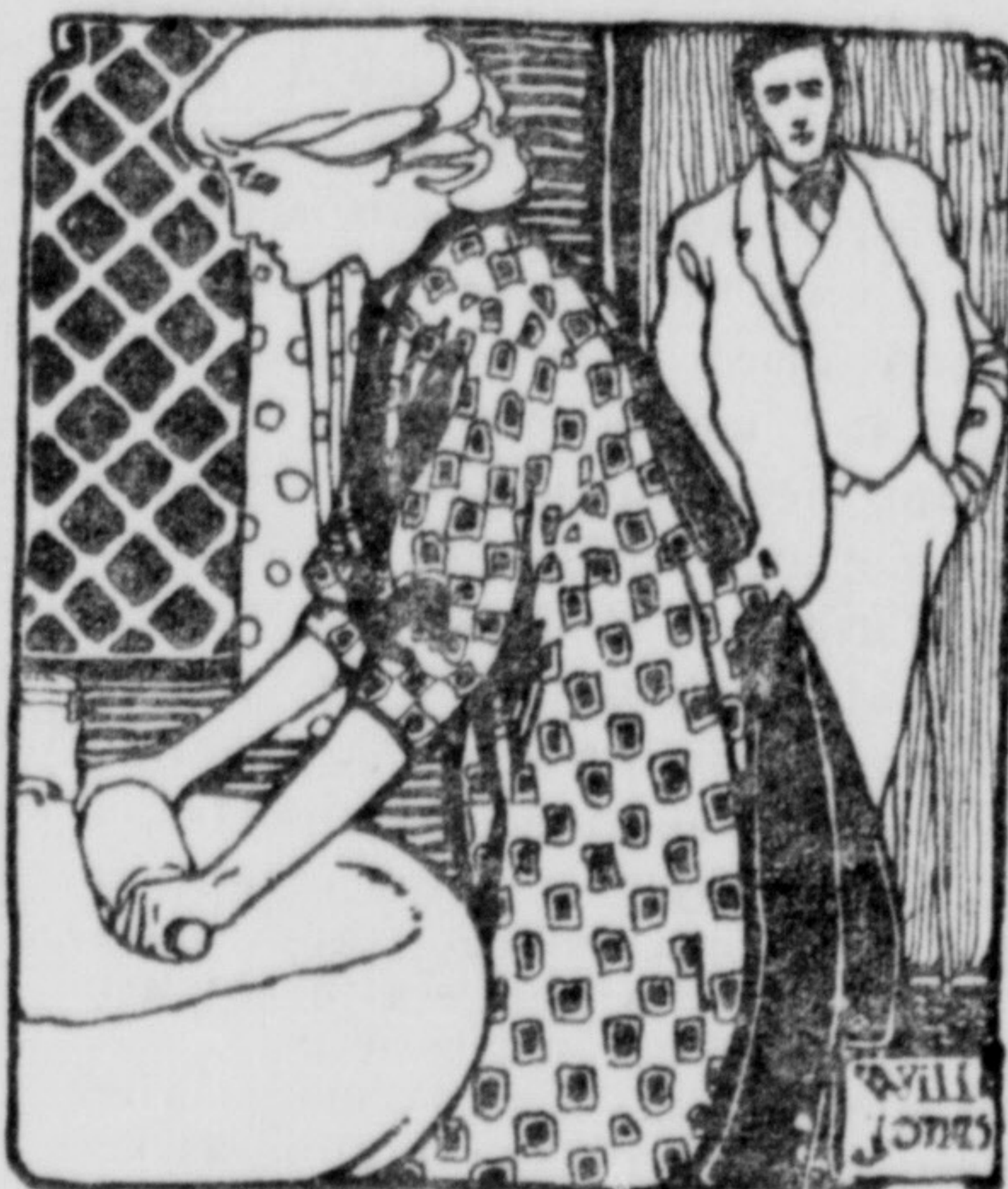
HE WATCHED HER FROM THE OPEN DOOR.

A TRIM and dainty maid was she, In lilac calico; Around her slender waist was tied An apron white as snow,