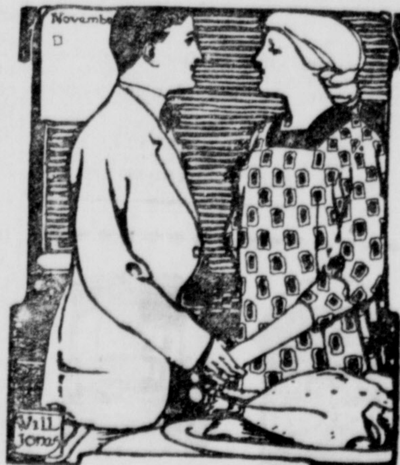
"OH, WILL YOU COOK MY TURKEY, DEAR?"

BUT, lo, when from the oven's depths The smoking bird she drew And dished it in a paper frill Upon a platter blue,