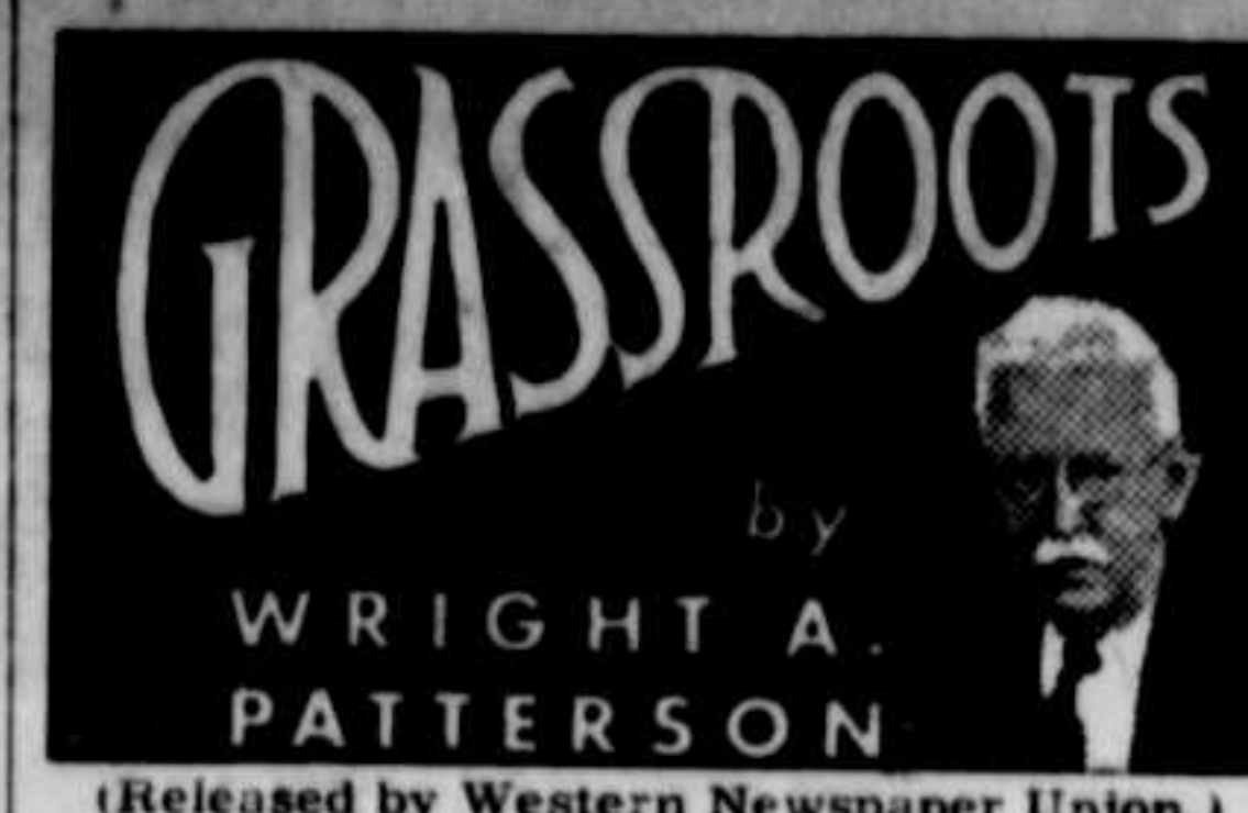
WRIGHT A. PATTERSON (Released by Western Newspaper Union.)

Present-day engine developments are along two lines, the radial air-cooled type and the liquid-cooled type. Huge frontal areas of the air-cooled engines interfered seriously with clean aerodynamic design, whereas the liquid-cooled engines had far less frontal area to buck the air streams.