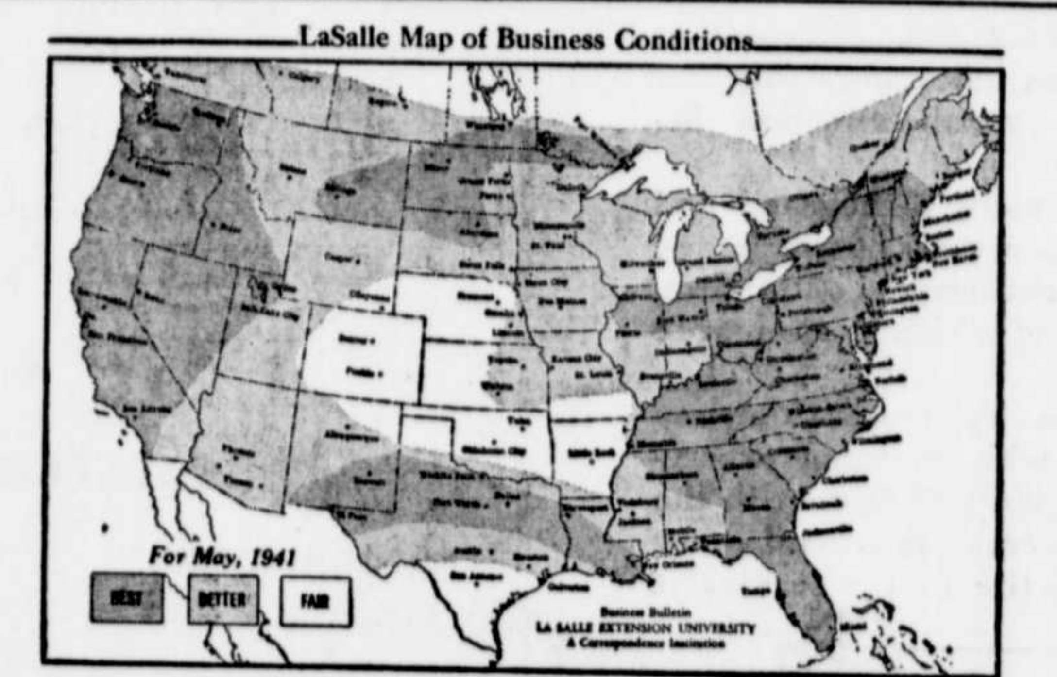
Improving conditions in the U. S. during the month of May are indicated by the above map. Farm income is slowly but steadily rising.