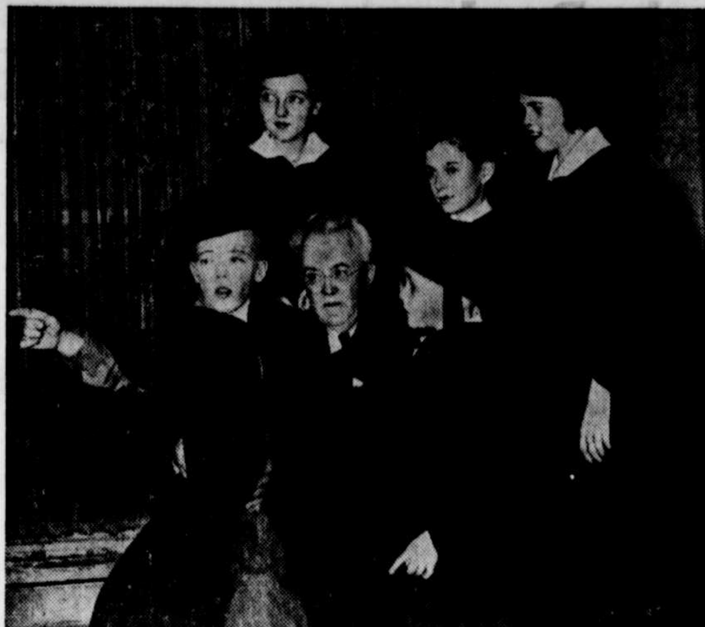
When Dr. Allen Roy Dafoe brought the Dionne quintuplets into the world, he had to think fast if the five famous children were to survive.

children, and the gift-child spoofery of humiliated adults.