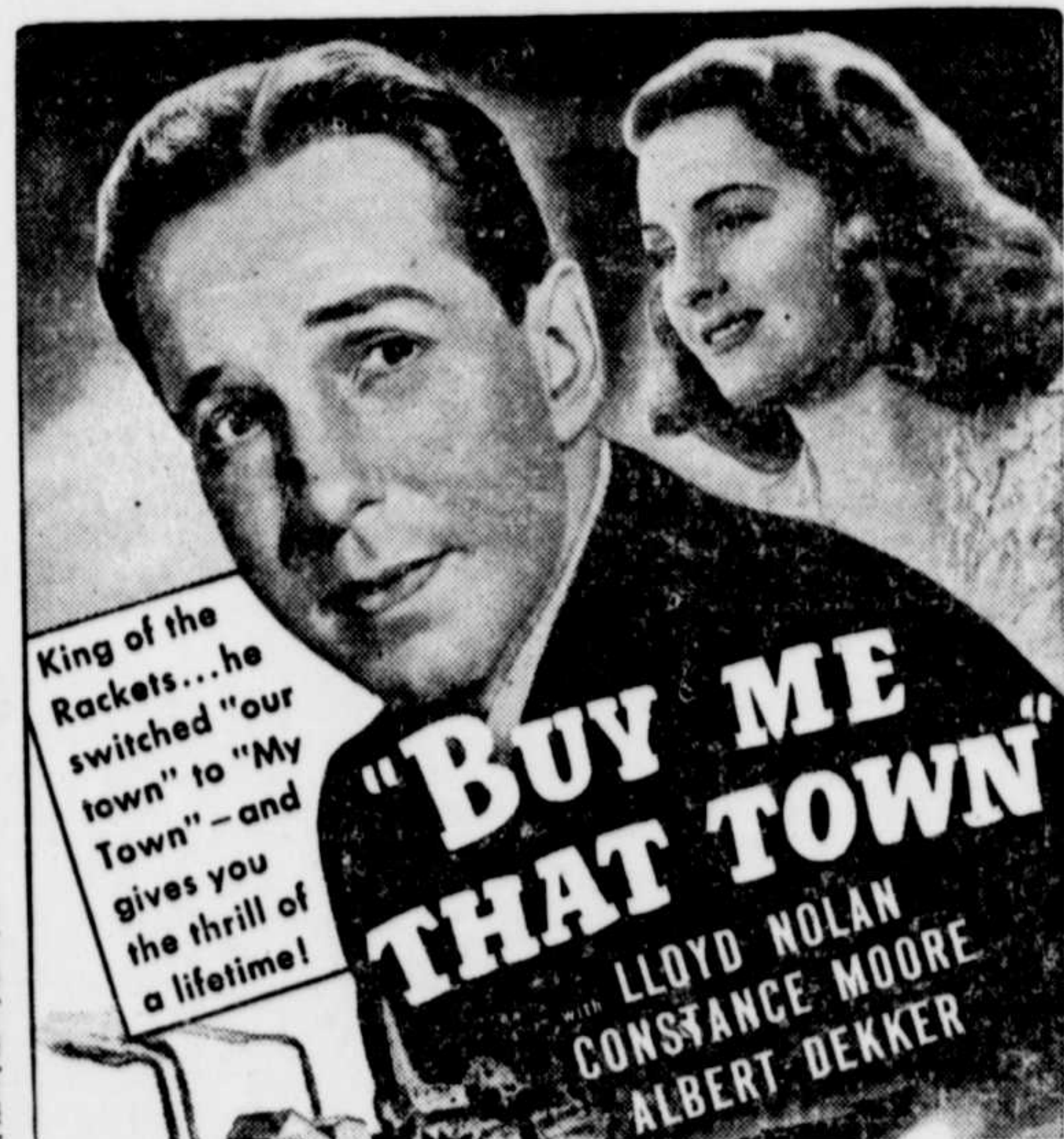
King of the Rackets...he switched "our town" to "My Town"—and gives you the thrill of a lifetime!