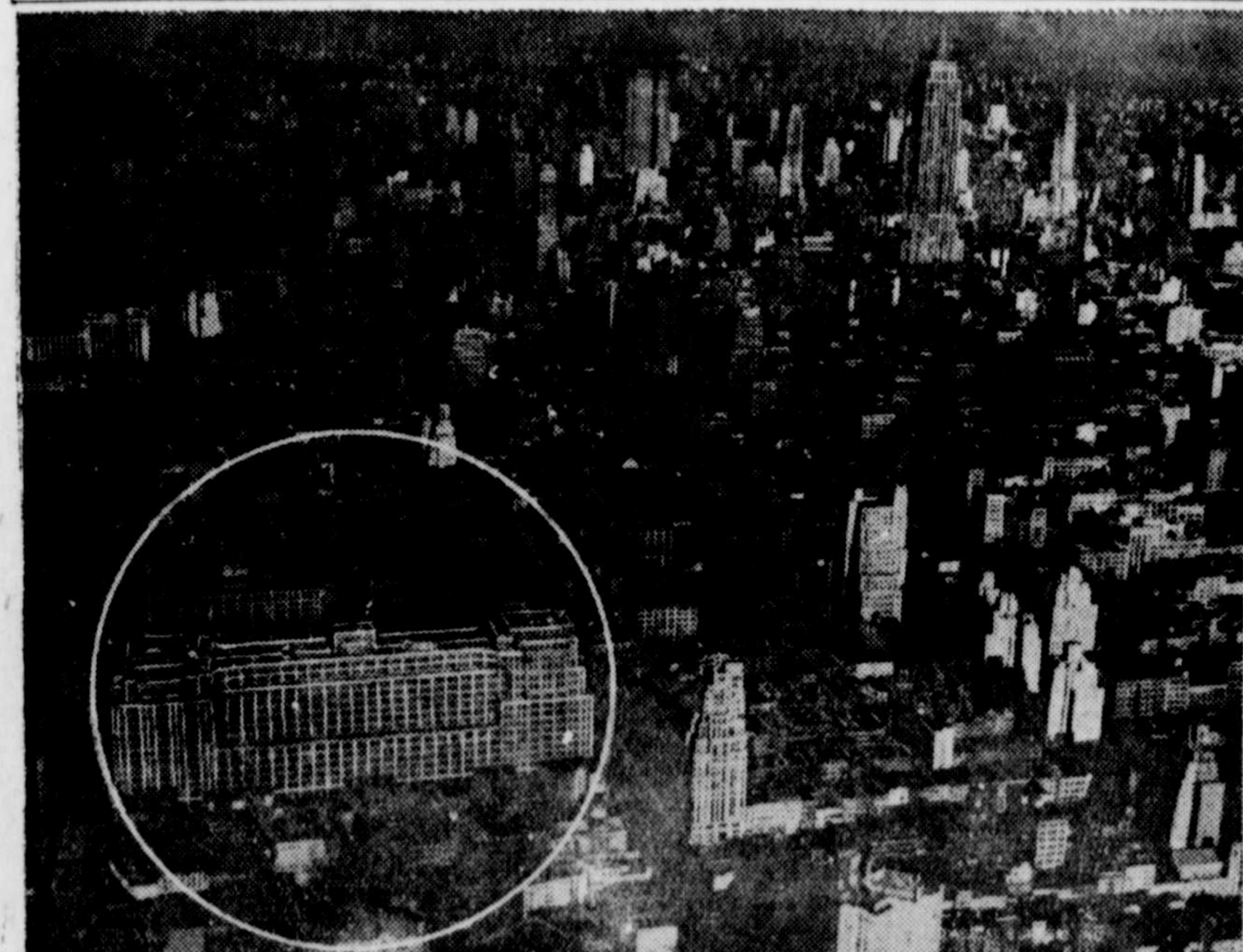
Aerial photograph showing the Port of New York Authority Building in the heart of New York City, the city's biggest building in floor space and cubic content. Here, in Commerce Hall, from February 4 to 5, will be housed the Poultry Industries Exposition.

NEW YORK, N. Y.—The Poultry Industries Exposition will be held February 4 to 5 in Commerce Hall, New York's largest exposition auditorium, in the Port of New York Authority Building. The building, shown in the above photograph, is in the heart of the city, at Eighth Avenue and Fiftieth Street and is within a few minutes of the principal shopping centers and the wholesale food districts.