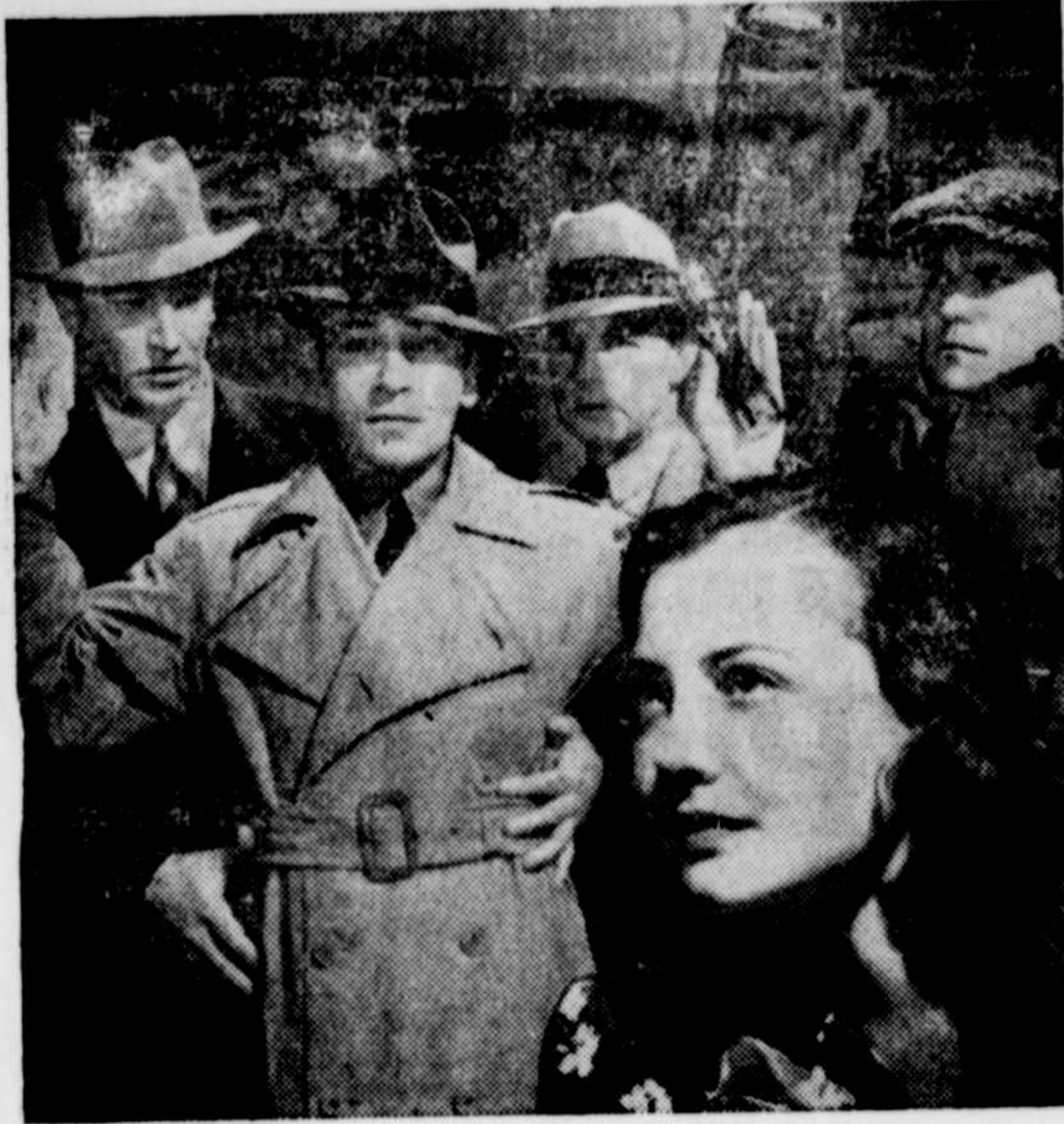
YOU AND ME

A crucial point in the plot of Paramount's "You and Me", co-starring George Raft and Sylvia Sydney, is illustrated in the scene above. The drama shows at The New Lyceum Theatre on Monday and Tuesday, July 5 and 6.