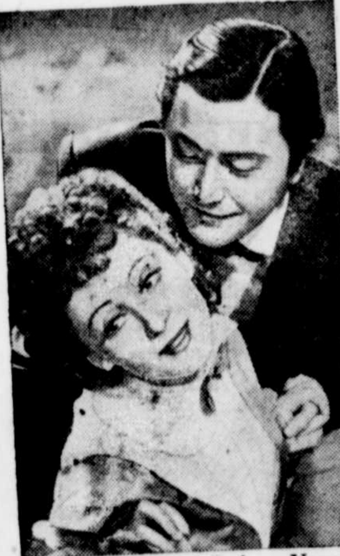
Luise Rainer and Robert Young in "The Toy Wife"

"The Toy Wife," starring Luise Rainer, with Melvyn Douglas and Robert Young sharing honors as lead-which comes to the New Lyceum Theatre on Wednesday and Thursday, July 6 and 7. The film is Miss Rainer's first since she and Spencer Tracy.