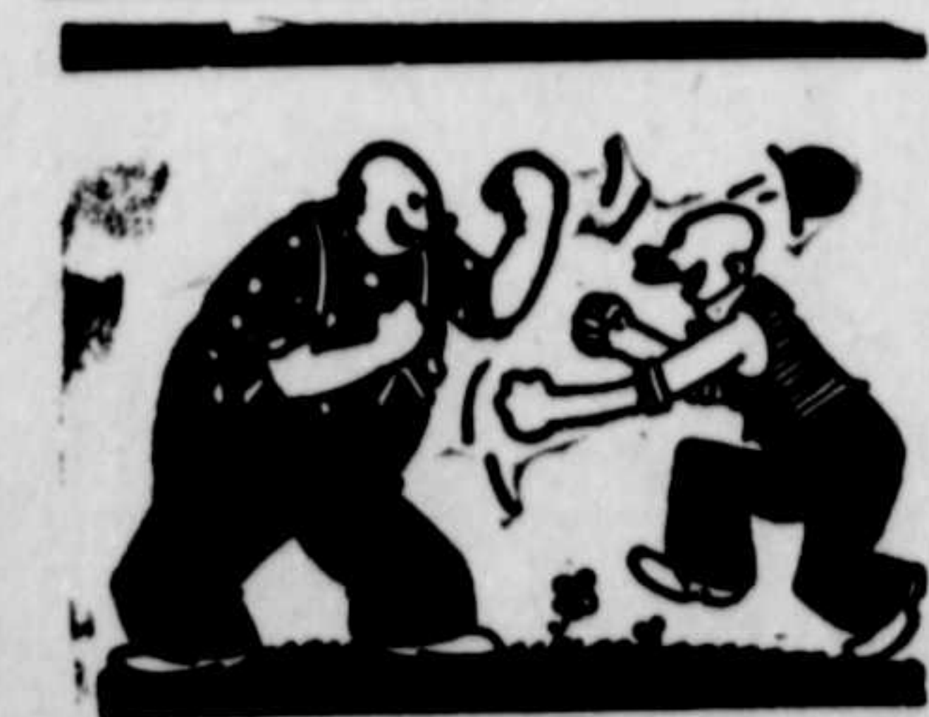
The Morning After Taking Carter's Little Liver Pills