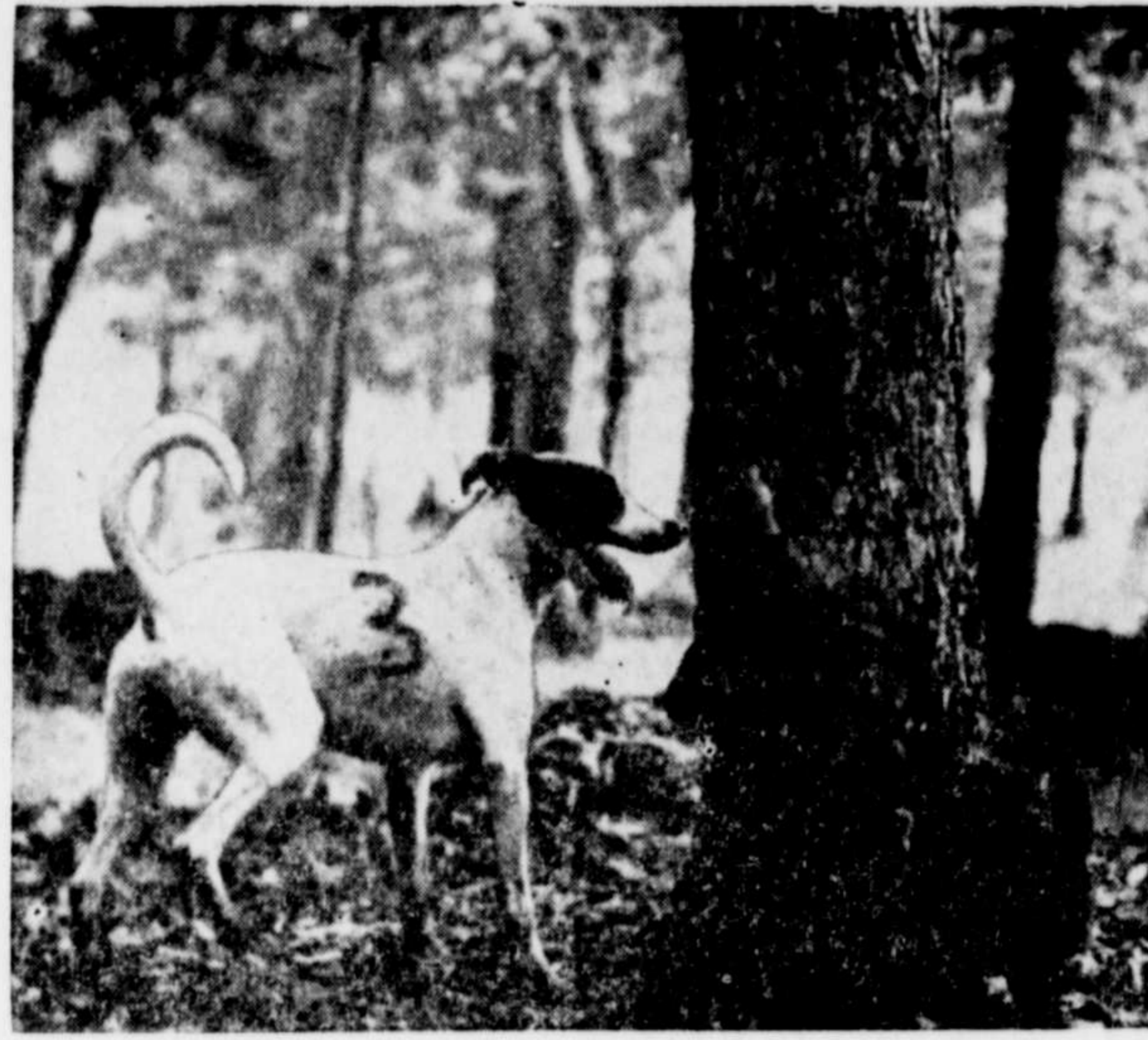
Winners in the even of the Coon Dog Field Trials held at Prices Station last Sunday. Dogs from New Jersey and Delaware took most of the events. (Results which were to have been mailed to this paper had not arrived at time of going to press.)