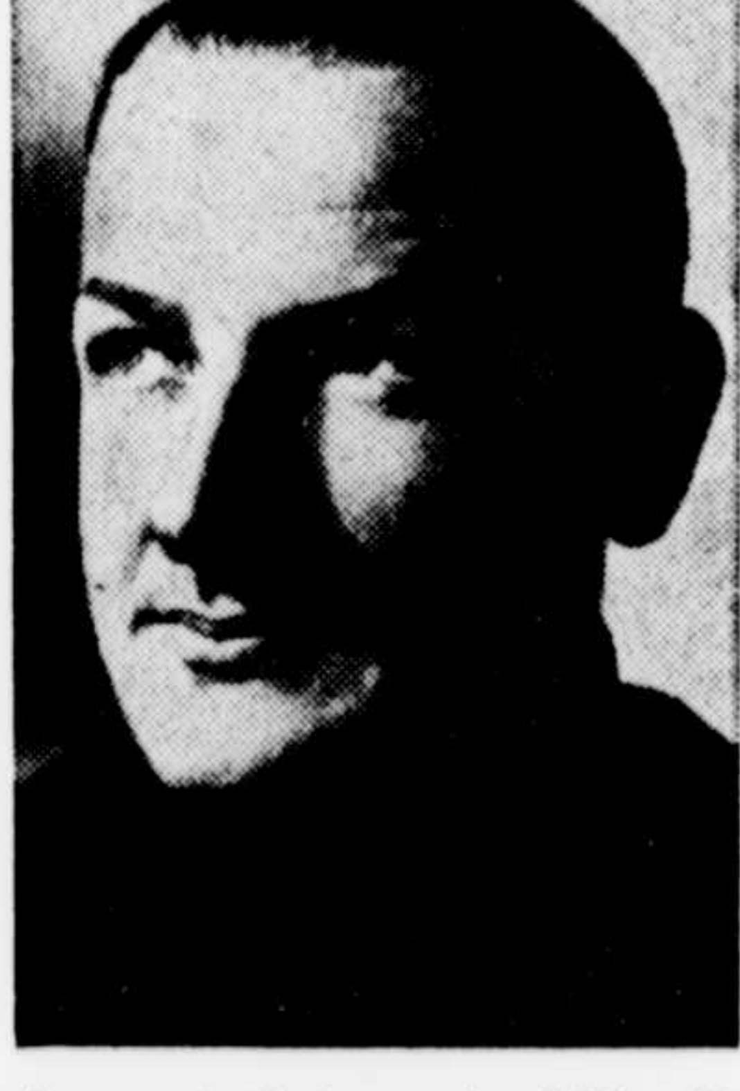
A recent photograph of Vice Premier Valery Ivanovitch Mezhlauk, who has been appointed to the post of commissar of heavy industry of the U. S. S. R.