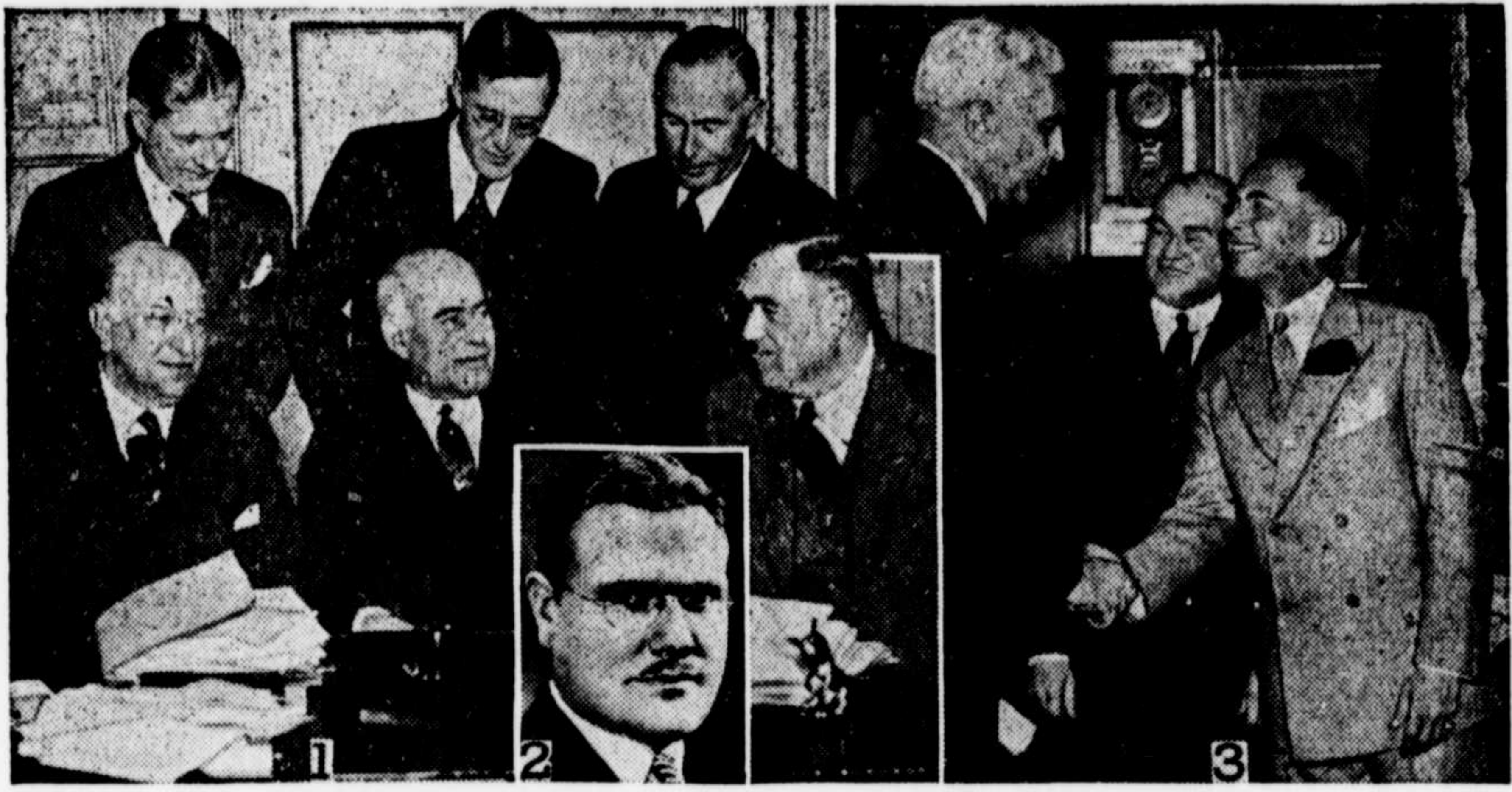
1—Gubernatorial conference discusses unemployment and relief problems. Conferees, left to right, seated, Governor Horner of Illinois, Governor Lehman, New York, and Gov. Charles F. Hurley, Massachusetts.