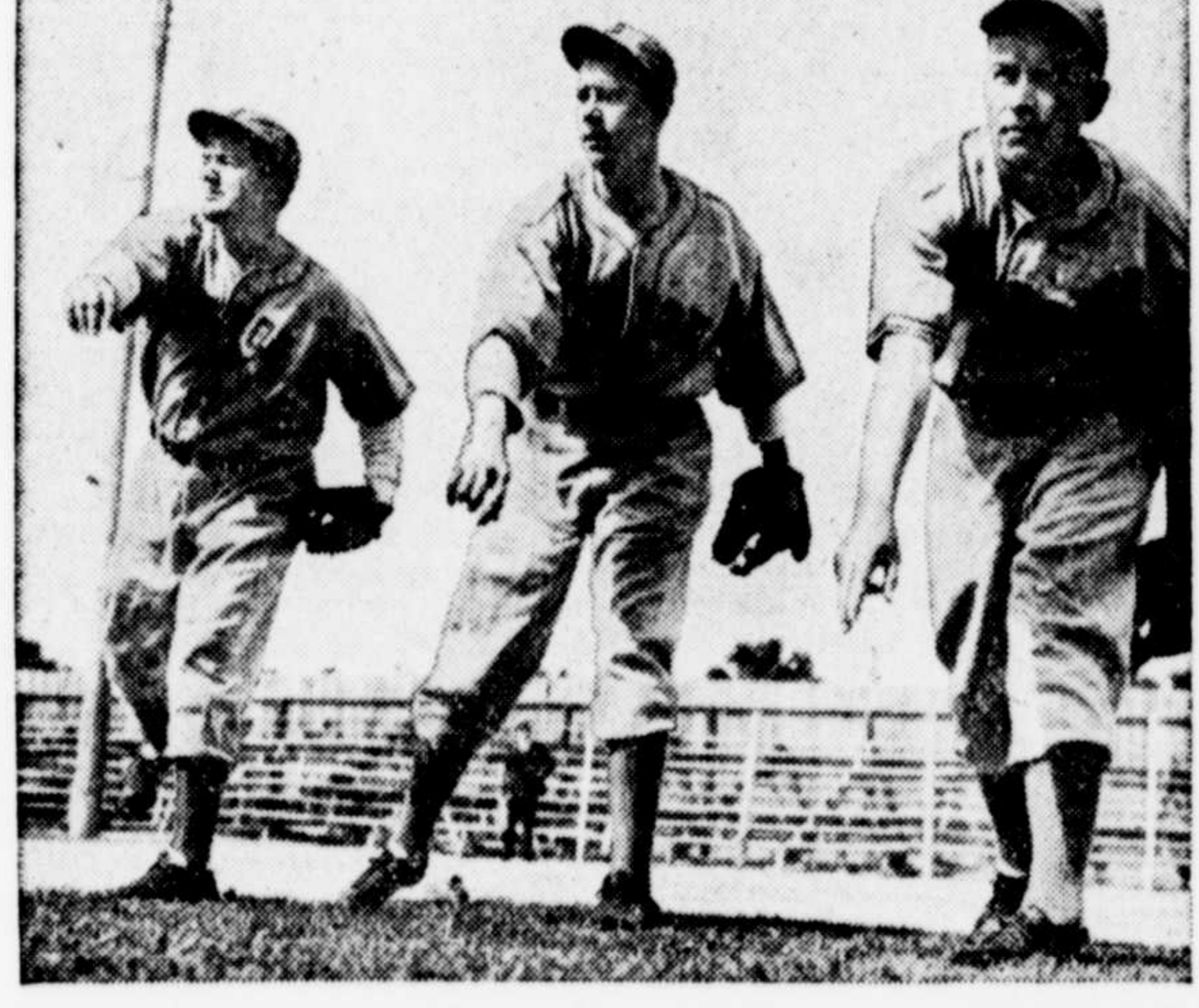
A twirling trio of the Boston Bees unlimbering their starboard flippers on the opening day of the spring training season at the club's camp in St. Petersburg, Fla.