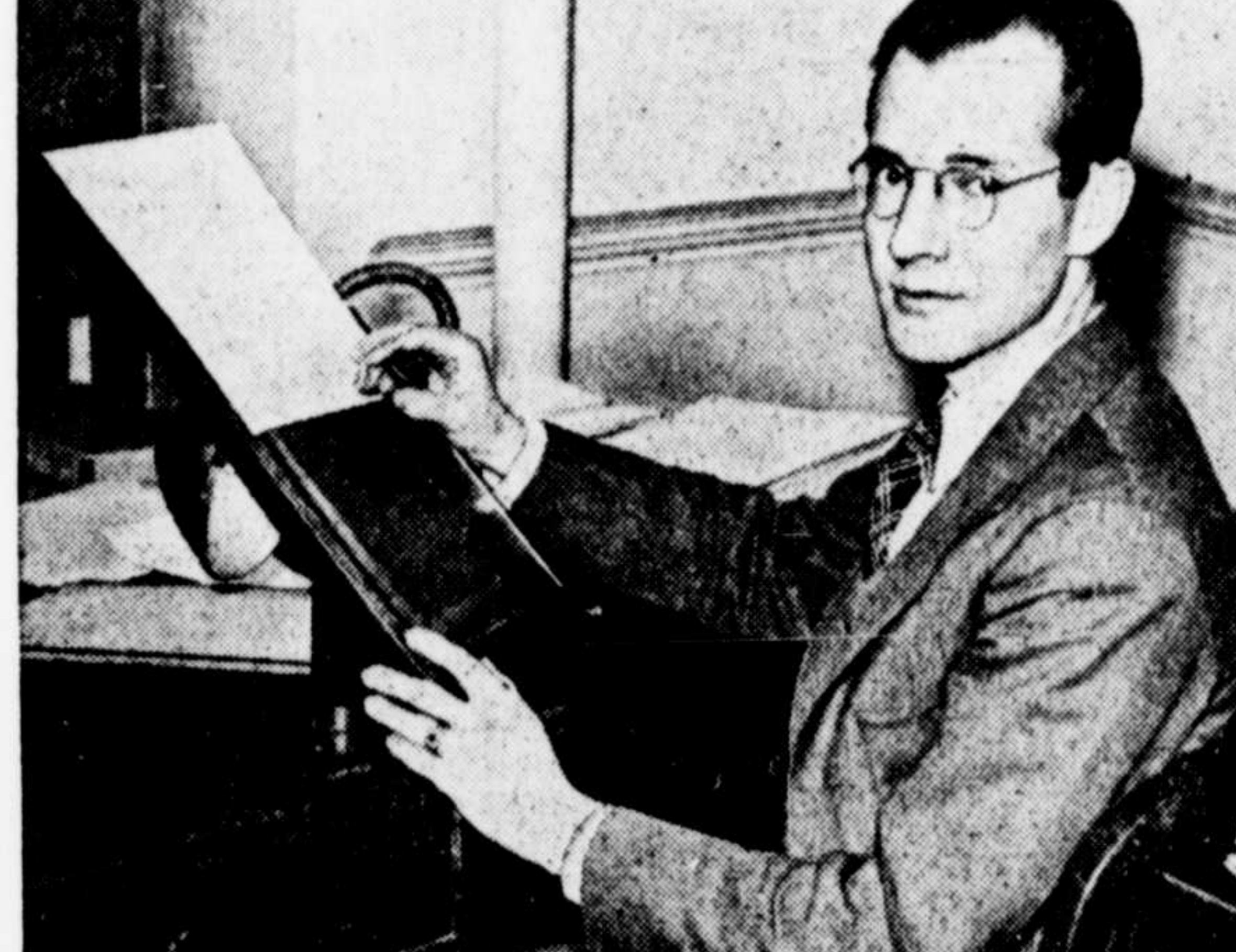
Dr. Fred L. Whipple, of the Harvard observatory, who announced recently the discovery of a new small comet in the constellation Canes Venatici (the hunting dogs), is shown in his office at Harvard university.