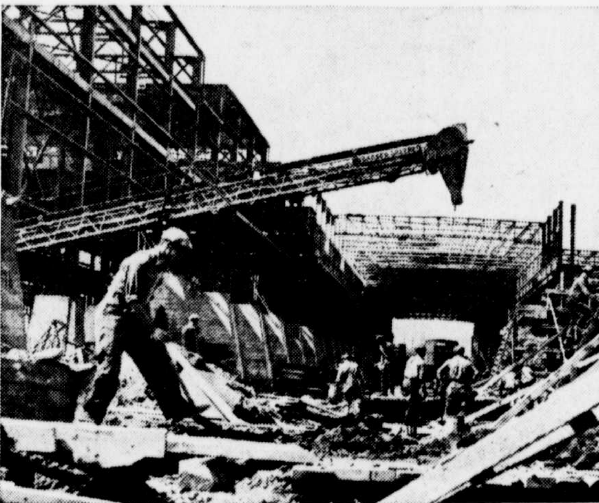
A new "little Ruhr" is rising seven miles up the Cuyahoga river from Cleveland, Ohio, which will mark it as America's meeting grounds for iron ore and coal. The development is part of the Republic Steel corporation's program of expansion. A $15,000,000 plant, shown above, is under construction, which, when completed, will be the world's most continuous strip mill.