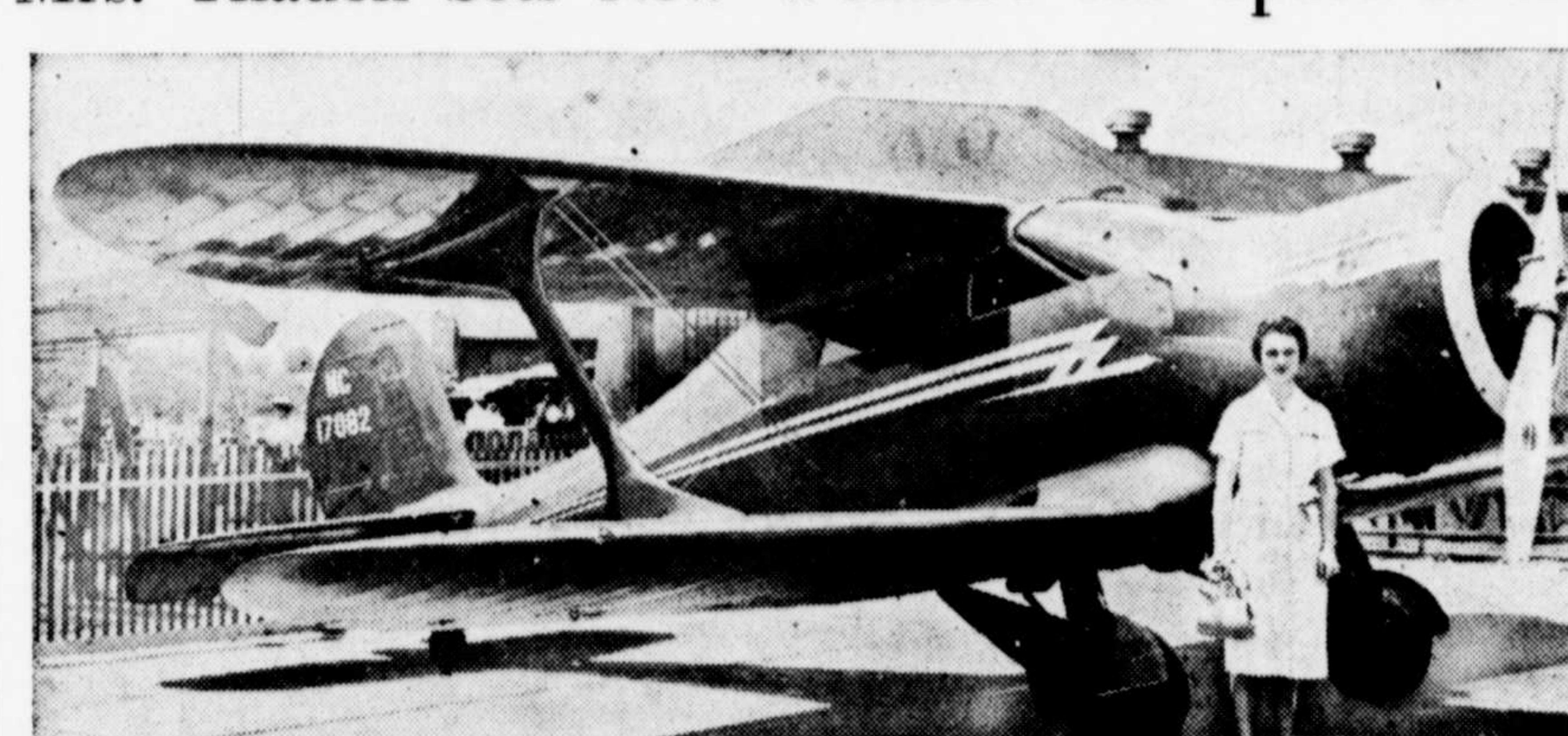
Mrs. Louise Thaden, winner of the Bendix and Harmon trophies last year, beside the plane in which she set a new speed record for women at the air show held at the Lambert-St. Louis airport here May 29, when she flew a 100-kilometer (62.5-mile) course at a speed of 197.9 miles an hour. The former record was 175 miles an hour, held by Amelia Earhart.