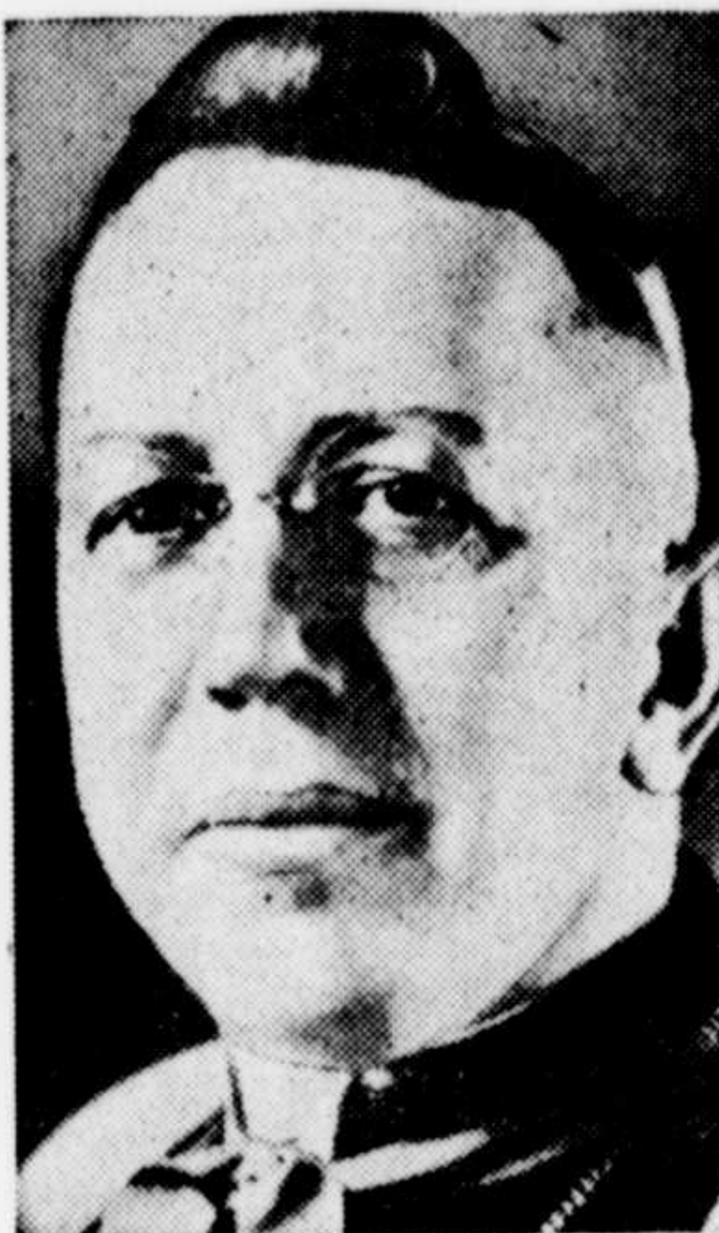
Bishop Edward Mooney of Rochester, N. Y., who has been appointed bishop of Detroit, succeeding the late Bishop Gallagher. As bishop of Detroit, Bishop Mooney becomes Father Coughlin's immediate superior. His designation to the post was widely predicted, as he is known as a diplomat of unusual skill in dealing with problems such as those Father Coughlin's excursions in politics and economics create in the diocese.