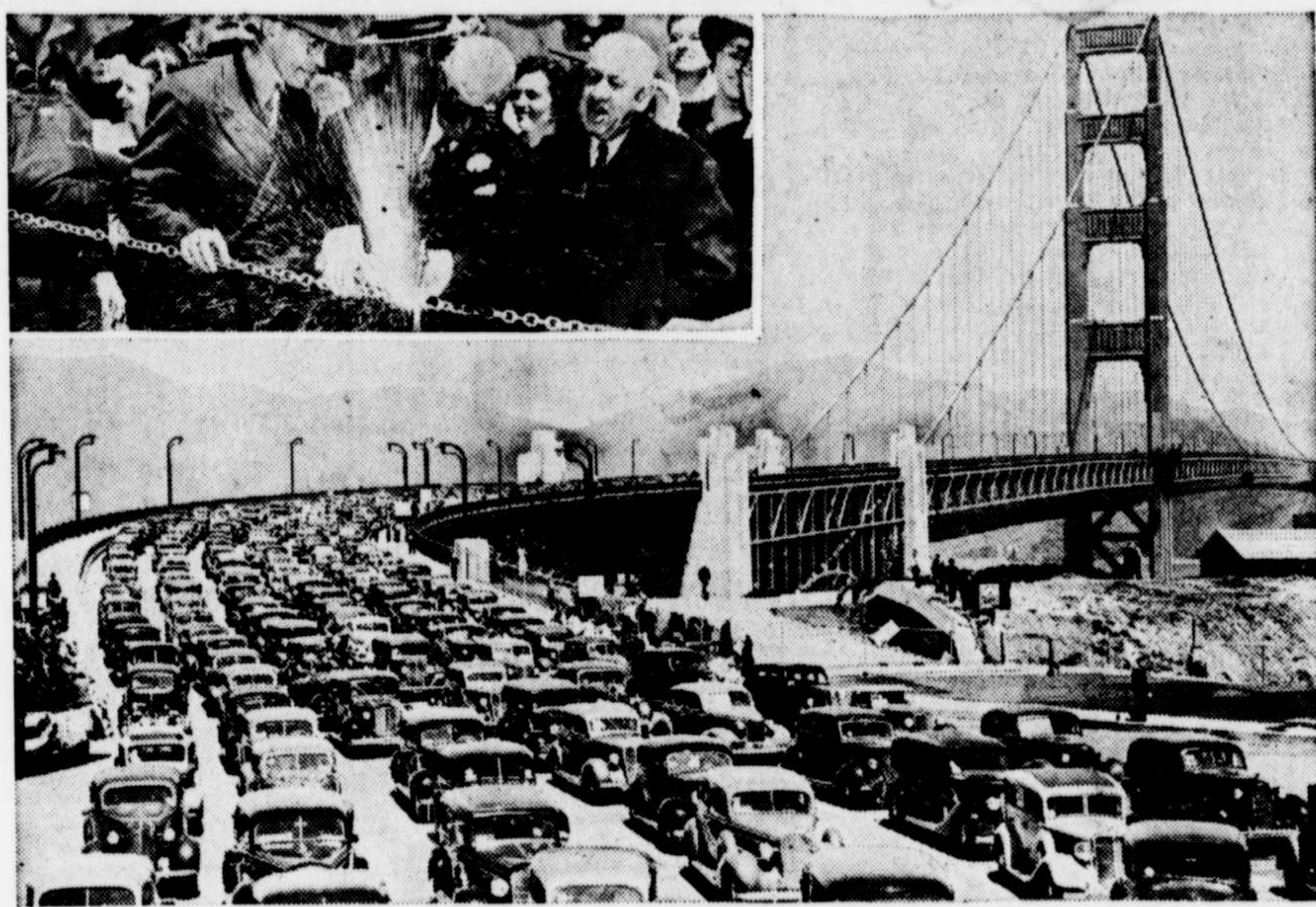
First automobiles shown arriving in San Francisco from Marin county across the Golden Gate bridge, following the recent gala opening of the span to motor traffic. Inset shows Mayor Angelo Rossi of San Francisco cutting a chain with an acetylene torch, thus officially opening the Waldo approach to traffic.