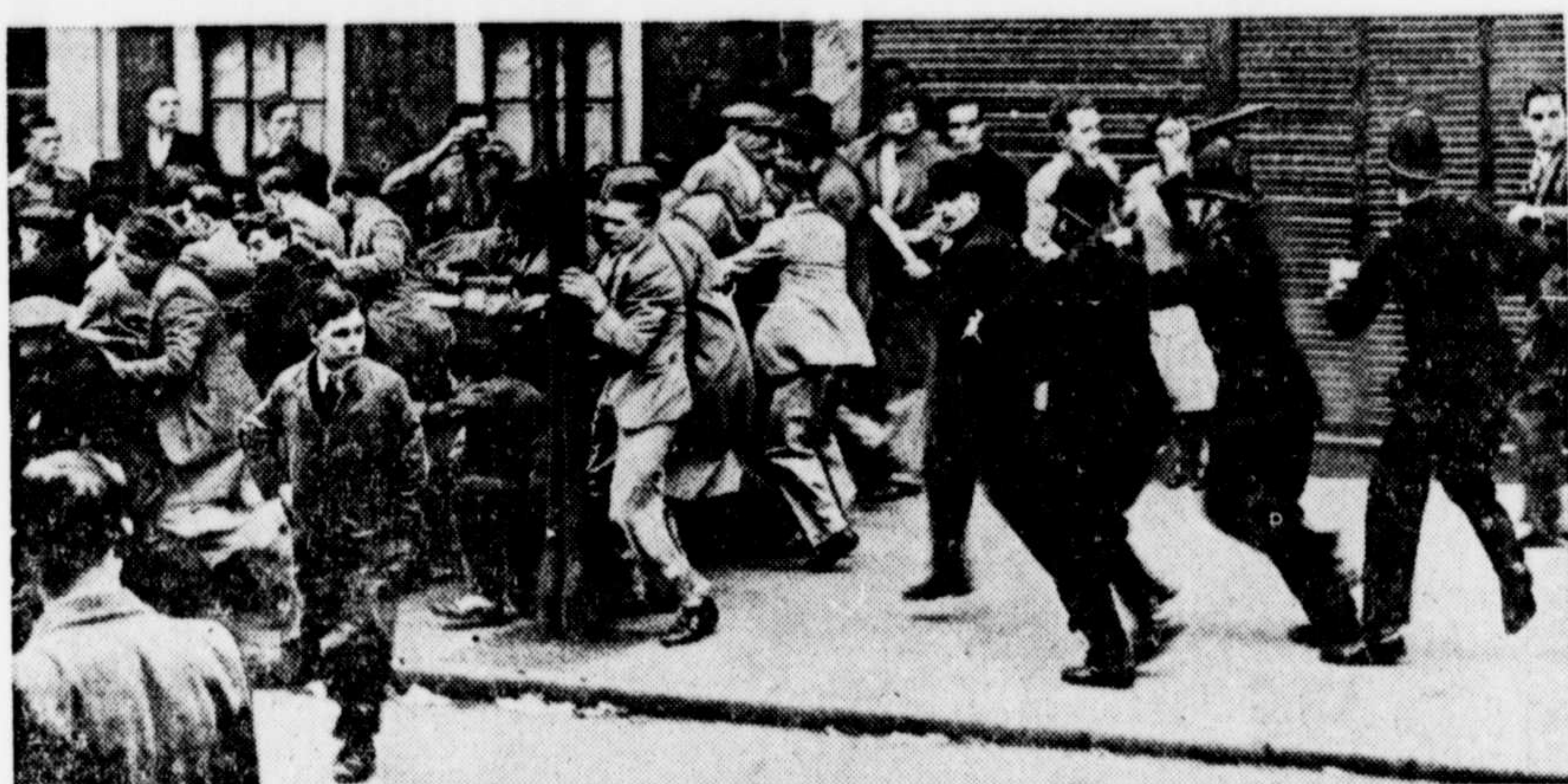
Police dispersing a crowd in London, where the recent attempt of Sir Oswald Mosley to lead a parade of 2,000 Fascist followers to a mass meeting provoked some of the worst street fighting involving Fascists and anti-Fascists since the general strike in 1926. Thirty persons were sent to hospitals suffering from head wounds and scores of others were treated for minor injuries in their homes.