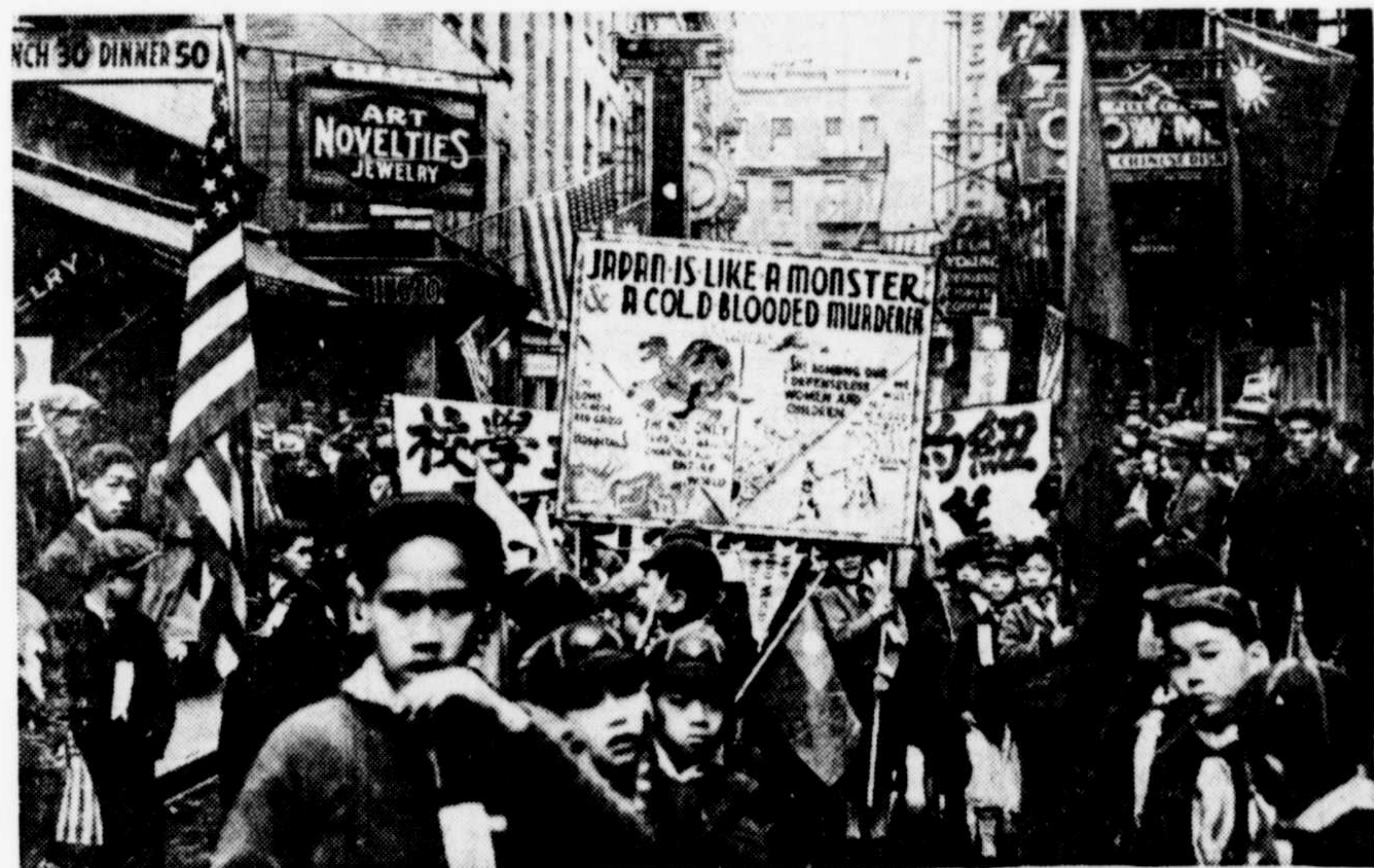
Chinese boy scouts marching along Mott street in an anti-Japanese demonstration in which the inhabitants of New York's Chinatown participated, in a drive for funds to aid war refugees. The boys are carrying a huge banner which relates: "Japan is like a monster and a cold-blooded murderer." Another rallying cry for donations was "Every penny kills a Jap."