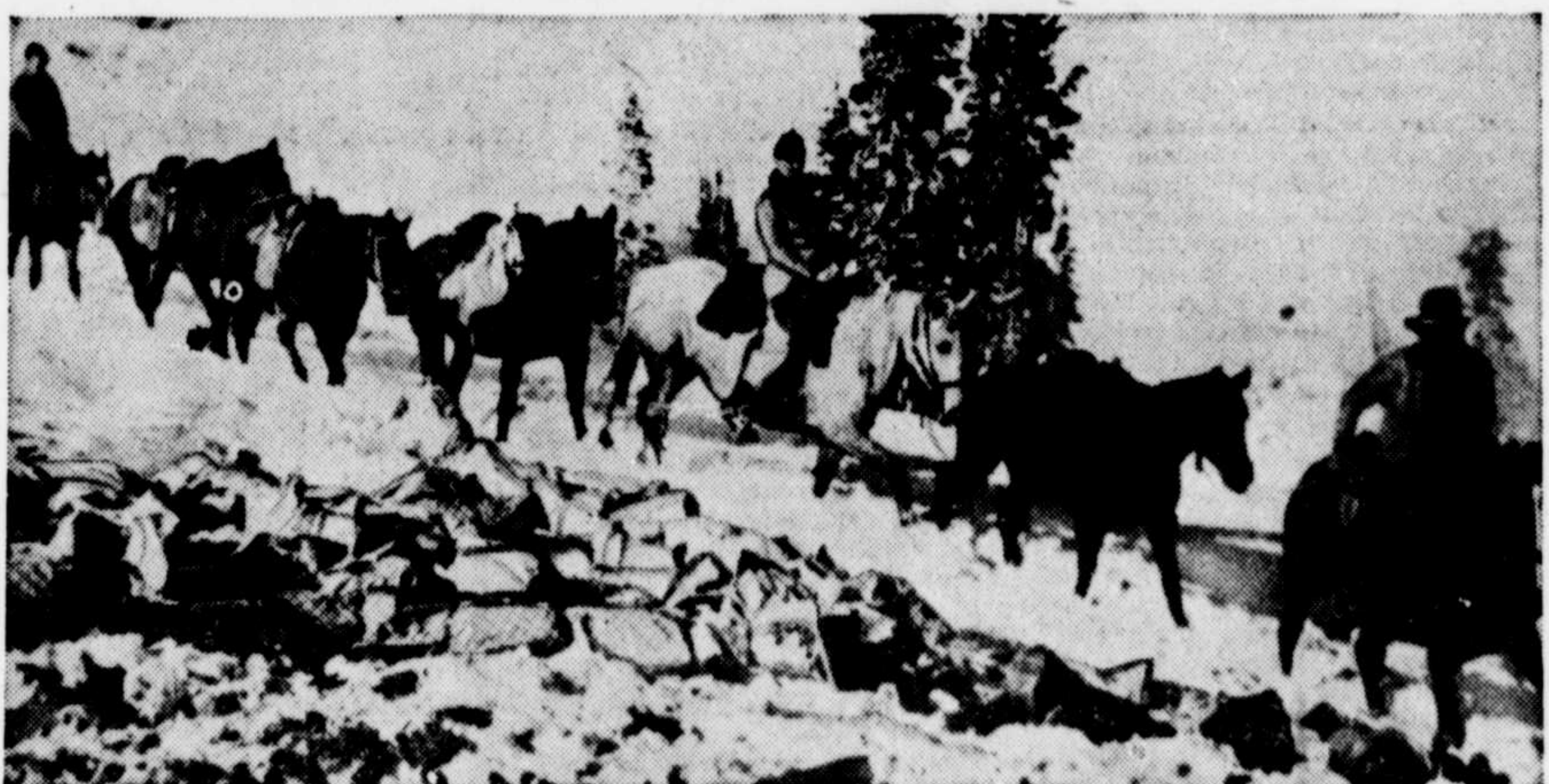
Members of the ground crew at work on the scene of the wrecked airliner in which 19 persons were killed in a crash near Knight, Wyo. The horses were used by the rescuers to carry the victims to Evanston, Wyo., where relatives were waiting to claim the dead.