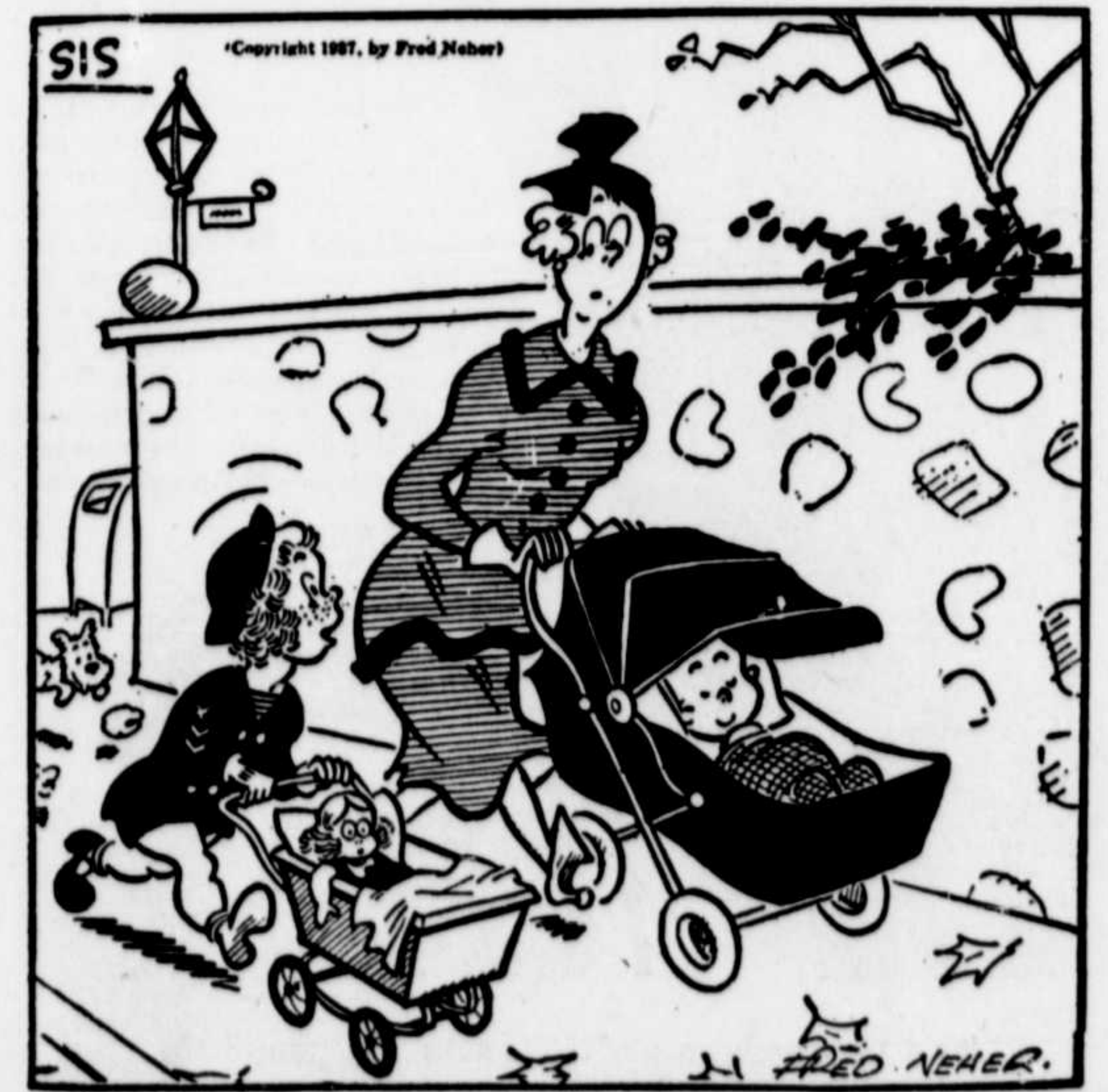
"Does yours say 'Mama' too?"