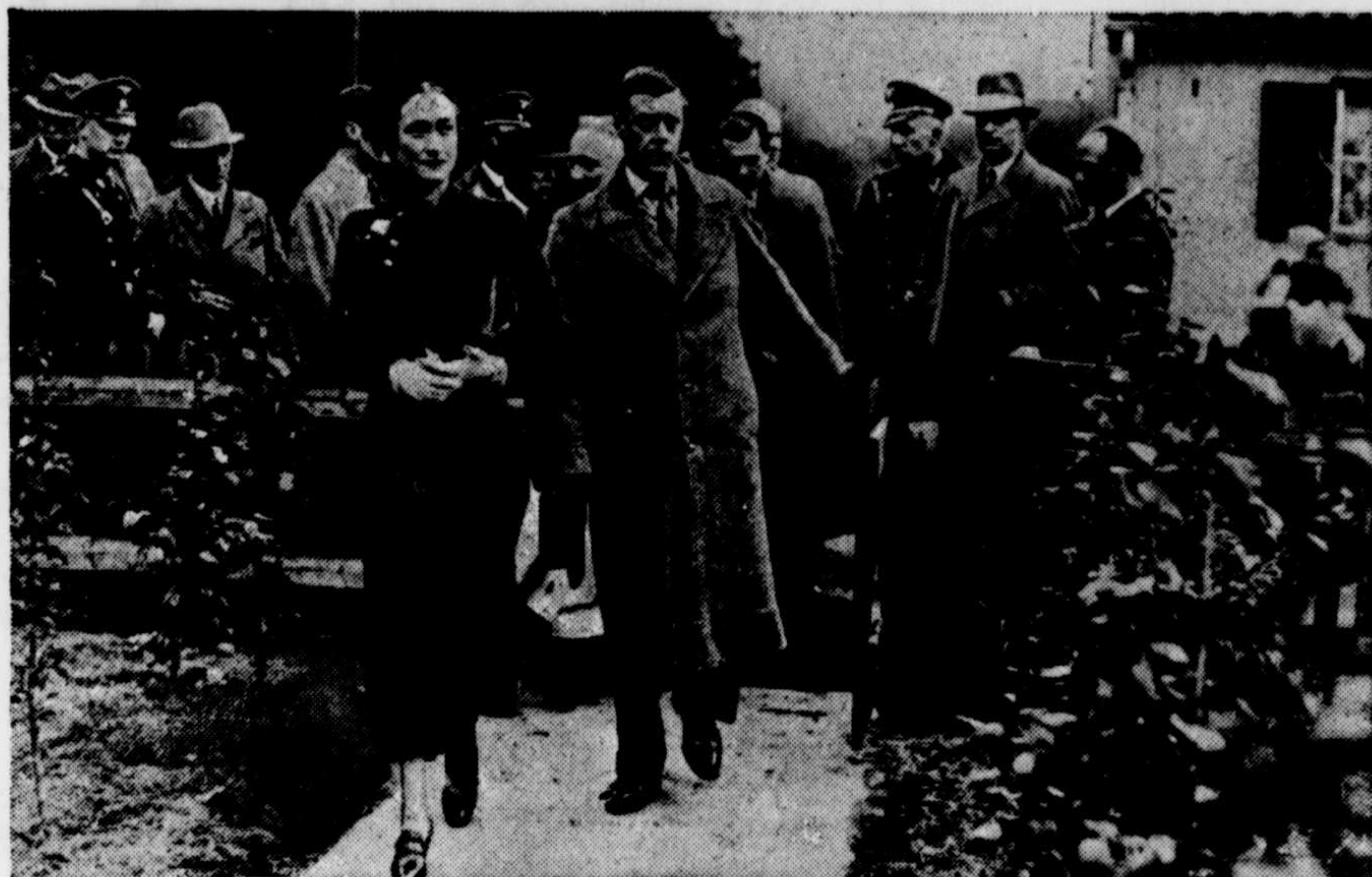
The duke and duchess of Windsor pictured during a tour of inspection of Siemensstadt, the Siemens workers' colony near the great electric factory in Berlin.