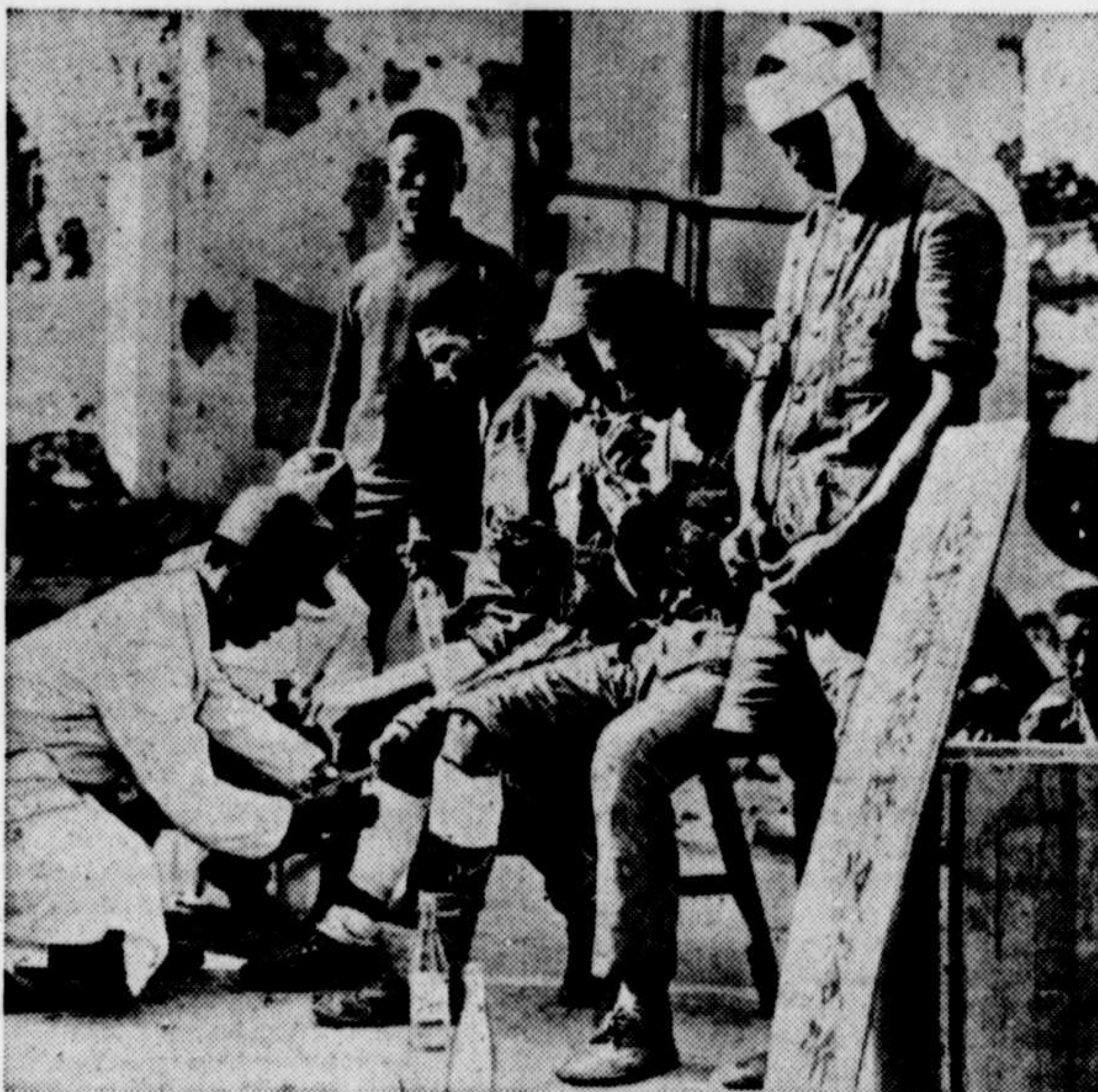
Two Japanese doctors minister to five wounded Chinese captives in the North China area. Notice the candy and pop bottles held by the captives. Can the Japanese be pampering prisoners?