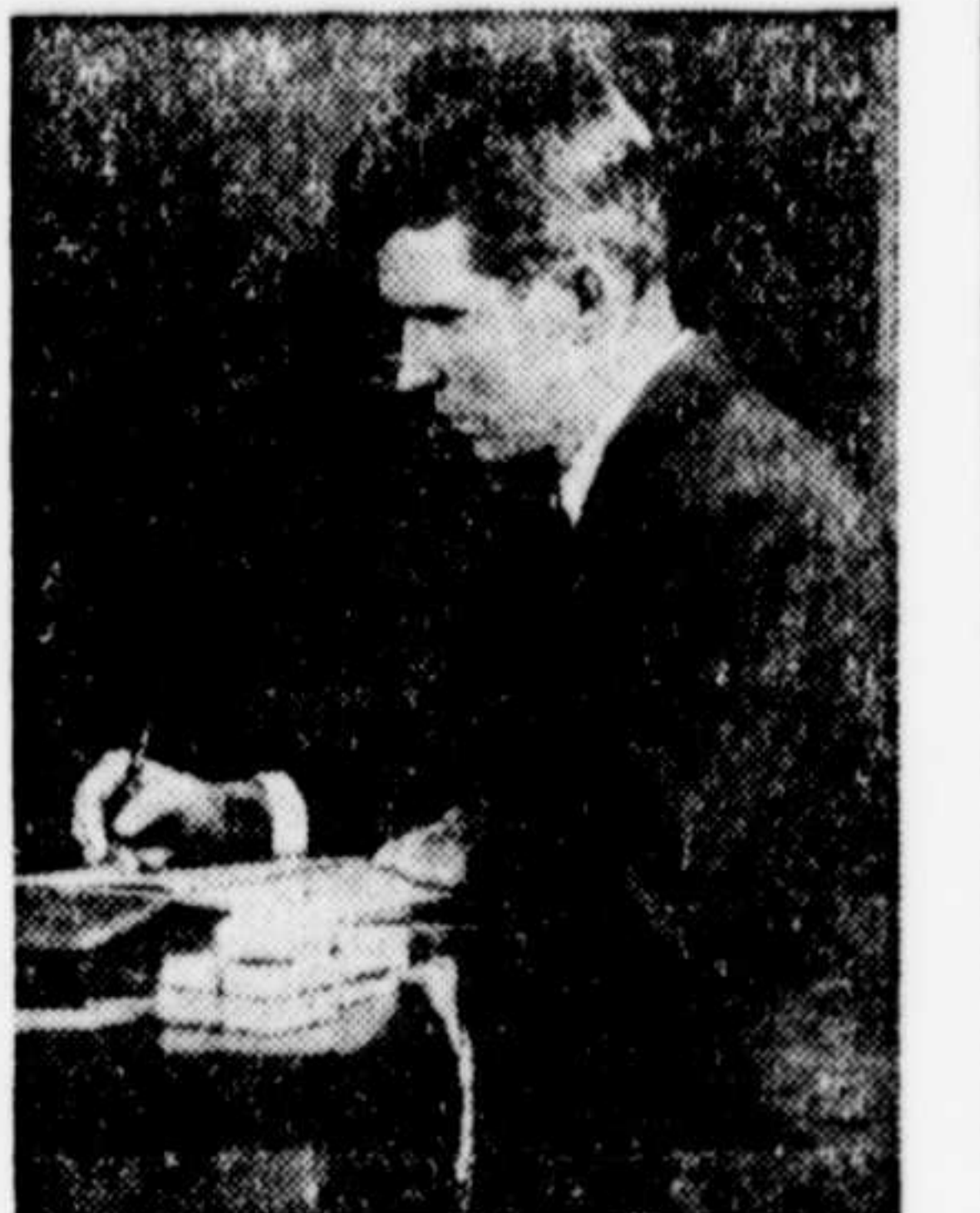
Dr. J. B. Rhine, whose "extra-sensory perception" tests stirred the scientific world.

whether any "guess" he has made is right until he is all through guessing. "The assumption has also been made," says this same writer, "that, in the long run, pure guessing would result in an average score of 5 guesses right out of 25."