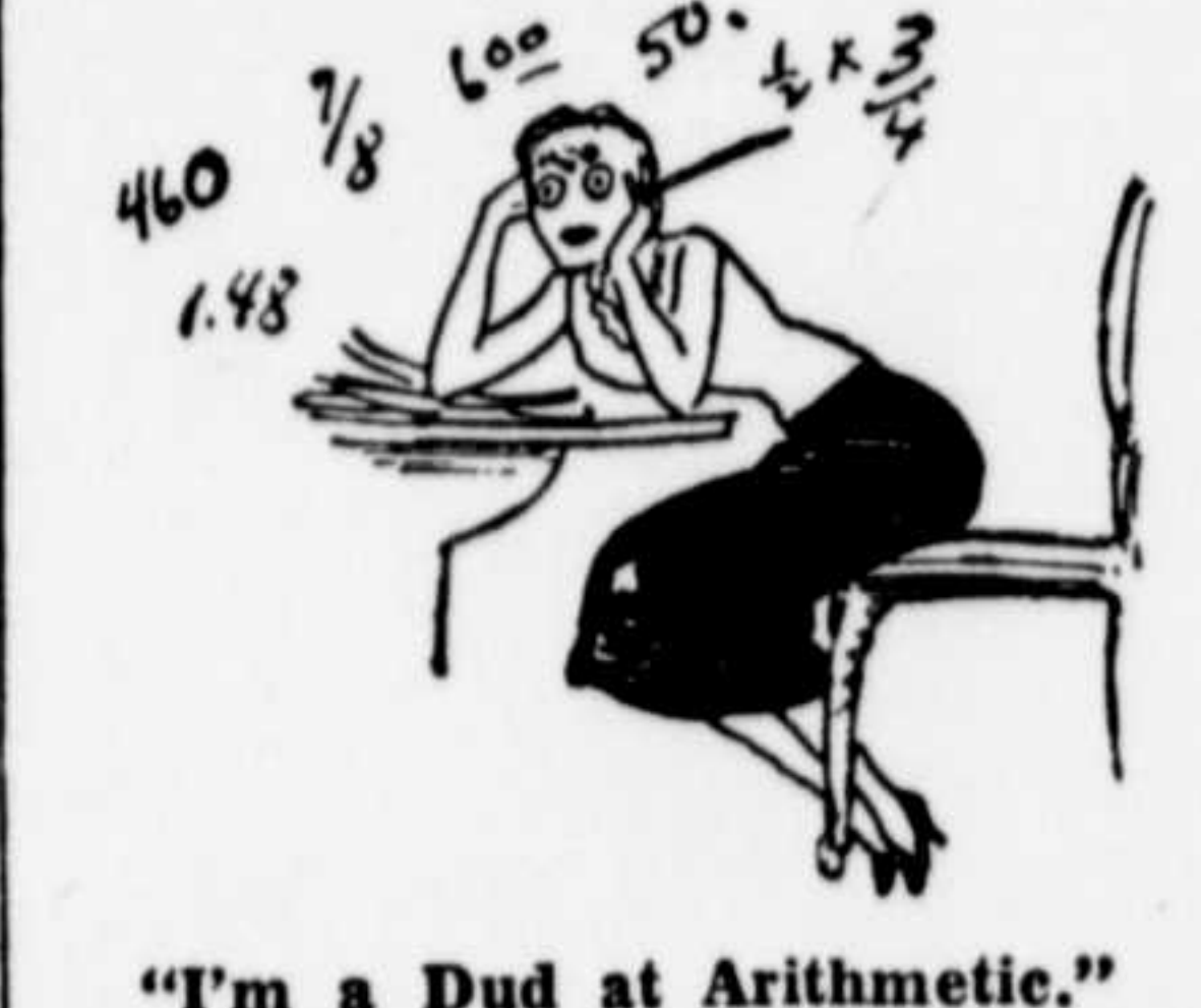
"I'm a Dud at Arithmetic."

Spending money isn't the trouble most of us have! However, every body knows how it is to get enchanted with one piece of beauty and blow our whole budget on it with nothing left over for other more or less essentials. This particular lady knew how it is to get enchanted with one piece of beauty and blow our whole budget on it with nothing left over for other more or less essentials.