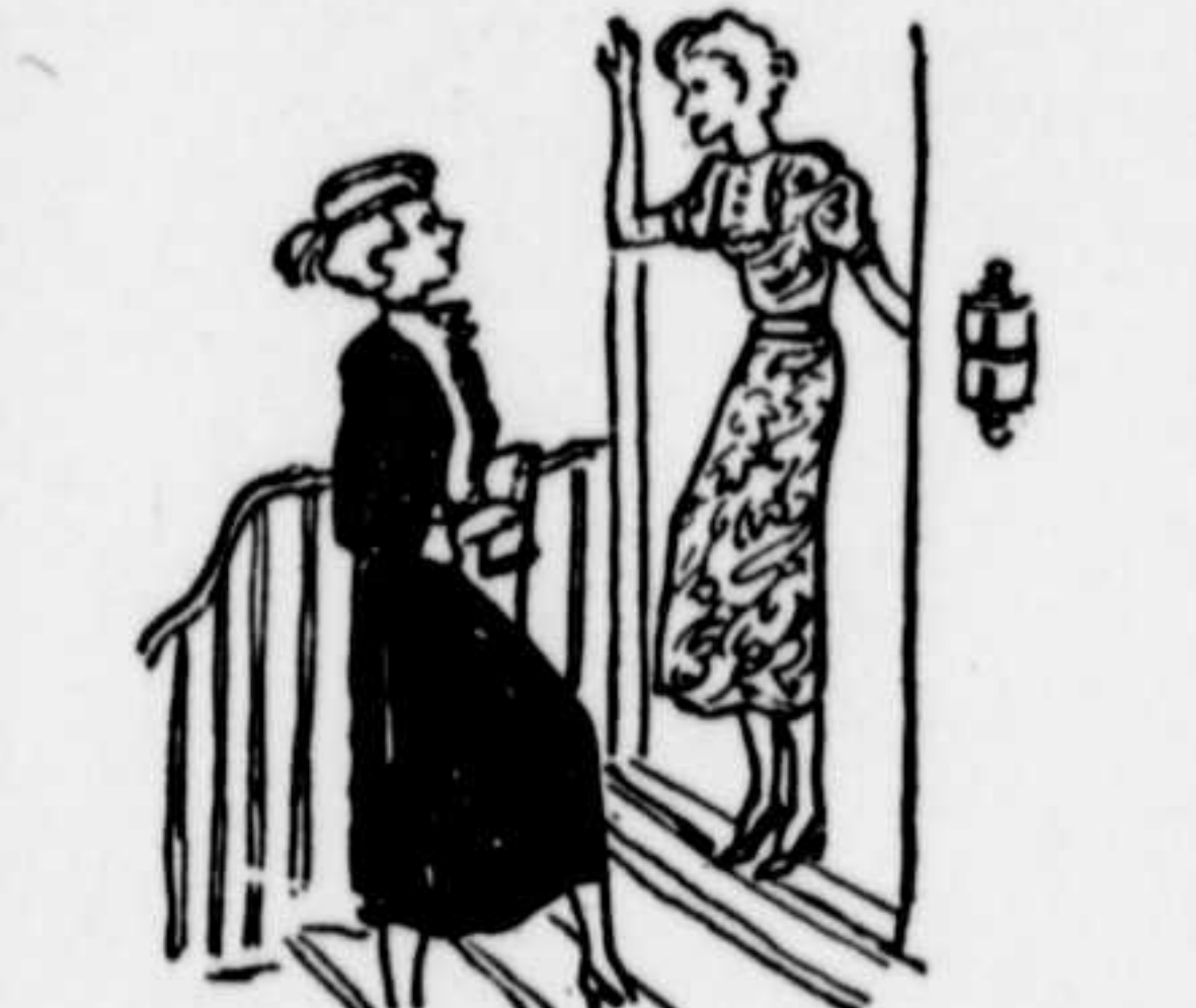
It Sounded Very Glowing.

First an evening or two was spent sandpapering the dark woodwork. Then woodwork and walls and the inside of the door were painted a