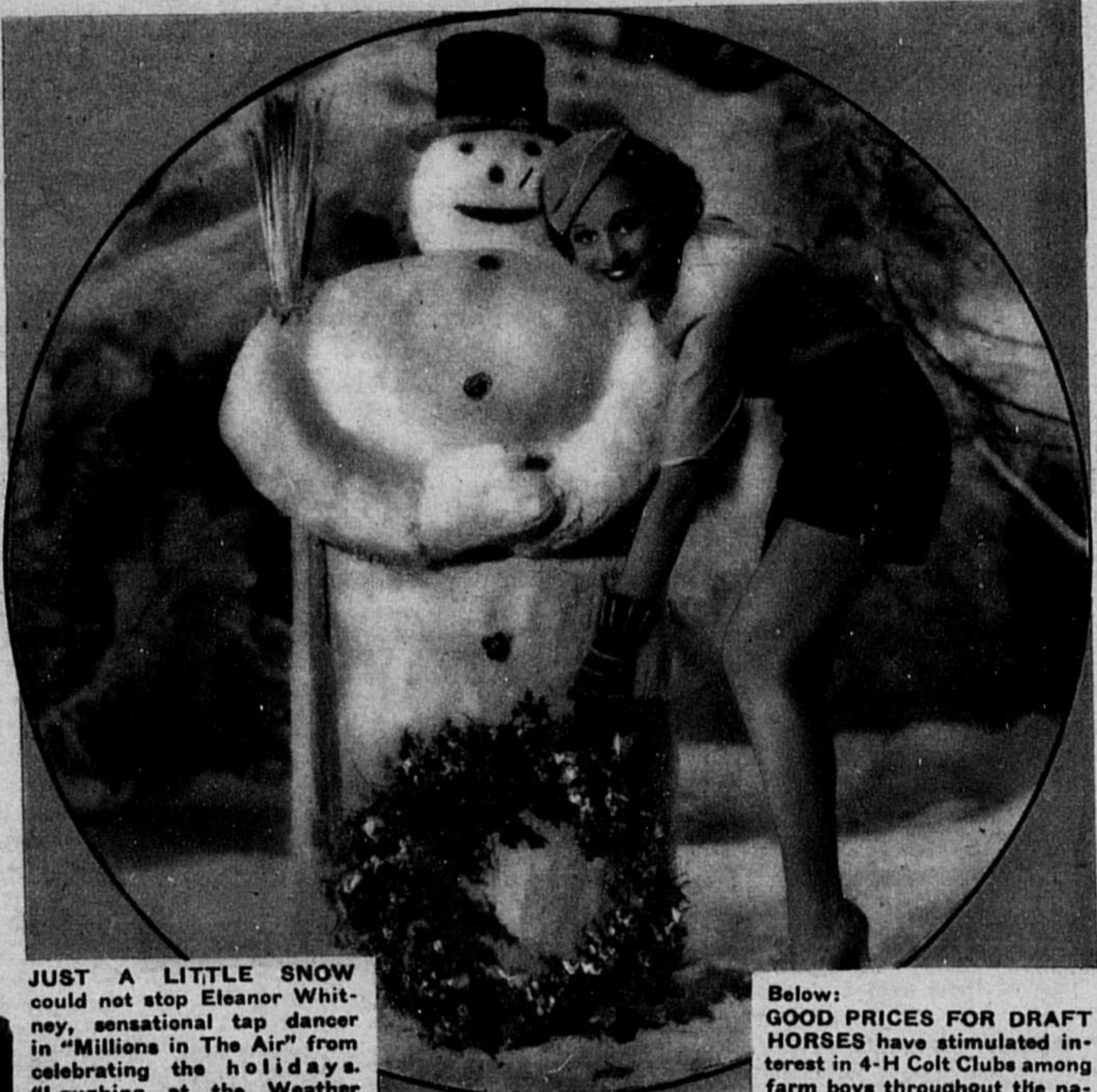
JUST A LITTLE SNOW could not stop Eleanor Whitney, sensational tap dancer in "Millions in The Air" from celebrating the holidays. "Laughing at the Weather Man" is one of the tunes to which Eleanor danced in her first picture.