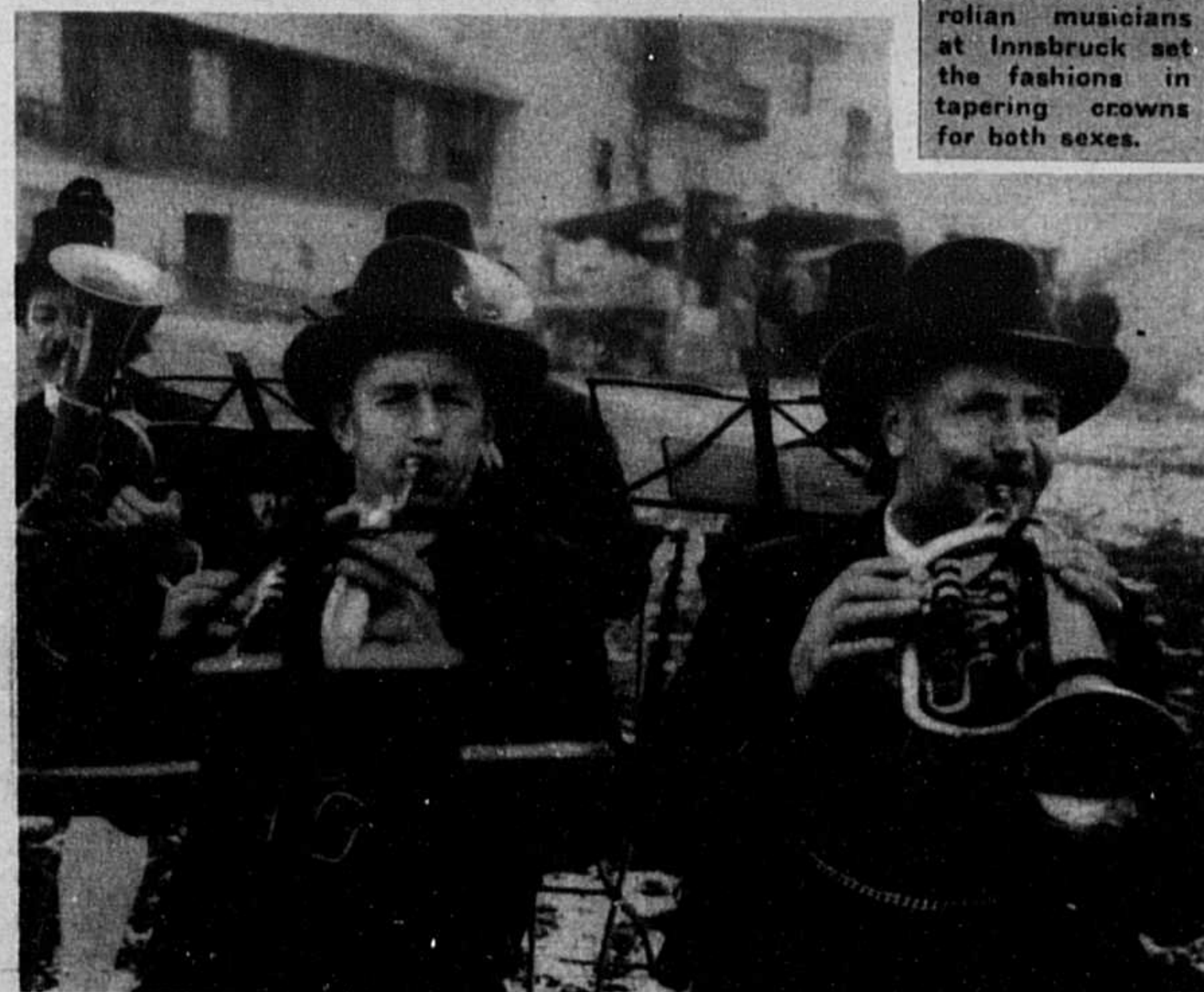
Below: ROUND AND ROUND go music and hats. The sky pieces of the Tyrolian musicians at Innsbruck set the fashions in tapering crowns for both sexes.