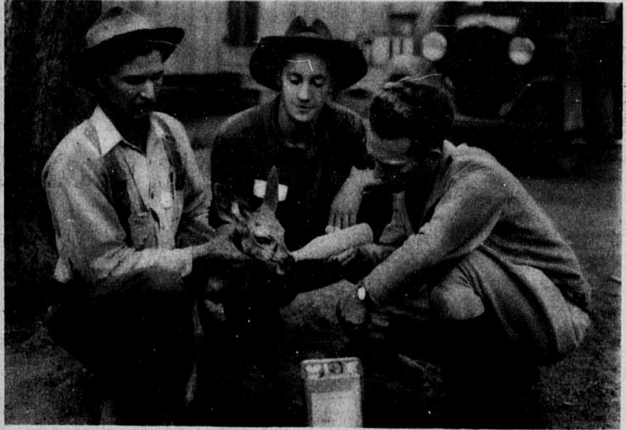
Above: OH DEER! C. C. C. boys doctor and feed a fawn which has been attacked by dogs in between their operations on eroding farm land.