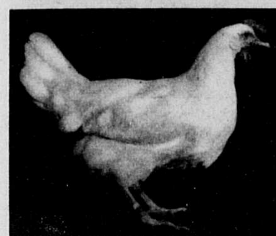
This hen laid 313 eggs in her pullet year.

For seven years, Seven Oaks farm has been the home of 2,000 or more large White Leghorns that average 175