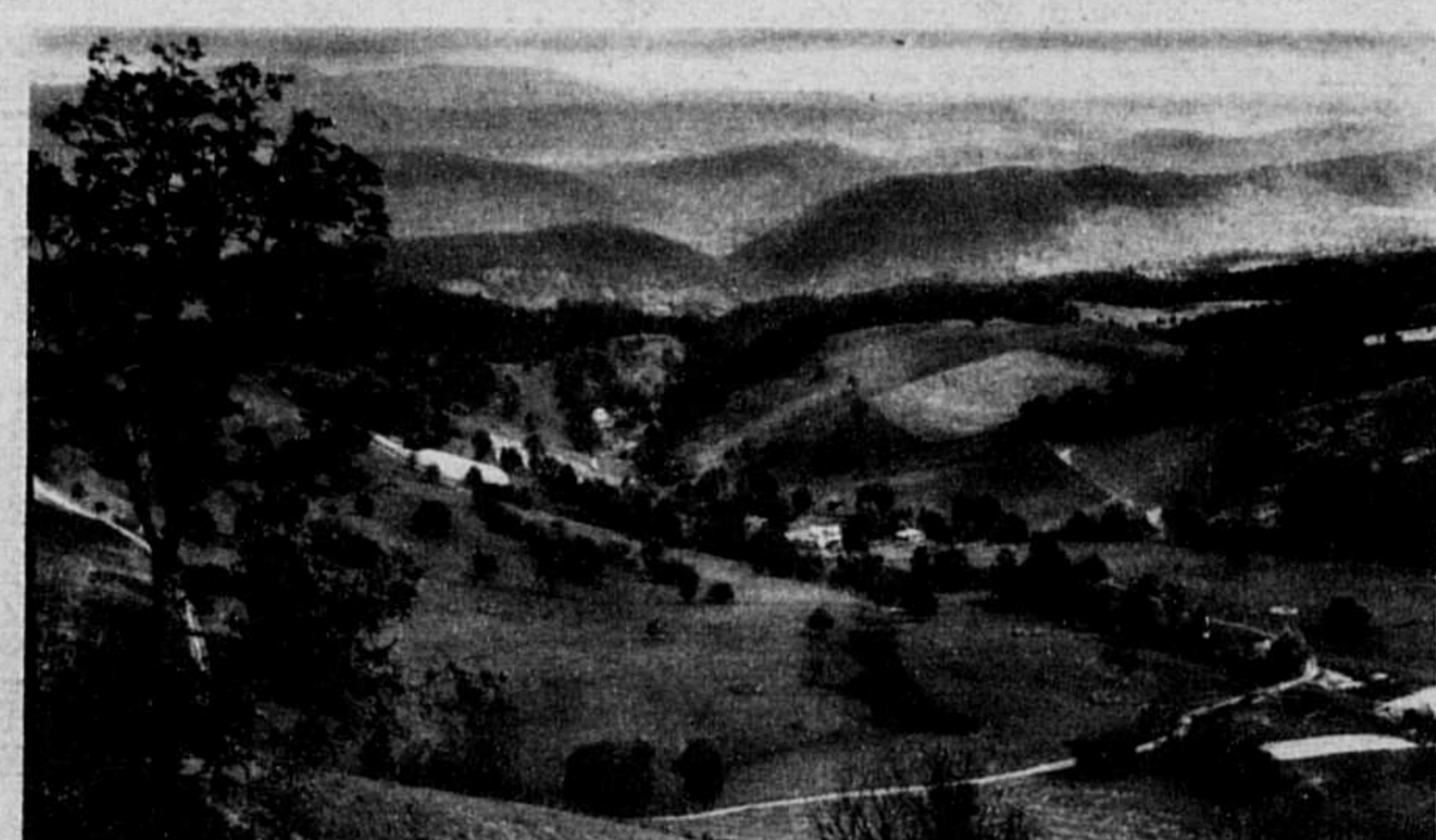
Looking North toward the mouth of Seneca and Roaring Plains, Monongahela National Forest, W. Va. (Photo by U. S. Forest Service).

Roadside stands with vegetables and fruits in season from the farms are common on all thoroughfares throughout the Northeastern states. Some of the farmers