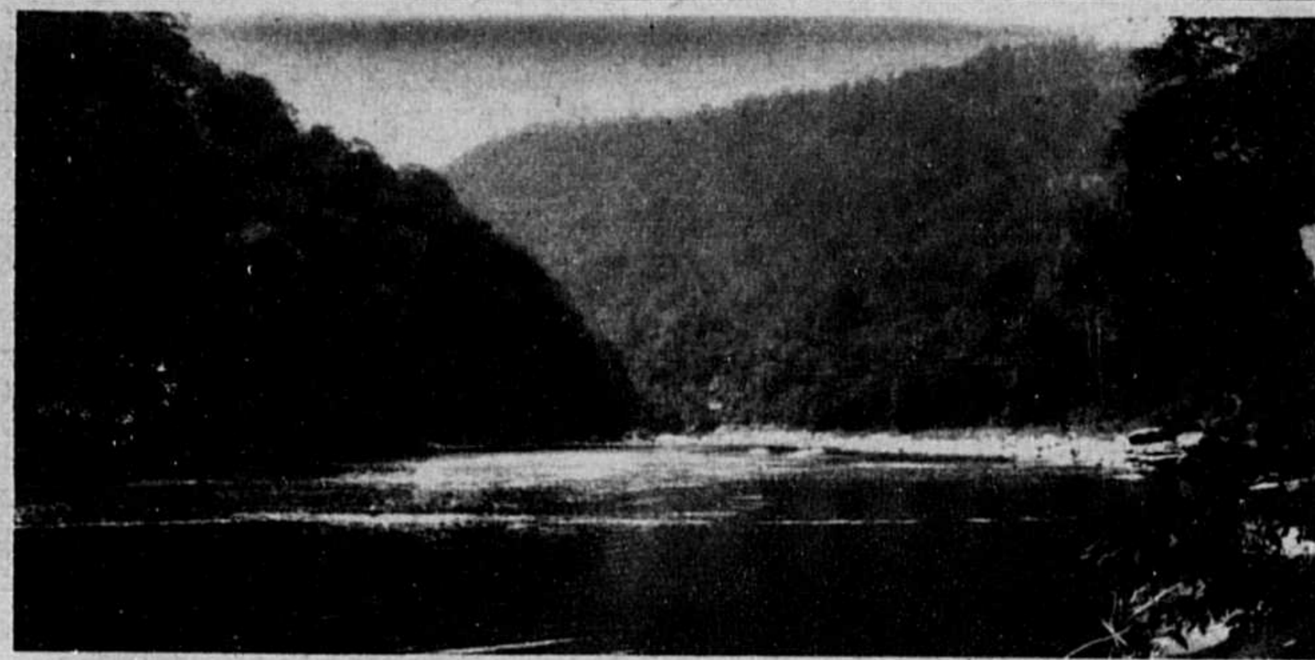
Superb fishing offers a real attraction to the tourist in the "Smoke Hole," Pendleton County, West Virginia, on the South branch of the Potomac.