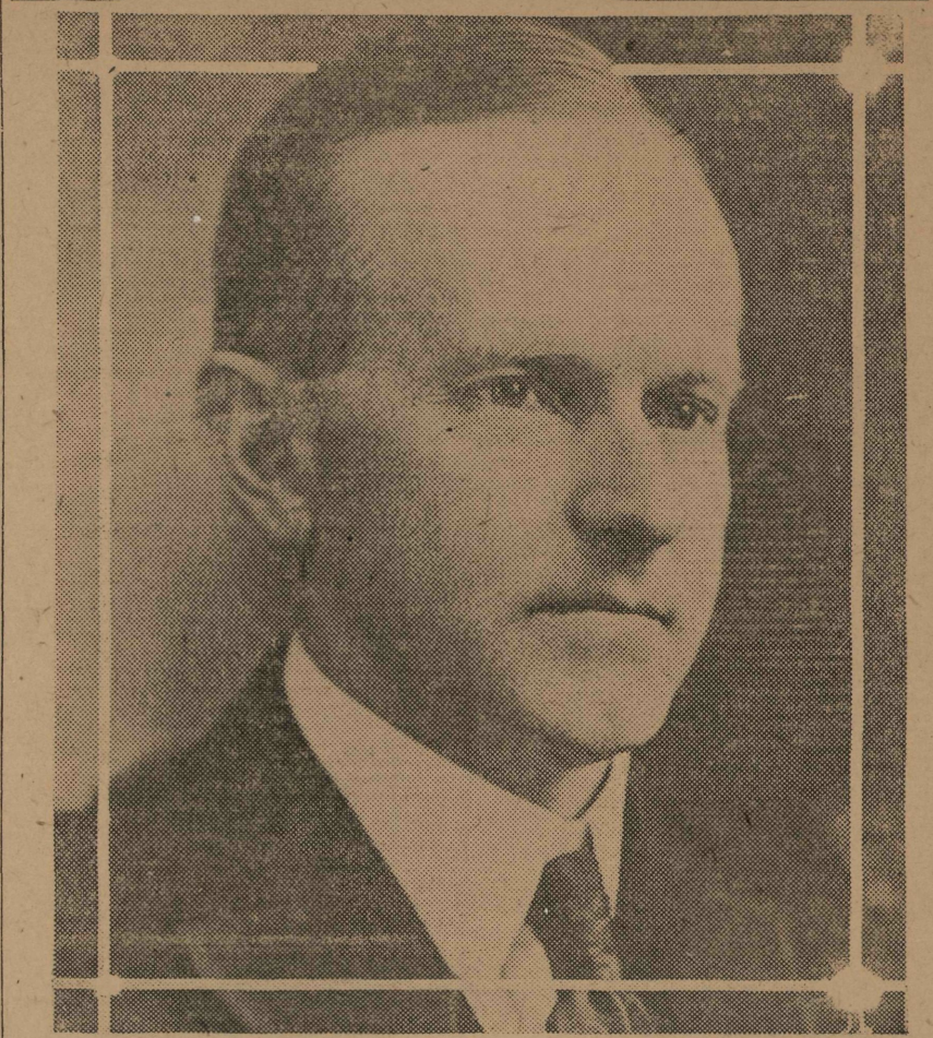
Governor Calvin Coolidge, of Massachusetts, who was elected on Tuesday as Vice President of the United States

"AFTER THE STORM." The results of the election were so decisive in favor of the Republicans that it would seem futile to indulge in any post-mortem examination of the Democratic corpses to determine the "reasons why."