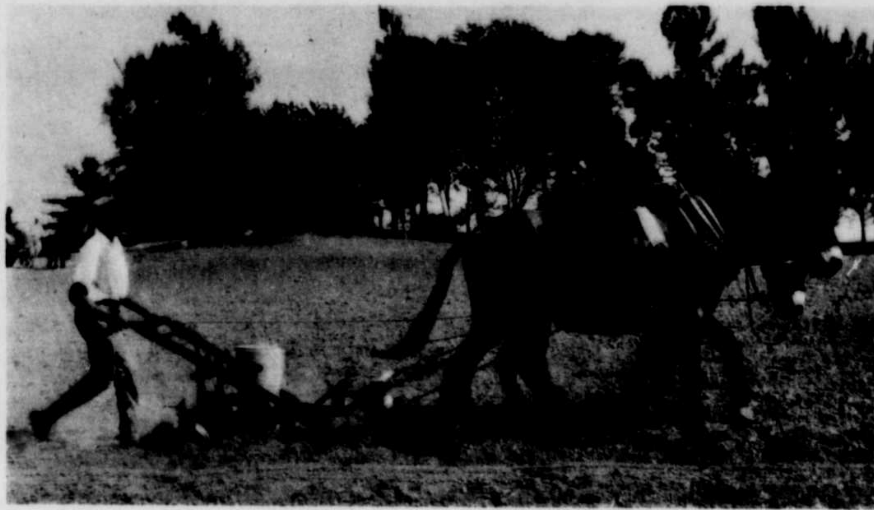
ACTION IN THE TOBACCO FIELD —This type of machine shown here in use in Maryland sows, mixes fertilizer with soil and lists all in one operation.

During this winter farm hands have been getting the highest pay they have received in four years, according to the