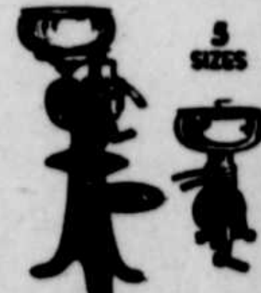
Junior Series World's best low priced separator. Quality machines in every respect.

DE LAVAL The World's Best Cream Separator