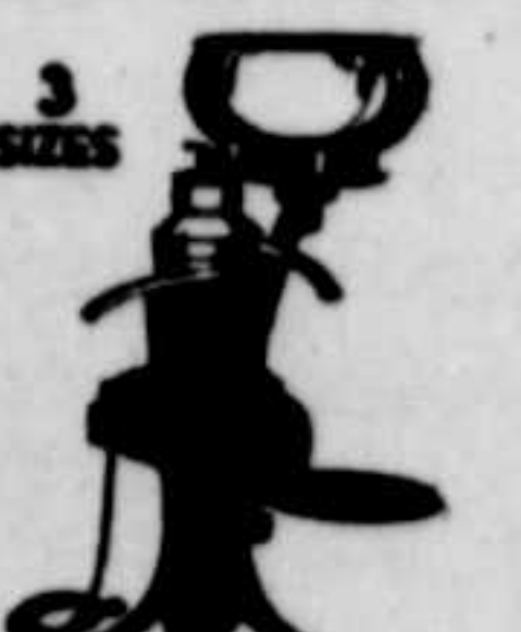
Electro Series The all-electric cream separator. A great machine.

SEE · TRY AND BUY A DE LAVAL FOR AS LITTLE AS $1.00 A WEEK