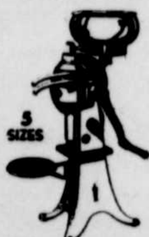
Golden Series A "de luxe" line of De Laval Separators—identical in construction and efficiency with the Sterling Series, with the addition of several convenient, but non-essential, features.

THOUSANDS OF CREAM PRODUCERS (AND YOU MAY BE ONE) ARE LOSING YEARLY ENOUGH BUTTERFAT BY USING CREAM WASTING SEPARATORS TO PAY FOR A NEW