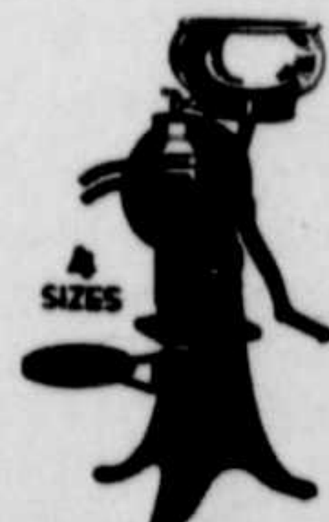
Sterling Series The standard line of De Laval Separators—the best designed, cleanest skimming, easiest running, most durable separator ever made. Hand or power drive.

SIZES 36 to 52 WALTER FIELD CO. CHICAGO ILL.