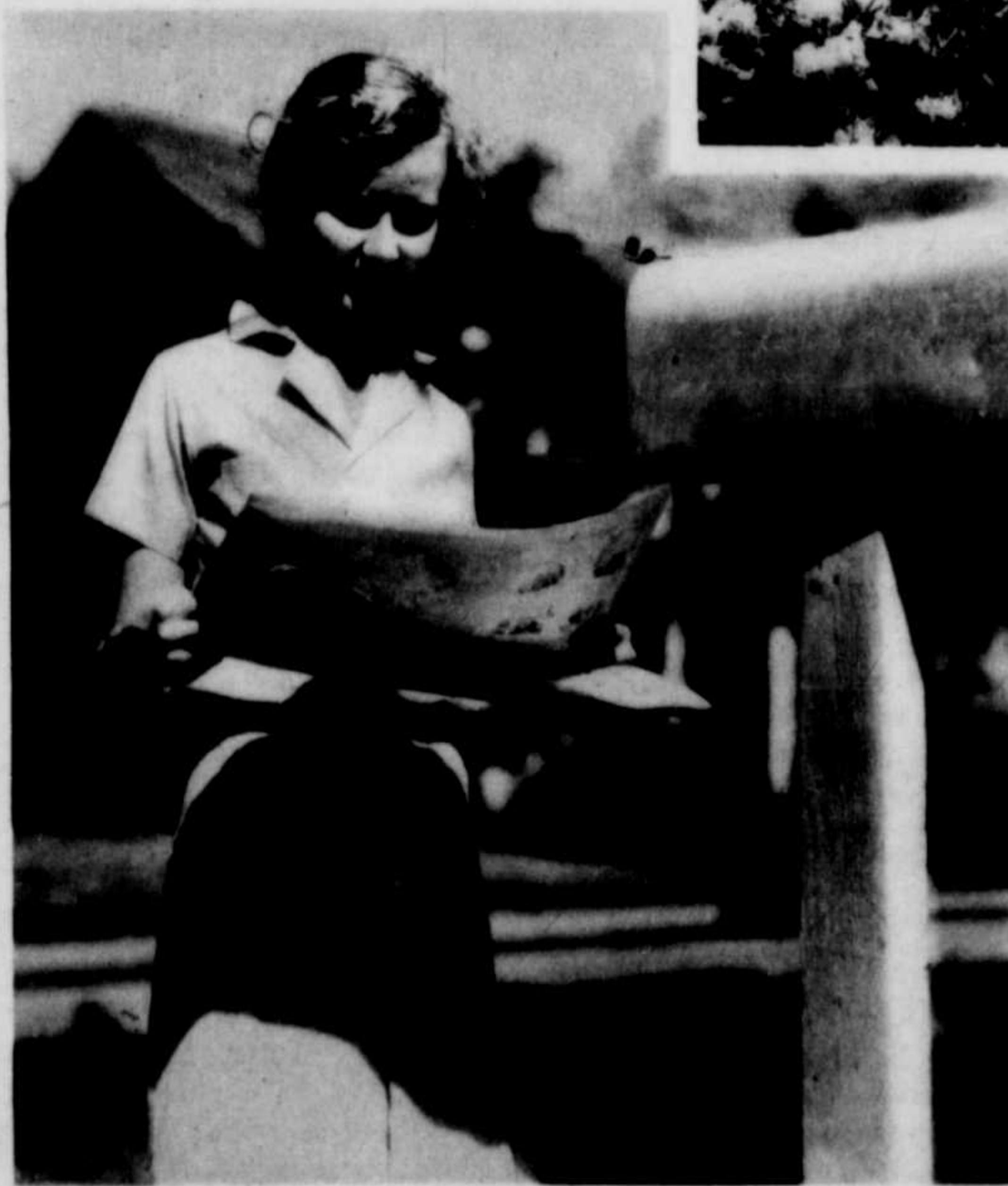
LIKE A FAMILY LETTER, the home newspaper is taken eagerly from the R. F. D. box to be immediately scanned for local news—and for news of the wide world as well. Caught by the camera, as she takes the paper from the box, this pretty farm girl typifies the definite part the community newspaper plays in the farm family's life.