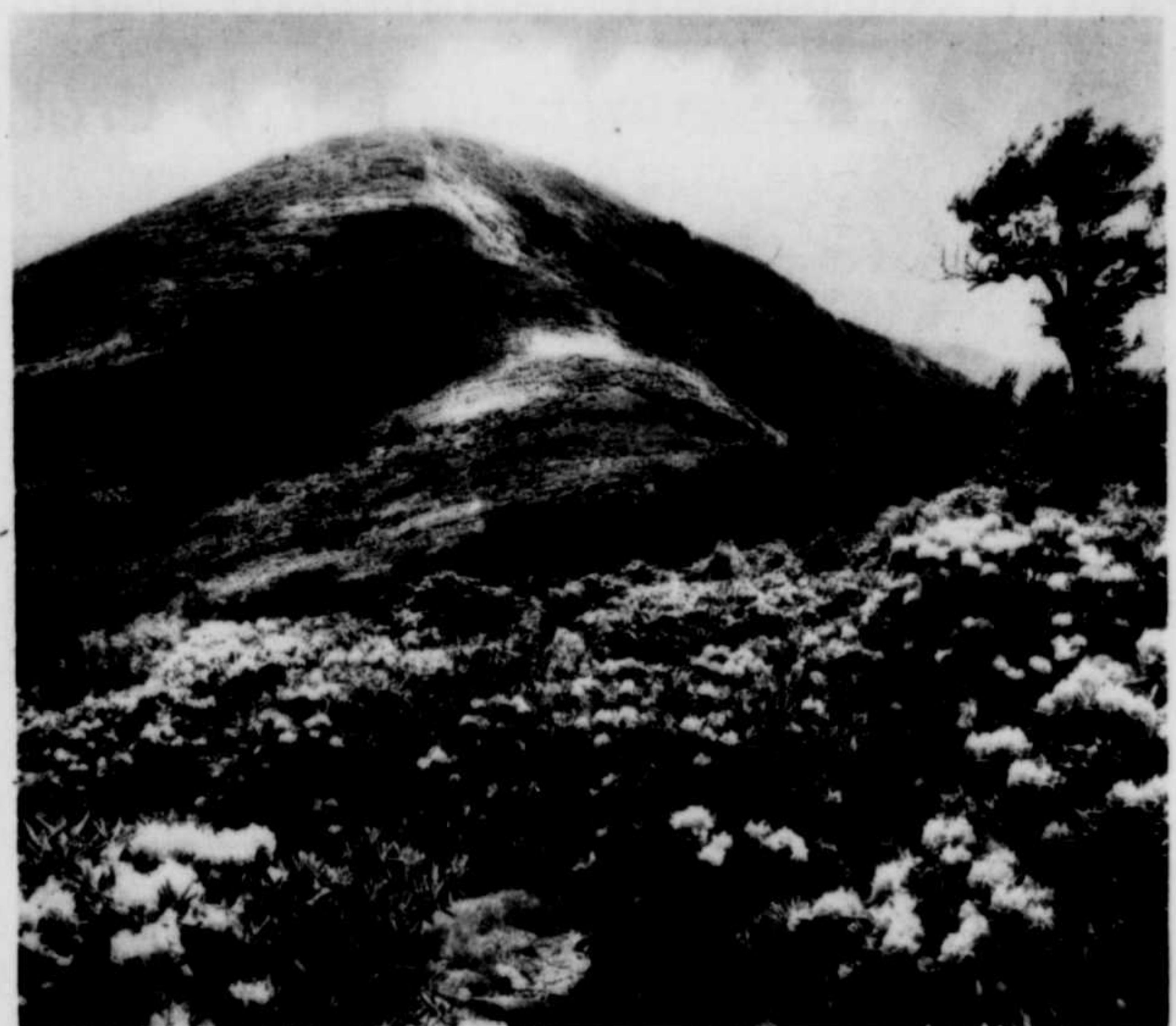
WHEN THE RHODODENDRON BLOOMS on the Great Craggy Mountains, the Southland turns to Asheville, N. C., for the annual Rhododendron Festival, June 15 to 19, this year. Above, the royal blossoms. Below, reigning royalty, the King and Queen of the Rhododendron Kingdom.

(Below) There's excitement, too, in a boat ride through the Stygian darkness on Echo River, Mammoth Cave, Ky.