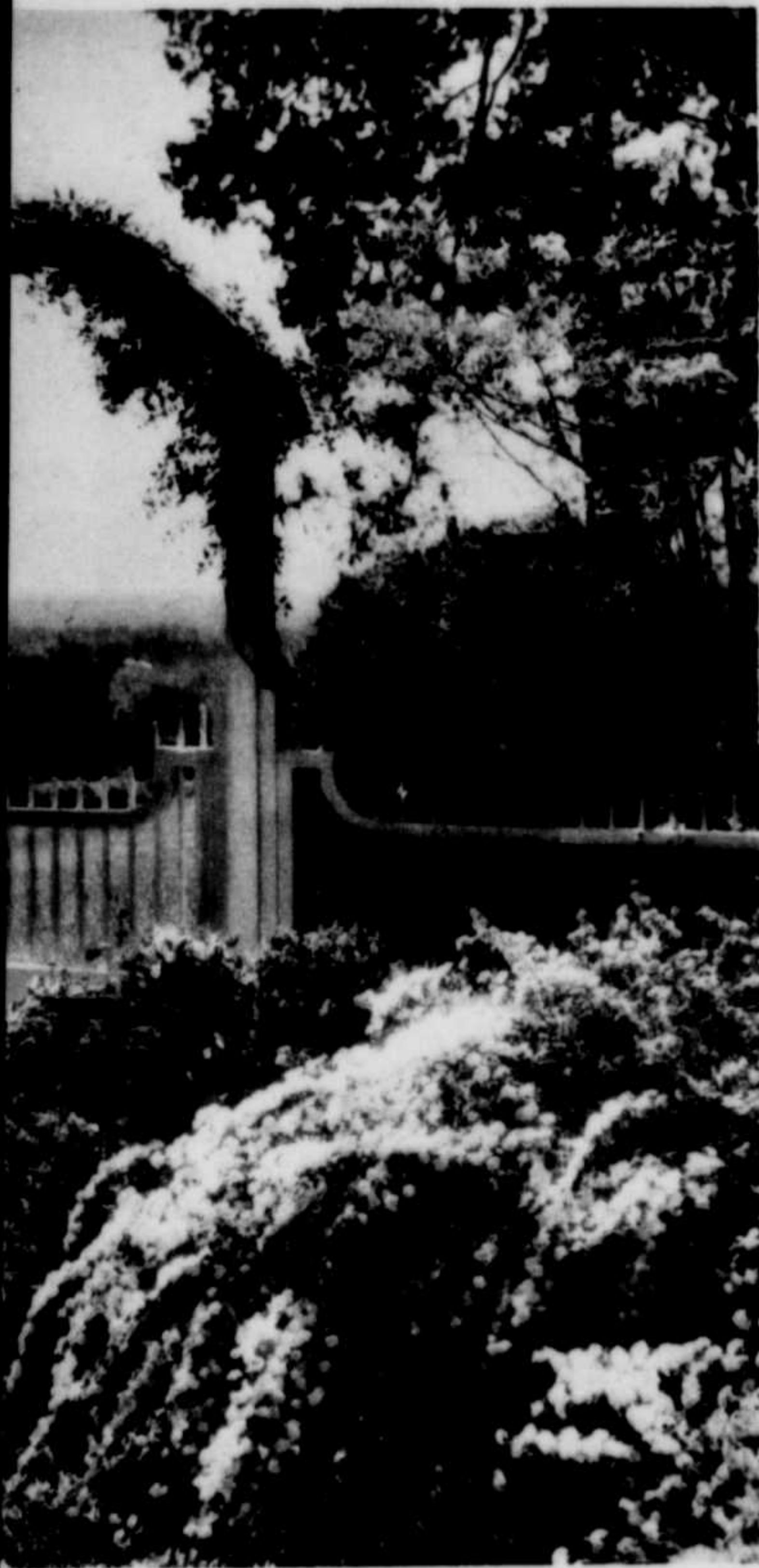
den gate is typical of the improved farm home aided by Dame Nature's hand, give new beauty ect result of a national rural interest in home