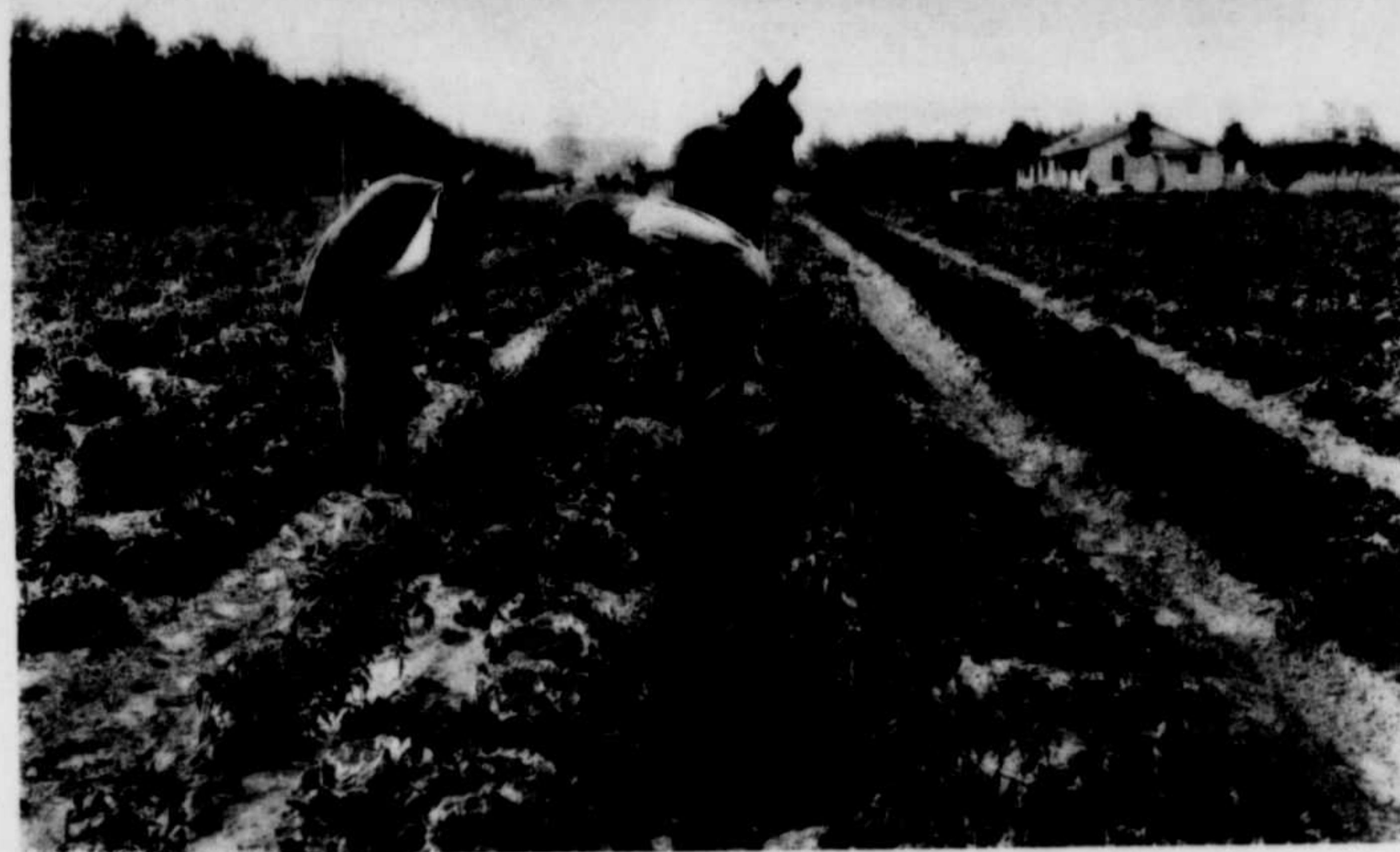
As the 1936 truck season gets underway, county agents are busy assisting farmers throughout the South. In this case, the extension worker inspects a field of tomatoes and lettuce, intercropped, near Castle Hayne, N. C.

Increased Chinese demand for foreign cotton is in prospect according to reports from Shanghai. The Chinese crop in 1935 was about 25 per cent smaller than in 1934. Mill consumption is expected to be about the same as for 1934-35.