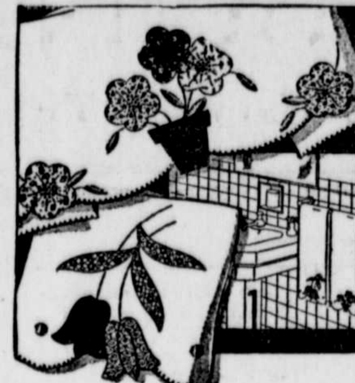
Pattern No. 5348

Let us do a bit of "gardening." It's linens we're going to beautify, with cotton patch flowers and flowerpots. This easy applique is sure to enhance a pair of pillow cases, scarf or dainty hand towels. Take colorful scraps, cut them into these sim-