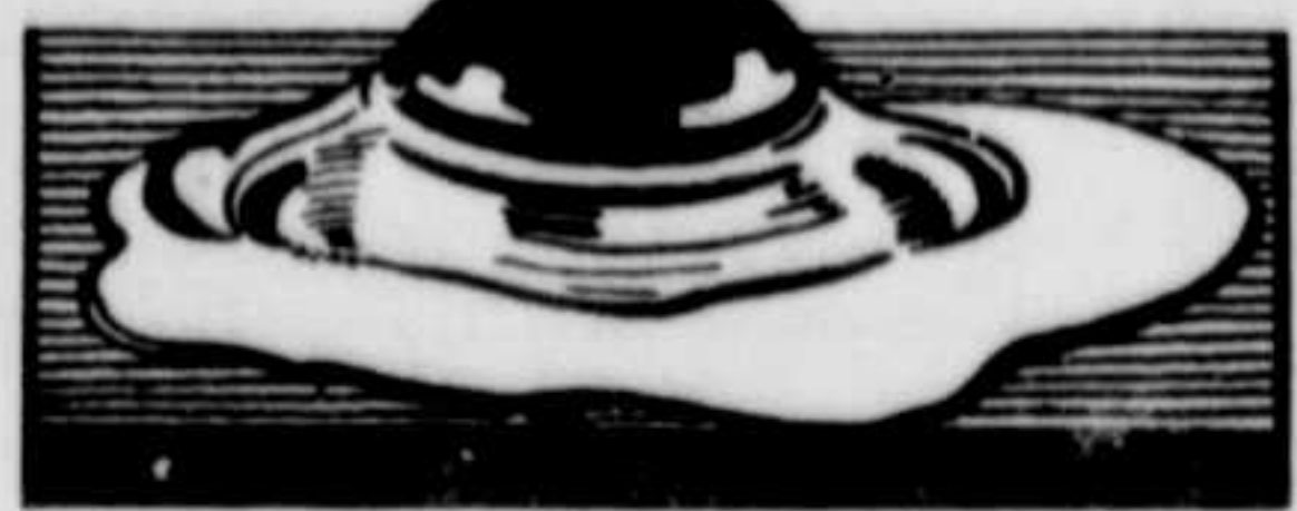
PREMIUM QUALITY EGG. (FIRM, UPSTANDING)