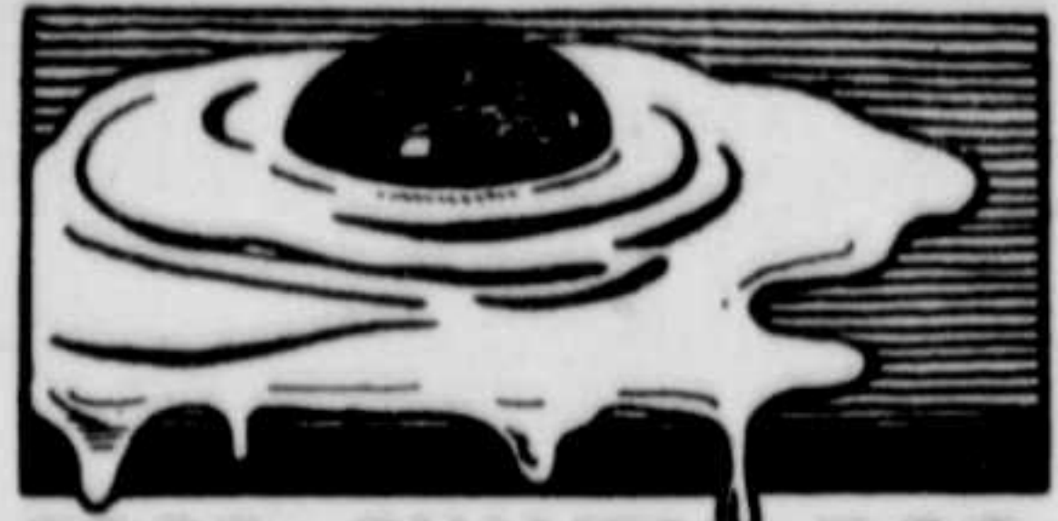
POOR QUALITY EGG. (THIN, FLAT)