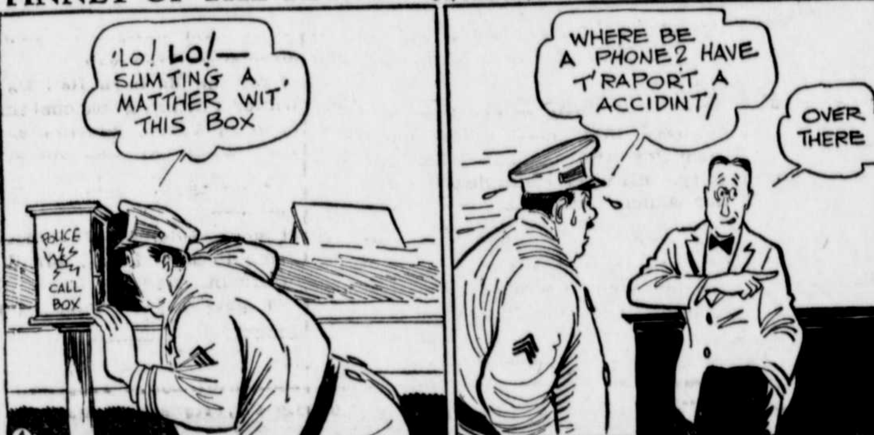
Figure It Out