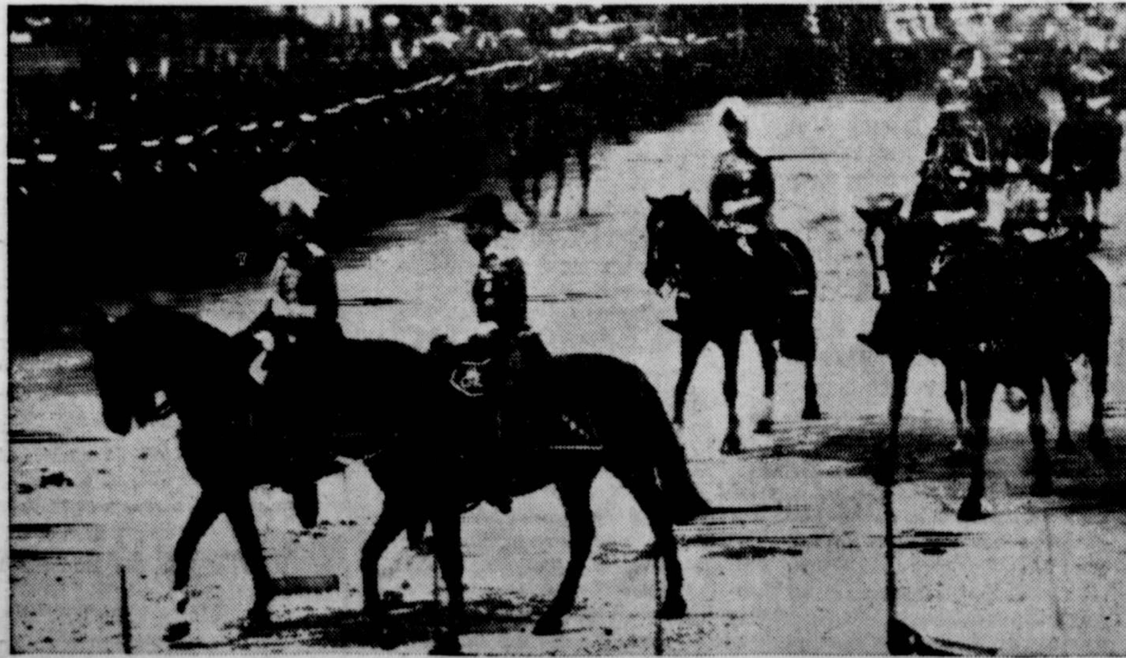
London.—Mounted on prancing chargers in gorgeous trappings, the foremost nobles of all the British empire, garbed in colorful uniforms, ride to the coronation of their monarch.