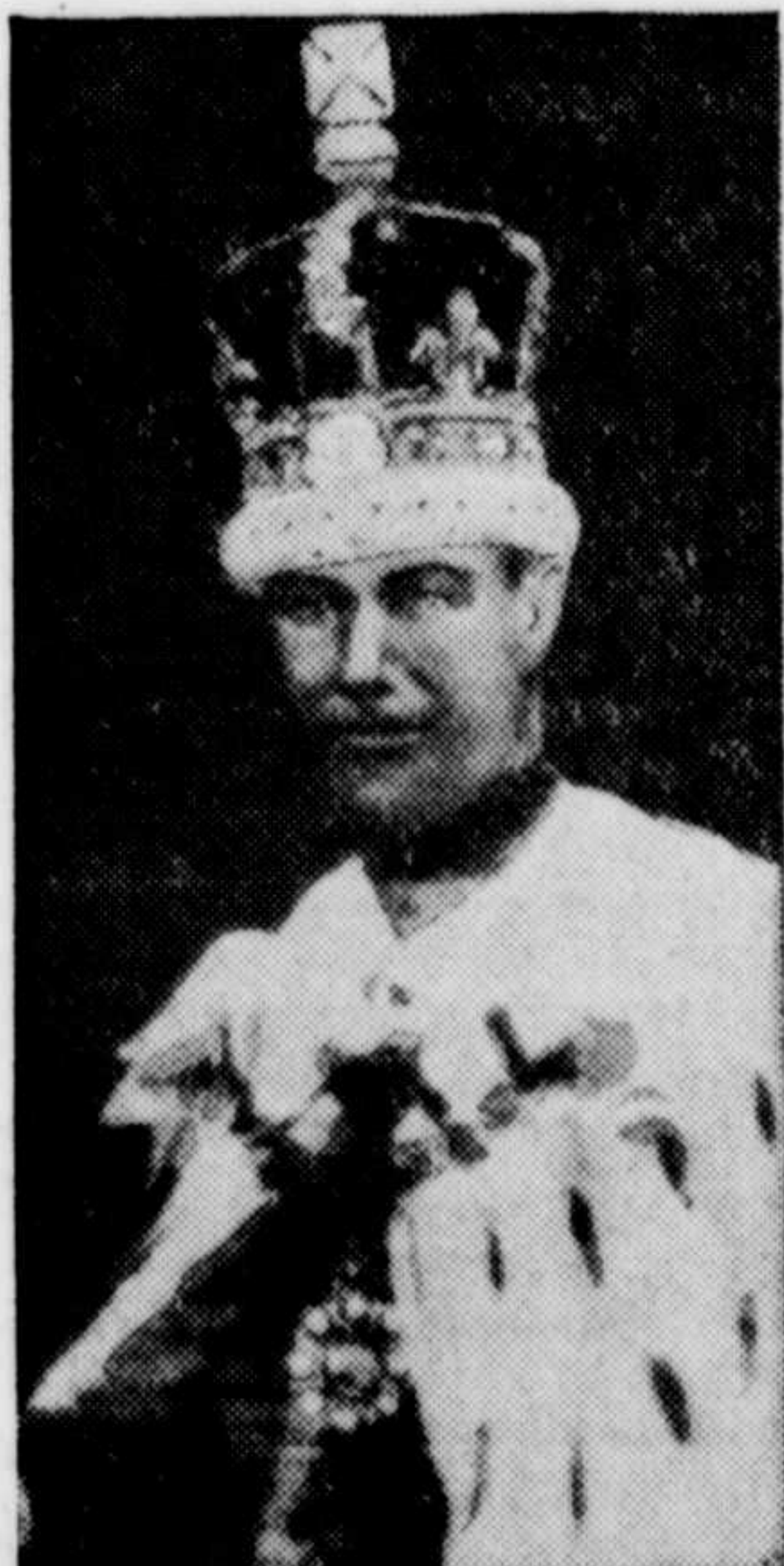
London.—King George VI, newly crowned, as he appeared to the throngs after coronation.