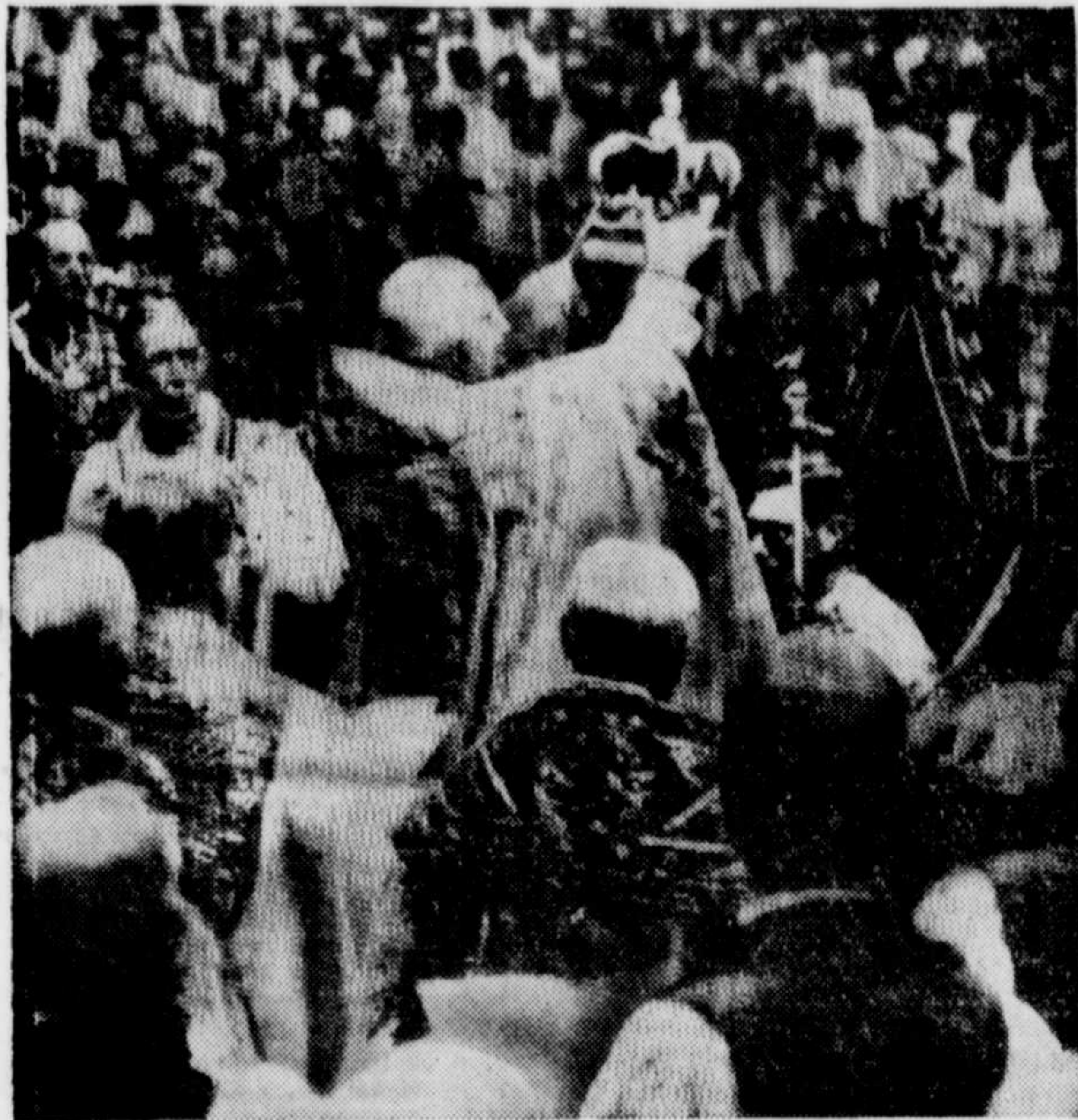
London.—In the climax of the coronation ceremony, the archbishop of Canterbury places the Crown of Edward the Confessor upon the head of George VI, his hands trembling with emotion.