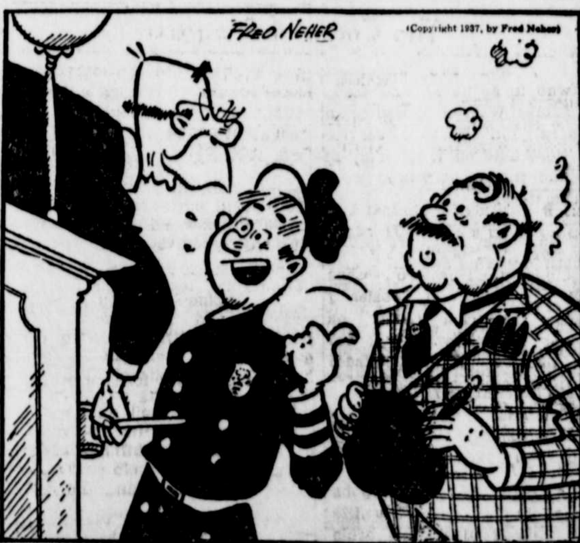
"The charge is taxidermy, yer honor . . . he was stuffin' ballot boxes!"