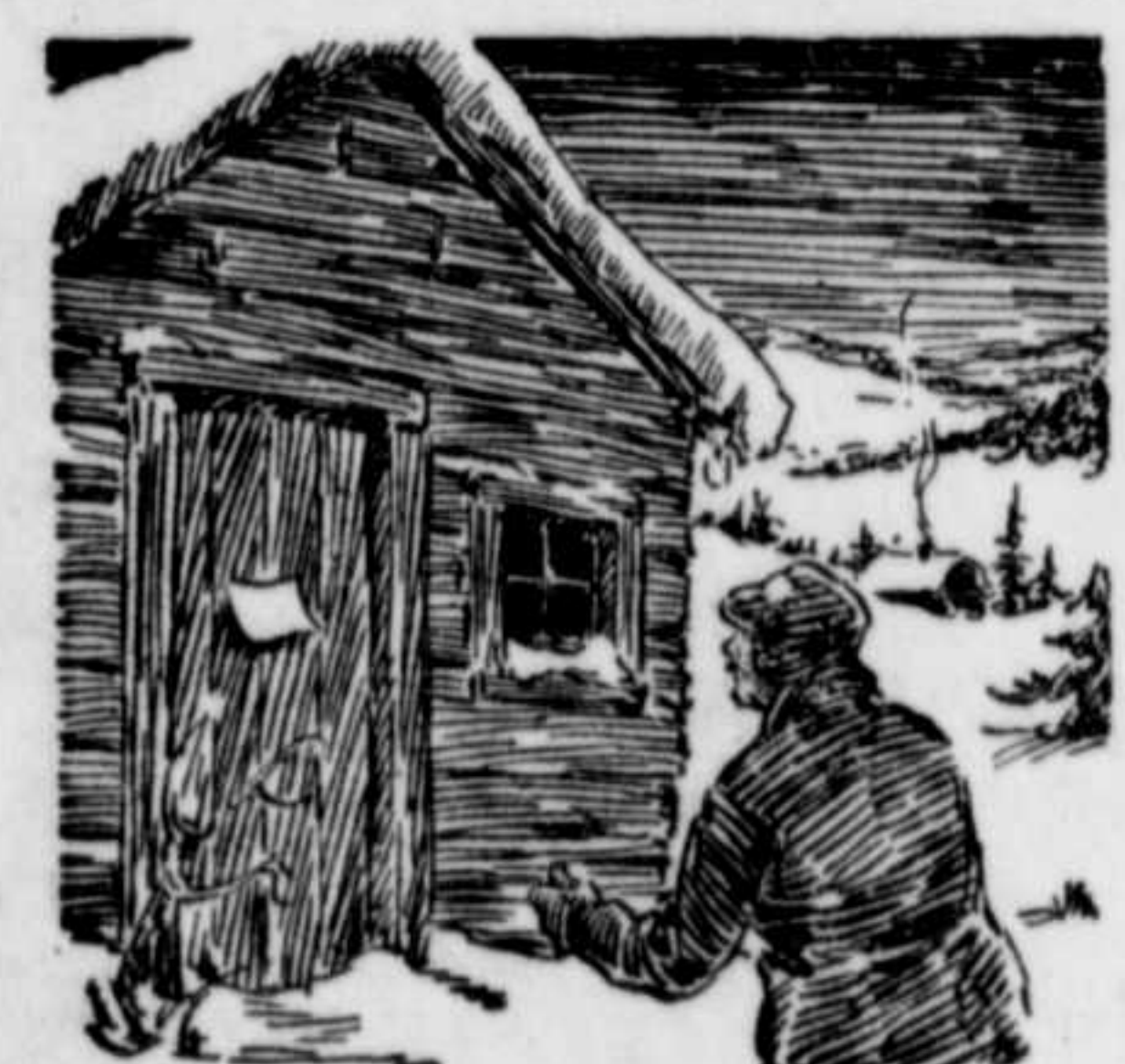
He Noticed Something Like a Card Tacked on Hathway's Door.