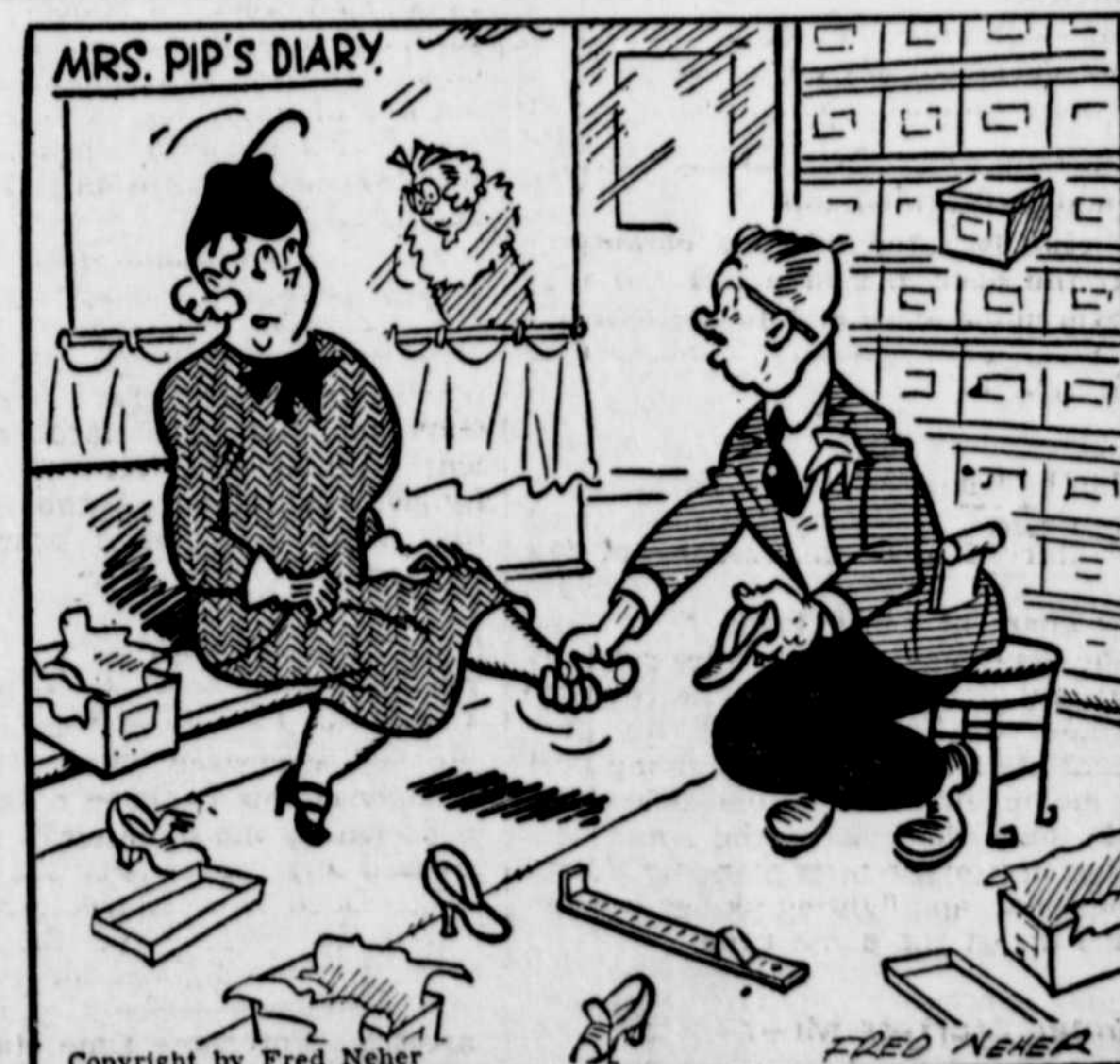
"That feels better . . . but it's still a little snug."