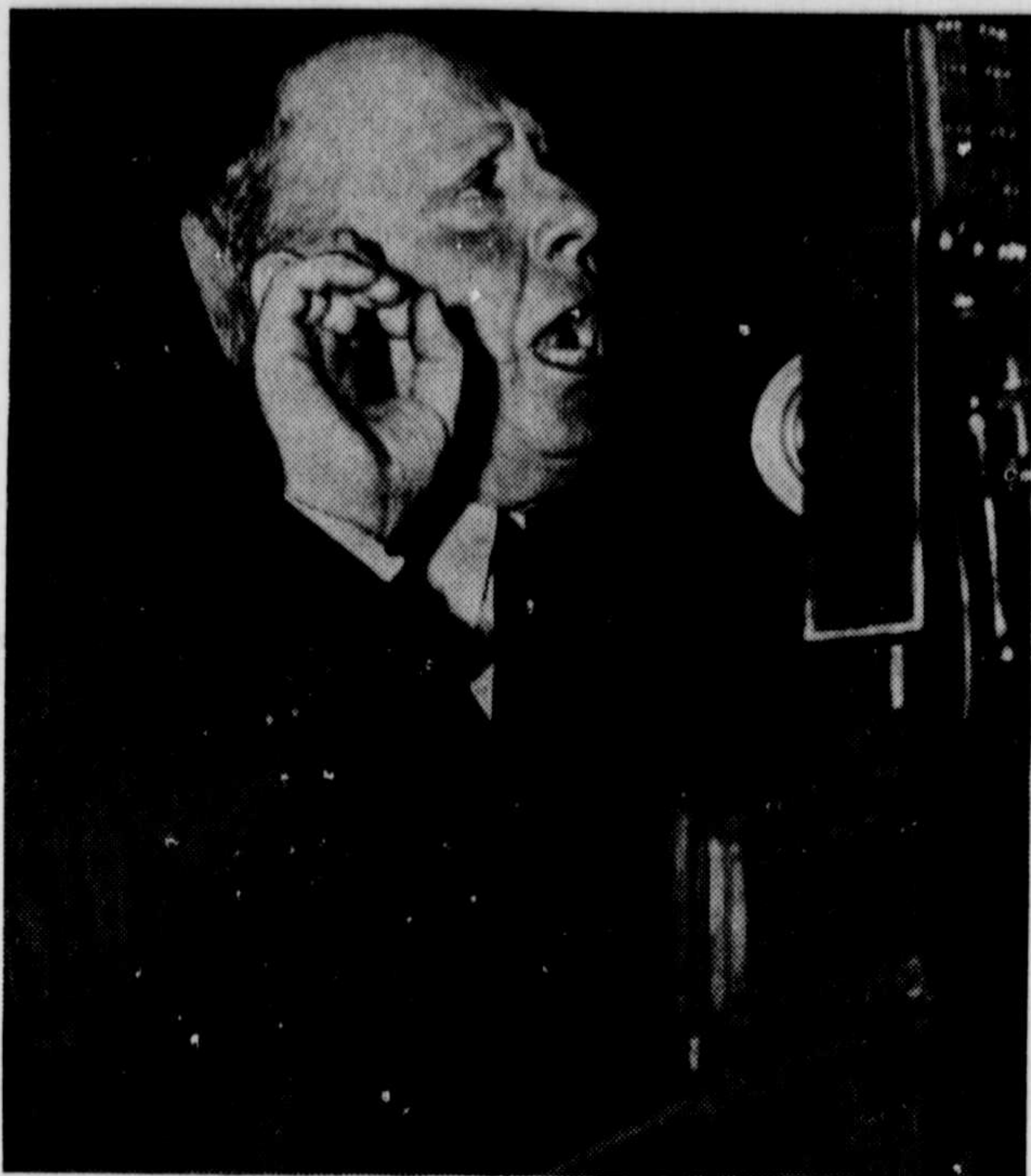
HIS HONOR THE MAYOR . . . Frank Hague, the C. I. O. baiting chief executive of Jersey City, N. J., virtual dictator over a city in the shadows of Manhattan. "I am the law," he once said.

Currently Frank Hague is in the headlines as a C. I. O. baiter. He has refused to open the civic doors to John Lewis' organizers. They cannot hire a hall; Hague's efficient police simply run them out of town. The mayor, who once thoughtlessly boasted that "I am the law," has arranged convenient legal weapons to best the C. I. O. One law prohibits distribution of non-commercial literature, like C. I. O. pamphlets. Another enables police to arrest anyone who can't give sat-