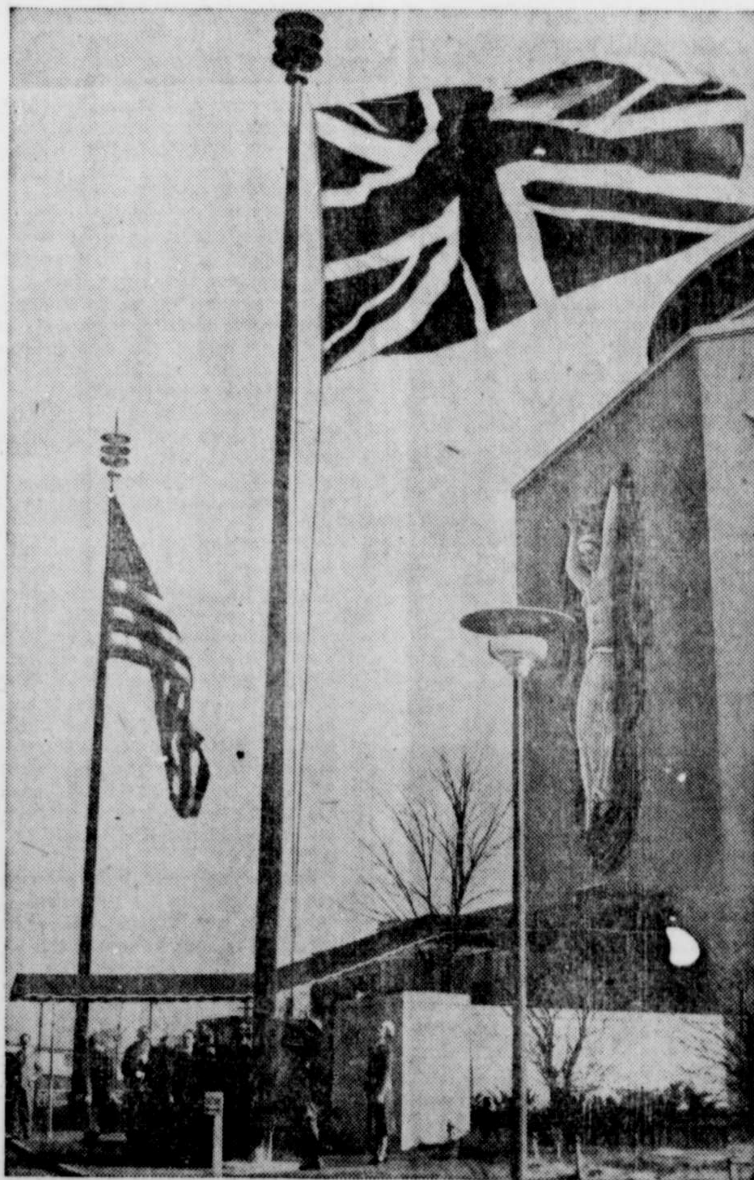
NEW YORK—A stirring scene in front of the Administration Building at the New York World's Fair 1939 as the Union Jack of Great Britain is hoisted aloft signifying that John Bull will be represented at America's exposition. The British exhibit will occupy 140,000 square feet, the largest of the 64 foreign displays now being prepared, and will cost several millions.

A pessimist is a man who prefers artificial light to genuine sunshine. One individual who thinks he knows it all has the most to learn.