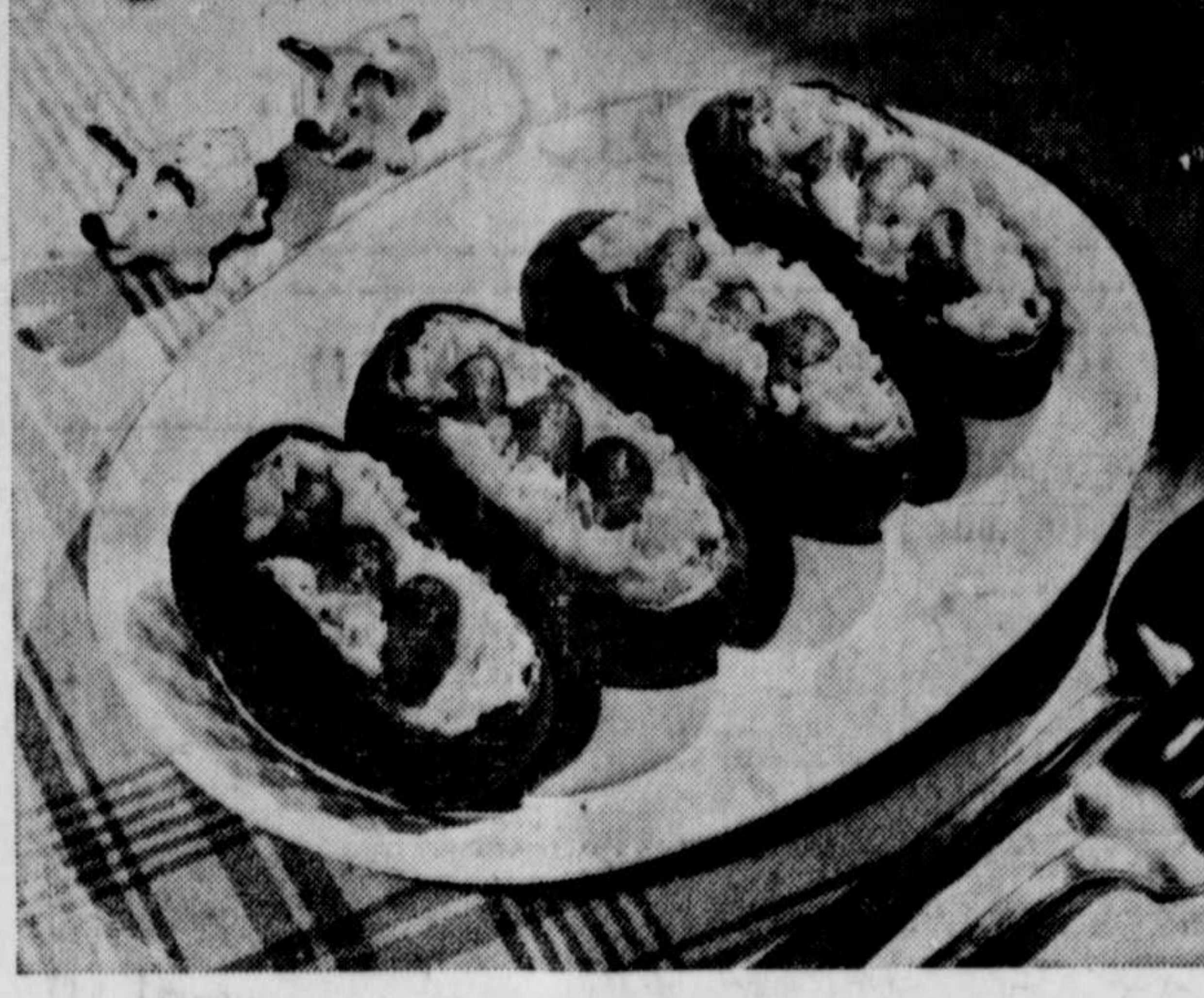
MAYBE FATHER WILL LIKE THESE? (Recipes Below.)

ODDS AND ENDS —Joan Crawford is said to be considering a return to the stage as a night club dancer in a play called "Gods of the Night"—it all depends on whether she can get a vacation from picture-making... John Trent, former transport pilot, isn't allowed to fly while he's at work on one of his "Tailspin Tommy" pictures... Richard Barthelmess will play John Garfield's brother in "Underground"... Barthelmess was one of First National's leading stars—now First National has been merged for years with Warner Brothers, and Barthelmess hasn't been on the lot for five years... Barbara Stanwyck may find herself back on the stage this fall, and in a musical show at 41st.