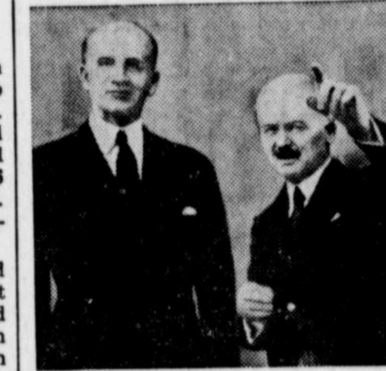
WELLES AND LEBRUN A baptism of fire.

Wagner Act. Chairman Mary Norton (Dem., N. J.) of the house labor committee charged that 21