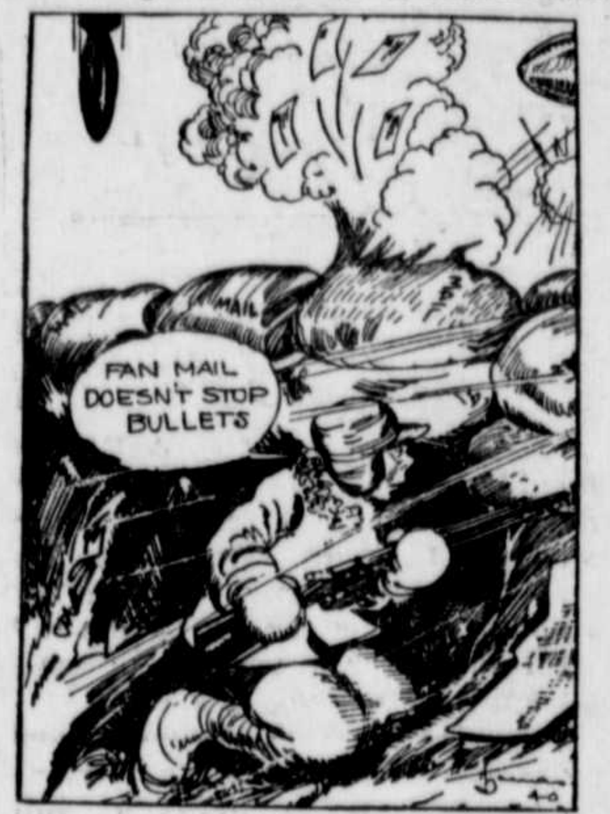
As Finland sees it.

The surrender of Finland means not so much a triumph for Soviet Russia as for Germany. It means that the remainder of Finland now will be welded together for self-protection in an economic alliance with Sweden and Norway. And most important of all it means that