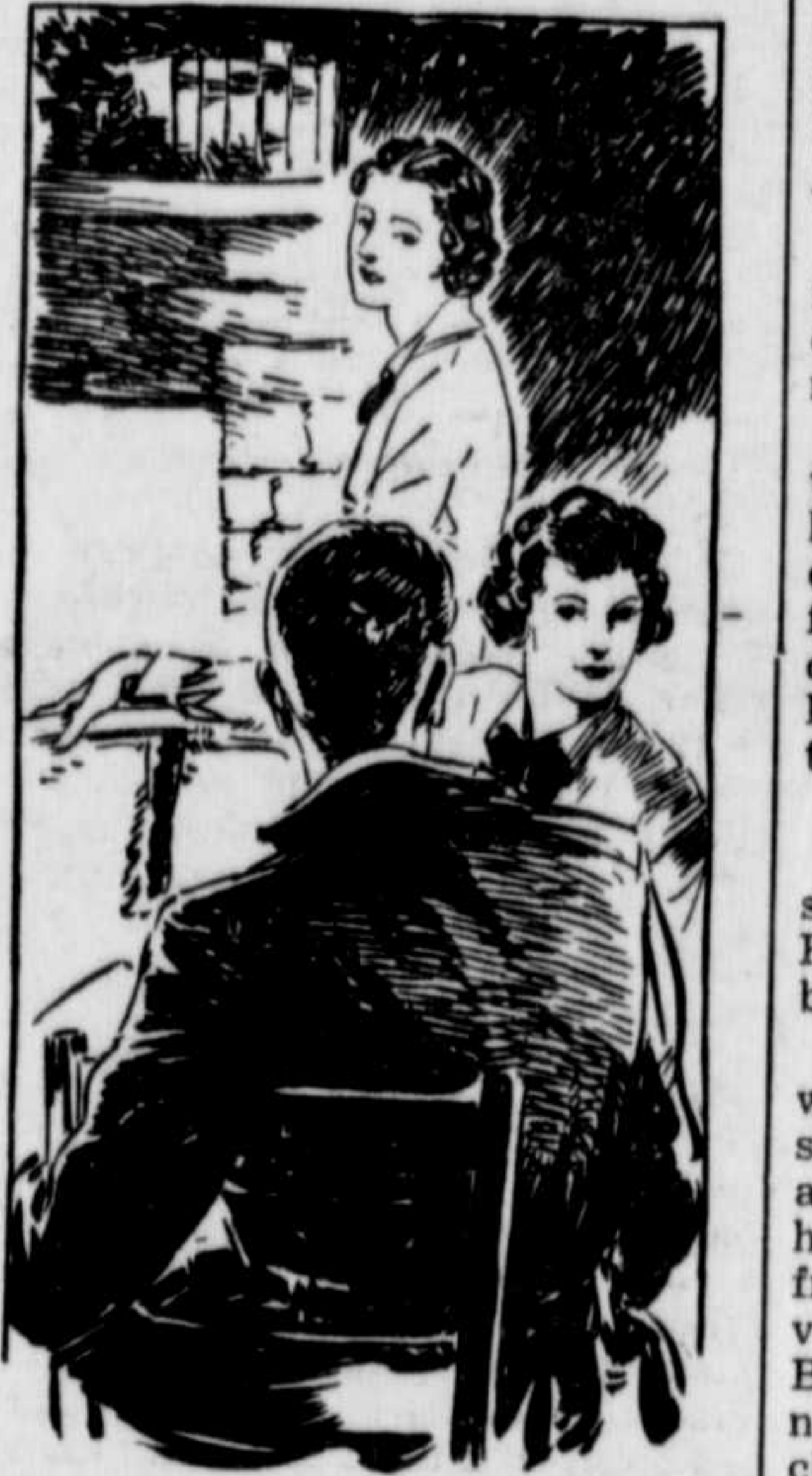
"I must make my experiment here."

"I have another week." She knew that he, too, was considering, choosing