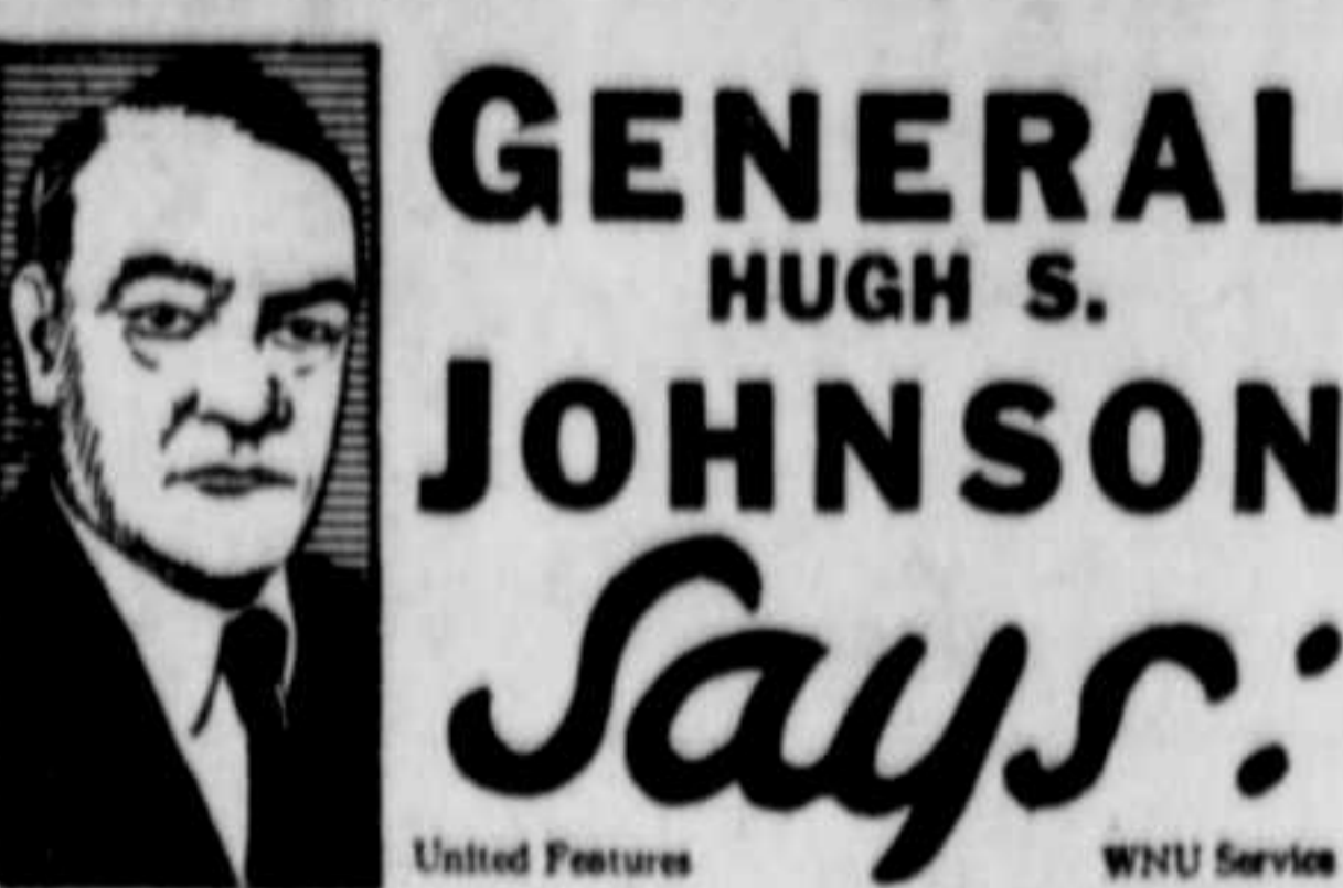
GENERAL HUGH S. JOHNSON Says:

'100 PER CENT' HOOVER The political smear artists who are out to get Chief G-Man Hoover realize that they can't do it on any legitimate charges of inefficiency or ill-boding. The guy is 100 per cent cop and 100 per cent honest. But there is always the weapon of ridicule which is so effective that a man can be hurt by merely hearing his good points mentioned too much—like Aristides who got himself kicked out of Athens partly because some people got tired of hearing him called "The Just." So they call J. Edgar Hoover "The Glamour Boy of the Beaches." That is based on the following episode in Miami: Shortly after the Pendergast cleanup in Kansas City, the then attorney general, Frank Murphy, who is a real glamour boy both in politics and among the gals, made a crack about cleaning up corruption in American cities. He was not then on the Supreme court, and he didn't want to go there. He thought he had an outside chance of becoming heir-apparent to the Great White Throne. This may have had nothing to do with Attorney General Murphy's proposed city cleaning crusade, but if Tom Dewey could become a leading candidate by cleaning one city, what couldn't Frank Murphy do by cleaning ten? So he ordered Hoover and six G-Men to Florida and later announced that he had done so to cleanse Miami.