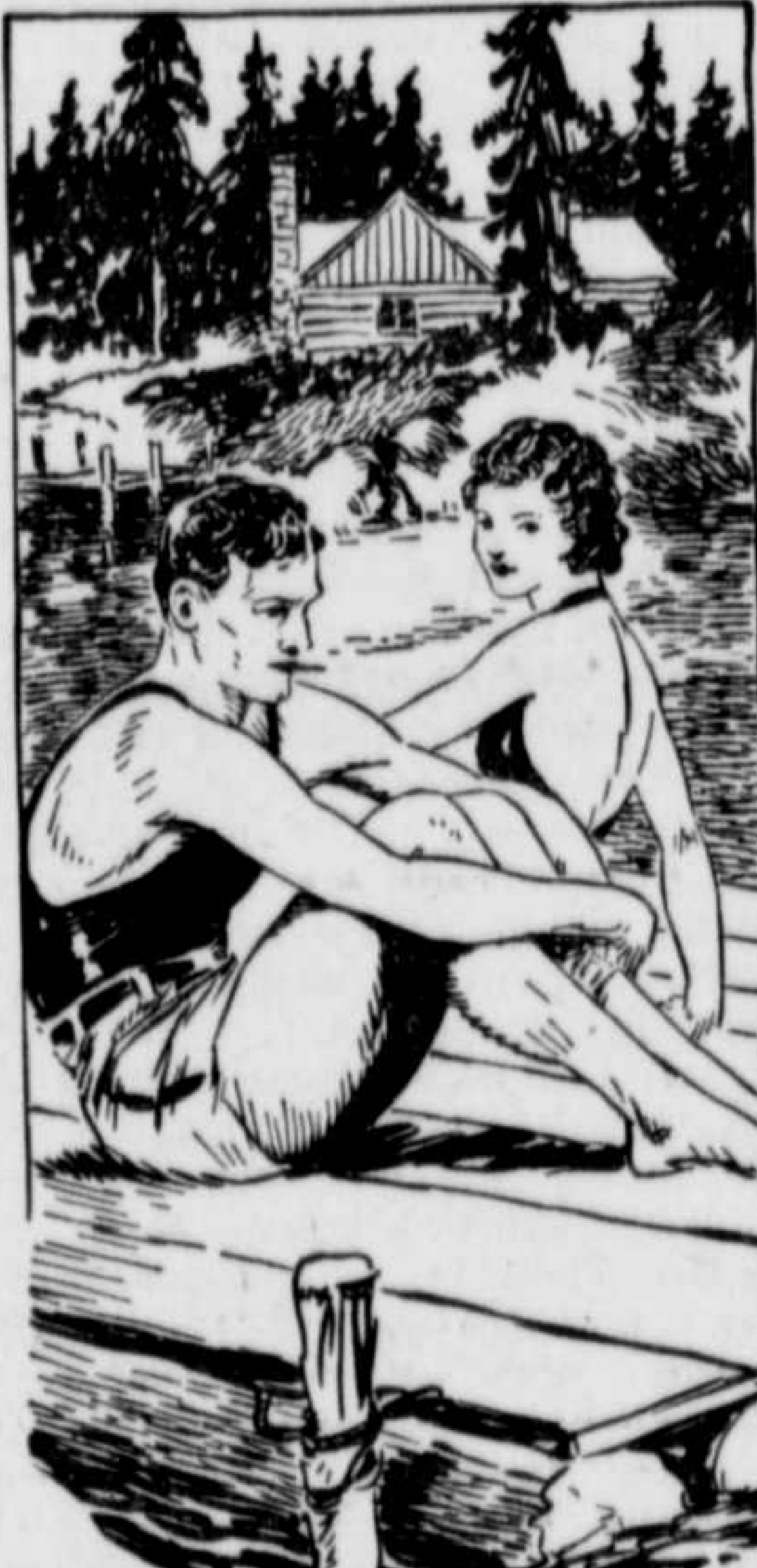
"You needn't, you know," John said presently.

"Your mother has not been idle," Kate reminded her grimly, "not to mention a varied assortment of relatives." "They're such an articulate family." "Yes," Kate said dryly, "and, unfortunately, cable rates are no deterrent." "But why couldn't they have waited?" The humor that had brightened her voice was gone. Though he saw her only in profile, John knew that her eyes were dark and mutinous. "Why must they jump to conclusions? Aunt Flora would, of