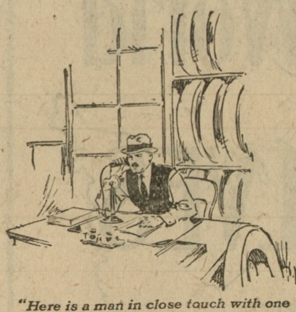
"Here is a man in close touch with one of the 92 U. S. Factory Branches"