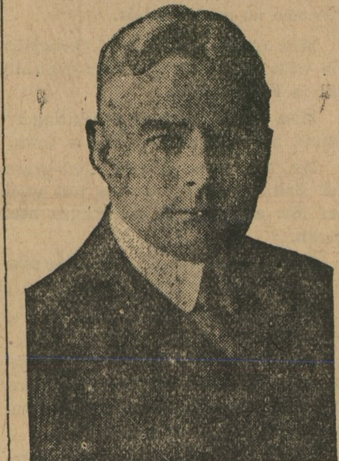
ALBERT CABELL RITCHIE, Governor of Maryland and Chairman of the State Committee of the American Legion Endowment Fund, who expects every community of this state to do its duty in raising quota.

State Commander of American Legion and Former Mayor of Baltimore Join in Appeal to Raise This State's Share of National Endowment Being Established to Cure Disabled Veterans and to Care for Their Helpless Children.