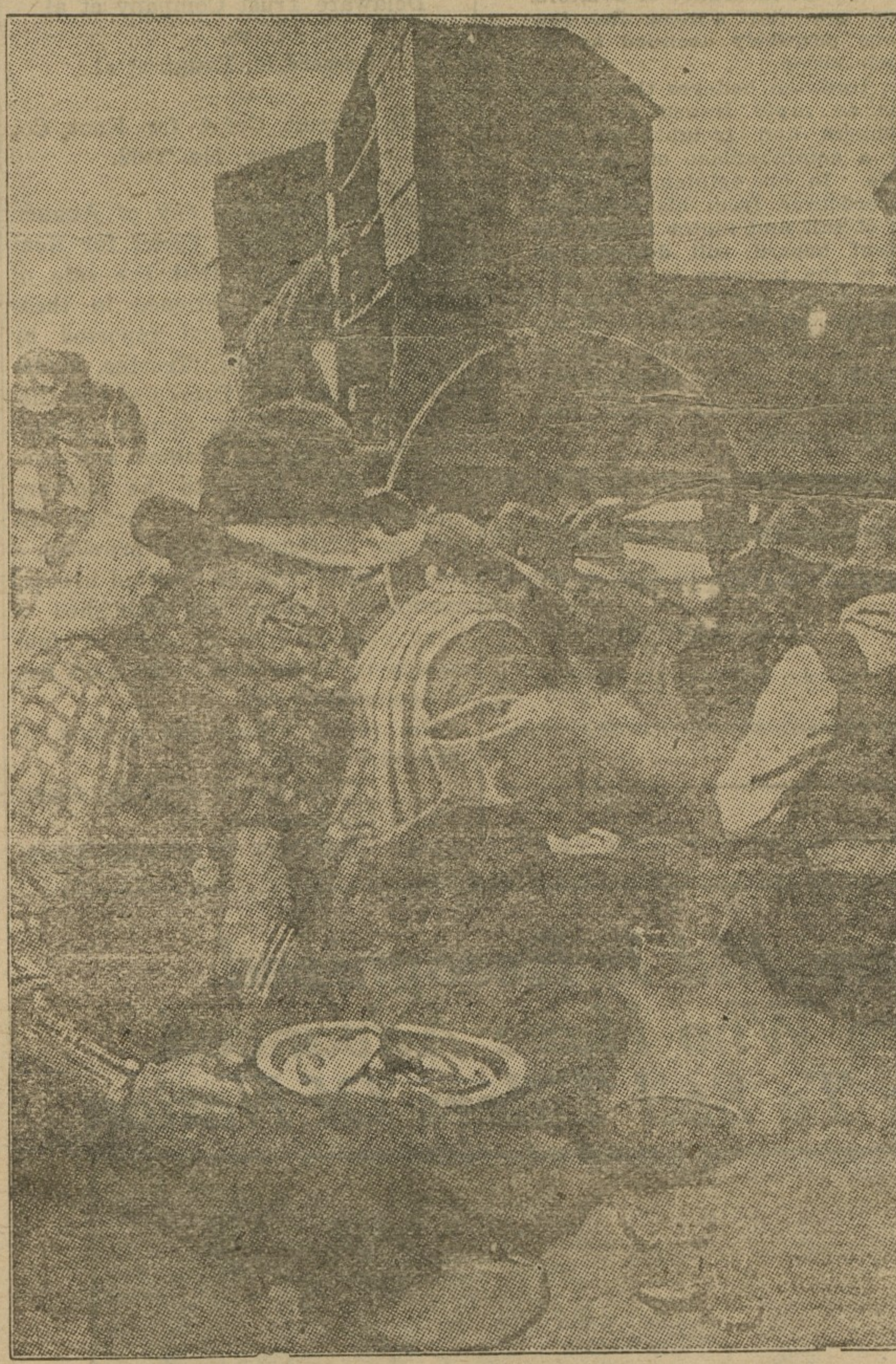
(From a drawing by N. C. Wyeth in Scribner's Magazine.) Ever eat beans ("Mexican strawberries") dished up from a chuck wagon? Ever sleep out with a saddle for a pillow? It's a great life—if you like it. Say the cowboys.