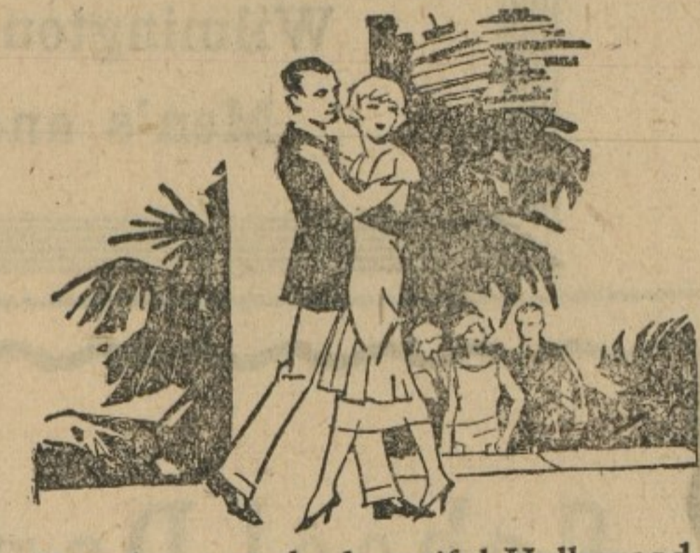
You dance at the beautiful Hollywood country club with its rainbow lighted floor, and automatically removable top.