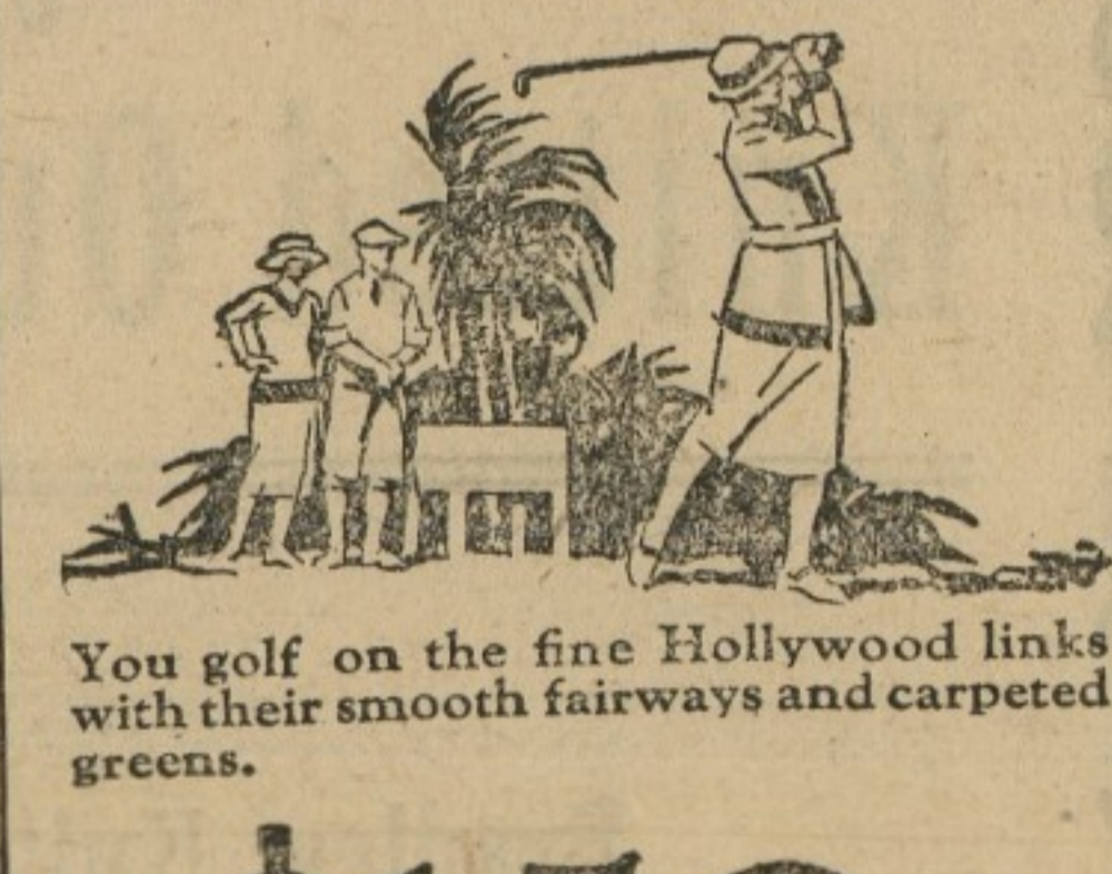
You golf on the fine Hollywood links with their smooth fairways and carpeted greens.