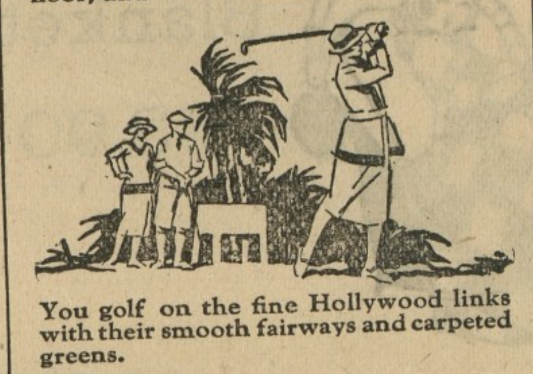
You golf on the fine Hollywood links with their smooth fairways and carpeted greens.