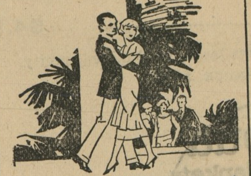
You dance at the beautiful Hollywood country club with its rainbow lighted floor, and automatically removable top.