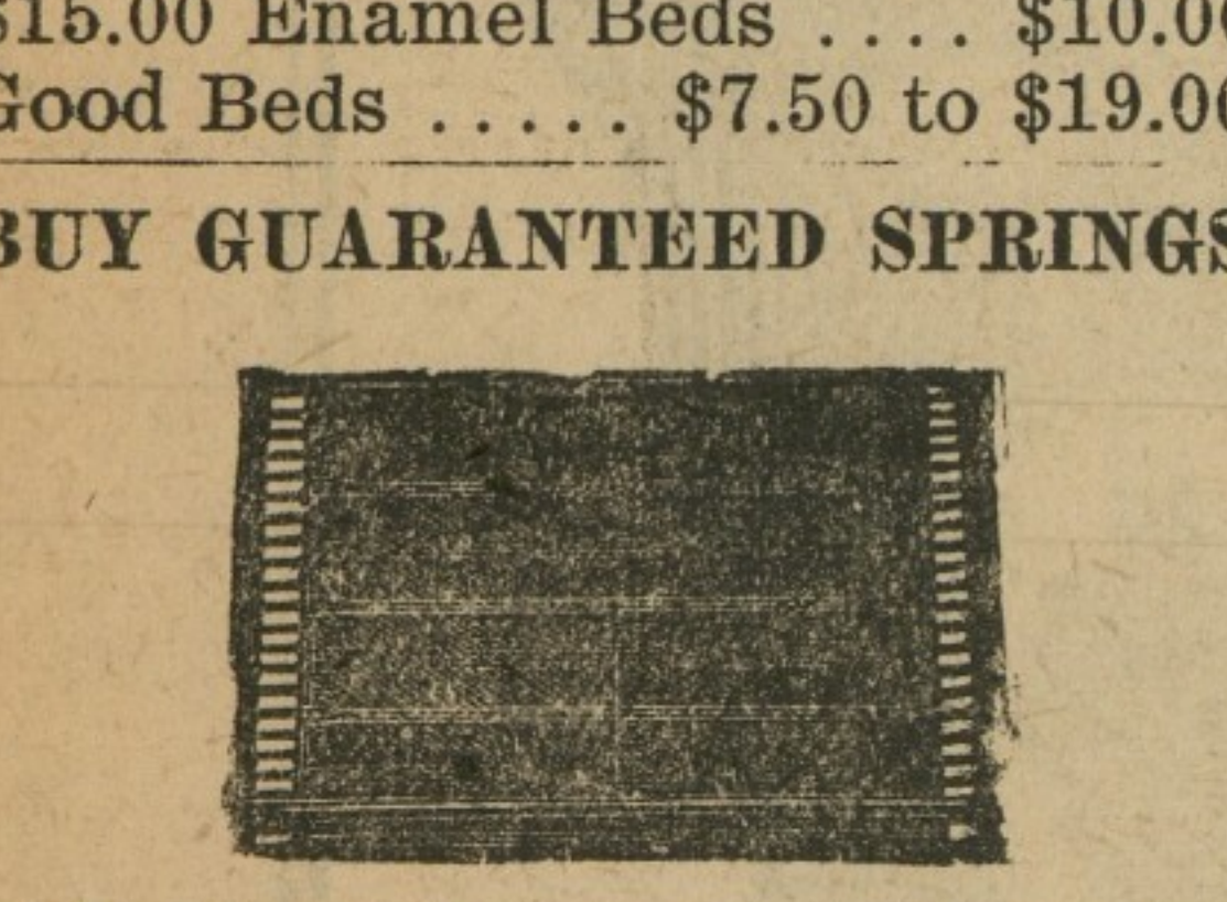
BUY GUARANTEED SPRINGS A bad spring is not cheap at any price. Each spring is sold on a 10-year guarantee. Prices $6.50, $7.50, $10.00