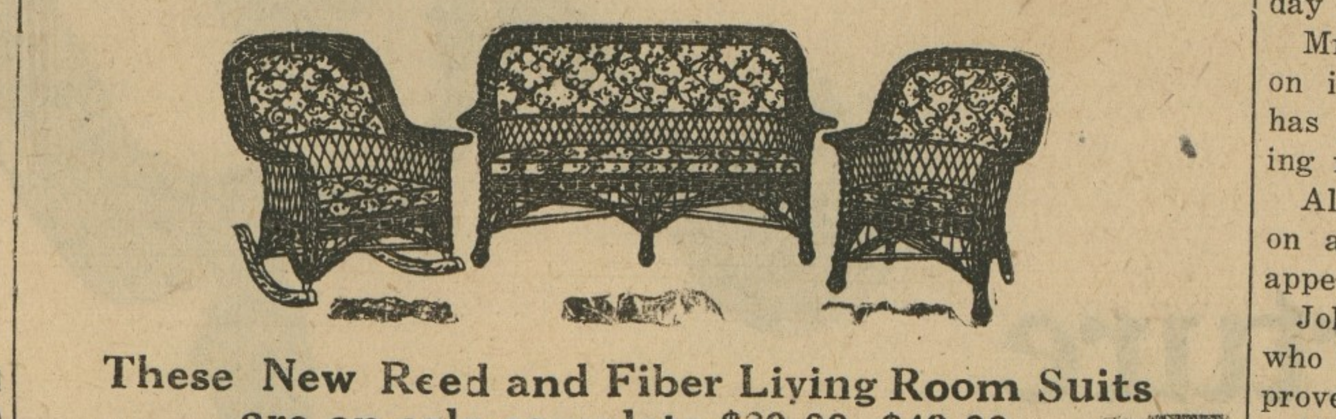
These New Reed and Fiber Living Room Suits are on sale complete $39.00, $49.00.