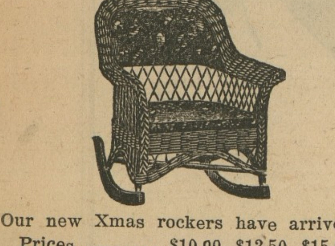
Our new Xmas rockers have arrived Prices $10.00, $12.50, $15.00