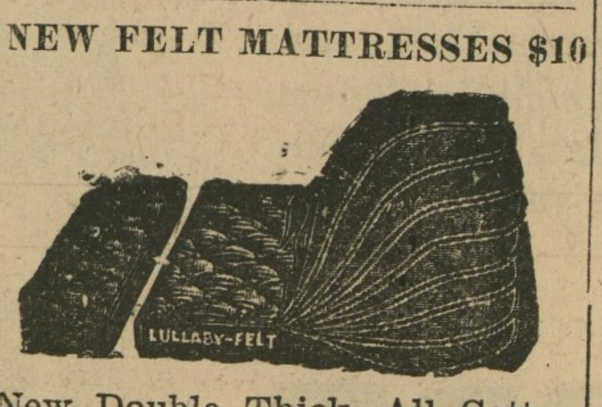
NEW FELT MATTRESSES $10 New Double Thick, All Cotton Felt Mattresses, with Extra Quality Twill Tickings. $15.00 Mattresses for $10.00 Cheaper Mattresses $6.50 up