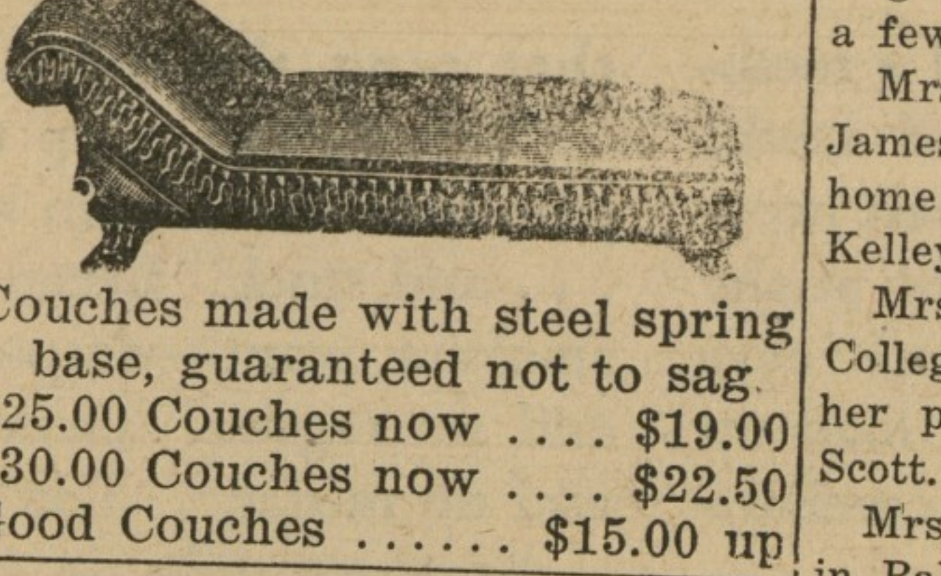
NEW OAK COUCHES $19 Couches made with steel spring base, guaranteed not to sag $25.00 Couches now $19.00 $30.00 Couches now $22.50 Good Couches $15.00 up