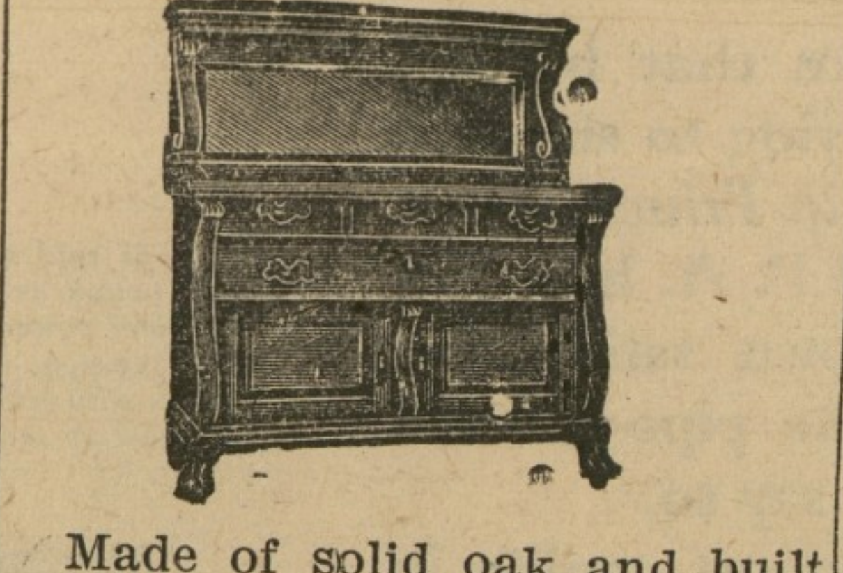
NEW LOW BUFFETS Made of solid oak and built for beauty and service. Prices $22.50, $29.00, $35.00