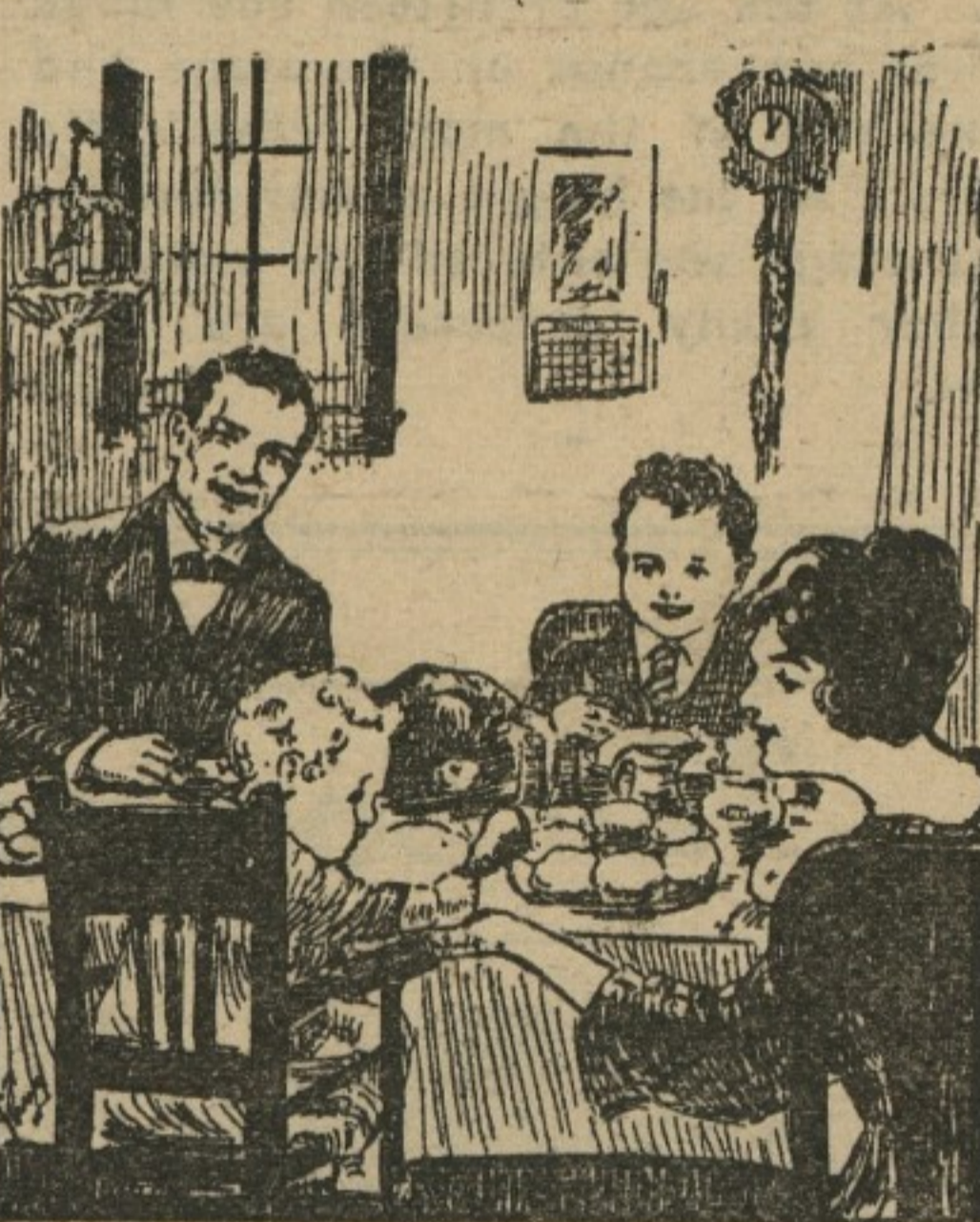
"Home is Where Contentment Is, and Love Abounds."

the one great thing for which we can all be thankful, and it reaches hovel and palace, and is more pronounced than at any period since the days of our Pilgrim fathers—is the great love being manifested by humanity. We have all learned that we cannot exist, one without the other. Water never rises above the source. The home is the source of civilization, and we have awakened to the fact that the humblest home, the vilest hovel,