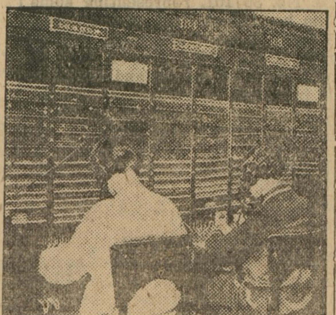
Operator passing European call from New York transatlantic office.

Theatrical Magnate, Ill, Telephones Personal Physician To Come At Once