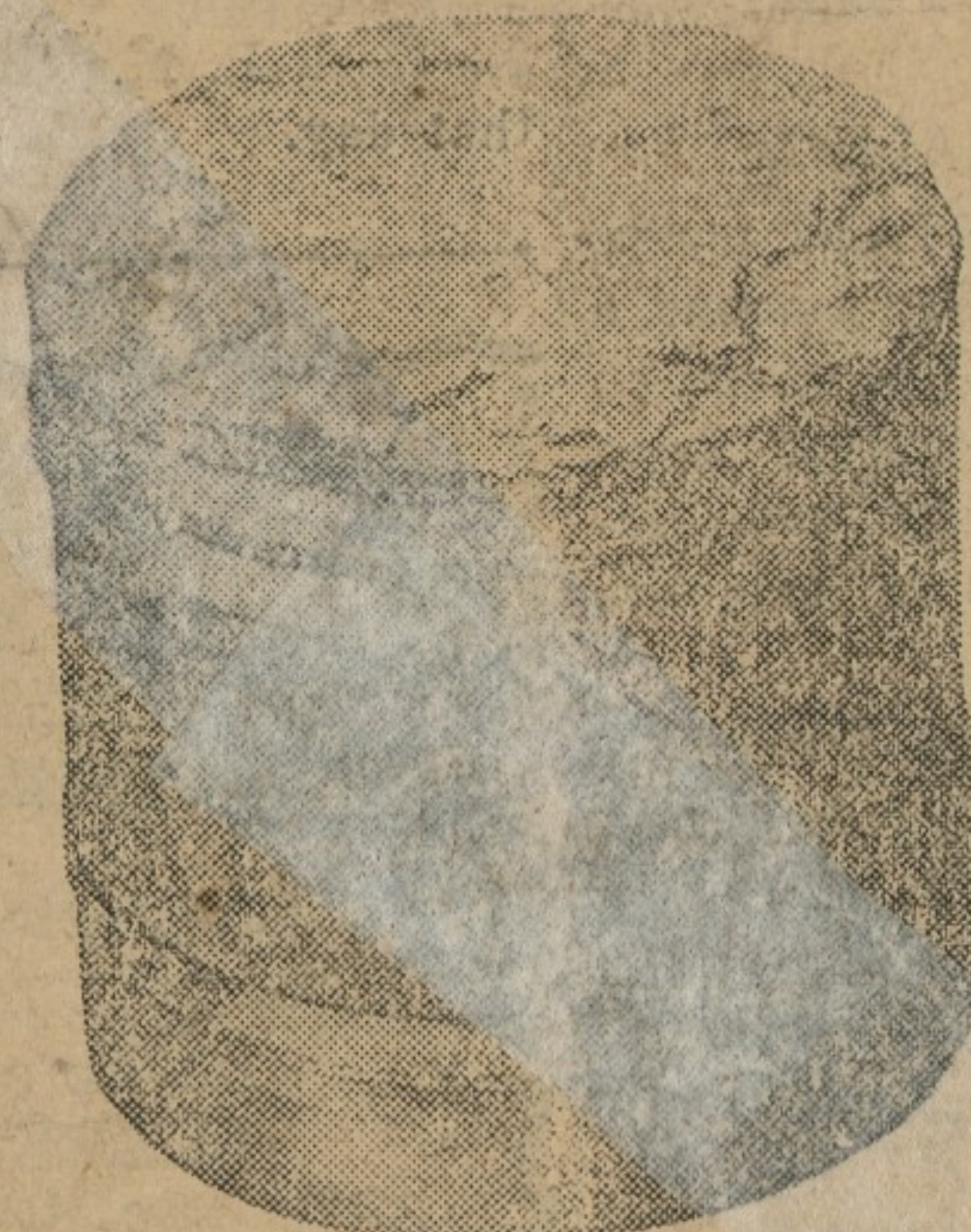
PISTON NO. 2 was taken from the same engine, same cylinder, after a run of 1,000 miles, and a different compounded oil was used.