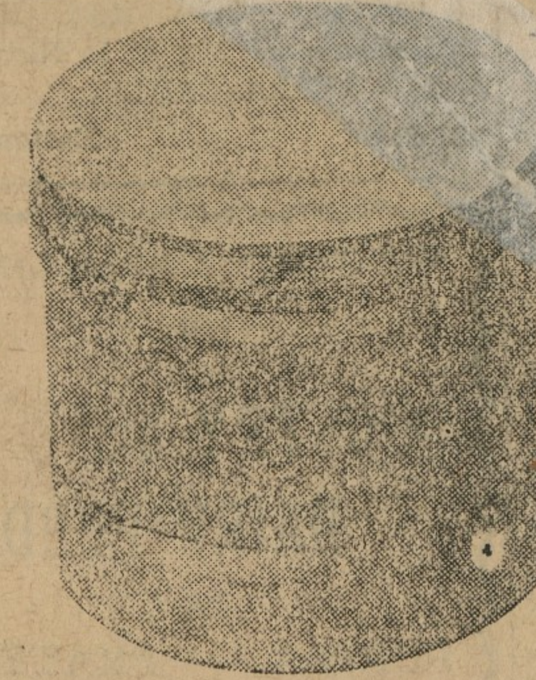
PISTON NO. 4

Piston No. 4 was taken from the same Ford engine, same cylinder, after running 5,000 miles (5 times as far). SUNOCO Motor Oil was used. After the test there was only a little soft, harmless soot which could be wiped off easily with a rag—a characteristic SUNOCO performance.