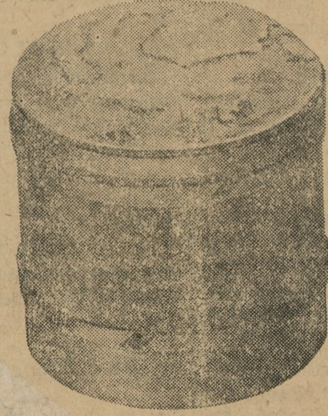
PISTON NO. 3 was taken from the same engine, same cylinder, after a run of 1,000 miles, and a third compounded oil was used.

Each of these tests was made under exactly the same conditions