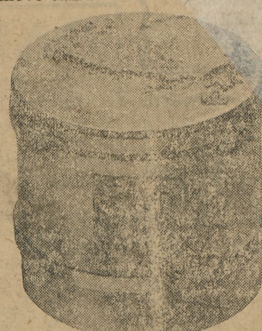
PISTON NO. 1 was taken from a Ford engine after a run of 1,000 miles. A compounded oil was used.

a year, at least doubling these costs. SUNOCO, the 100% distilled oil, which is guaranteed free from paraffine, gives perfect lubrication. You will have no hard carbon—which causes knocks, gummed spark plugs and valves, pre-ignition and loss of power—if you use SUNOCO exclusively.