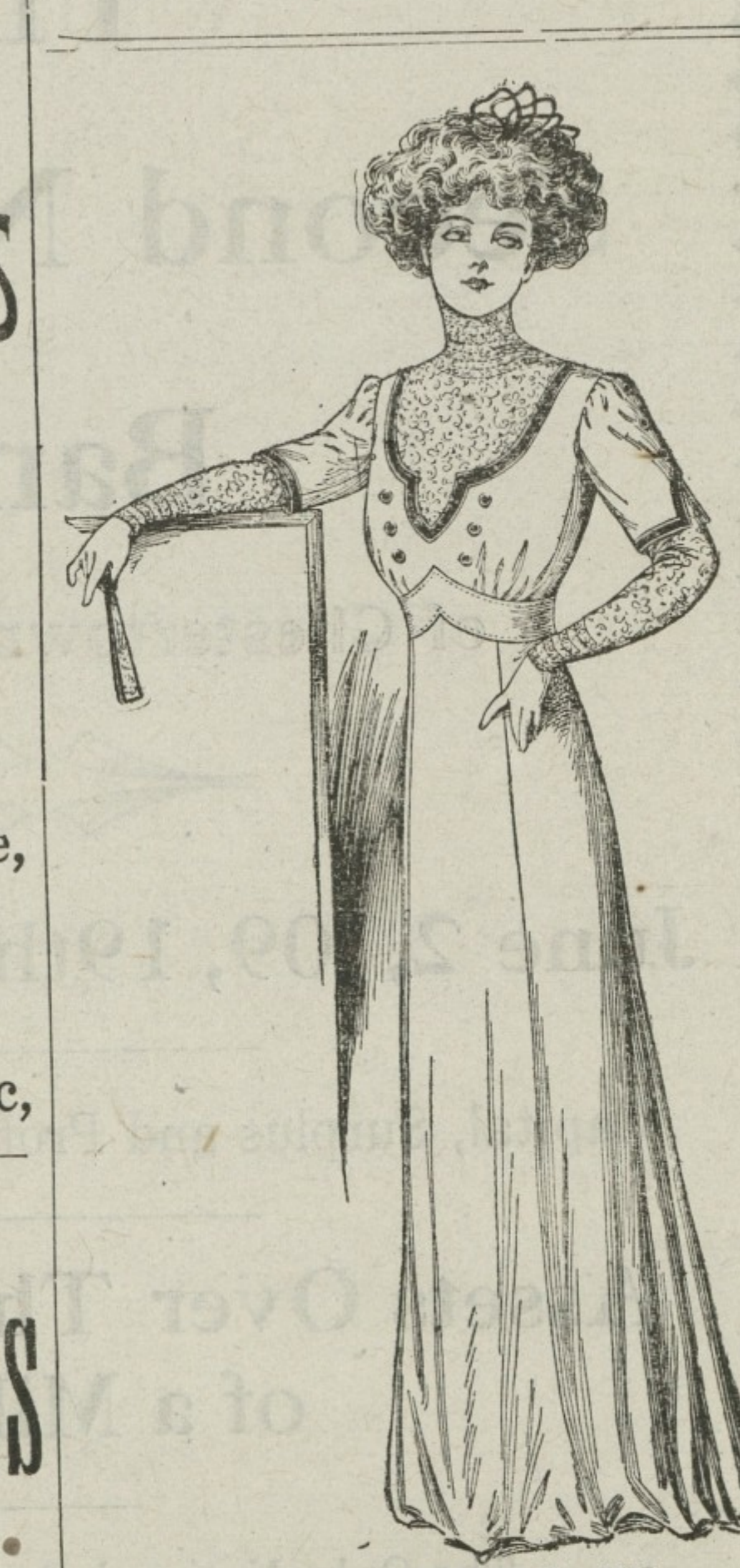
McCALL PATTERN No. 2517 FASHIONABLE GUMPE DRESS

We pride ourselves with carrying one of the newest, cleanest and most up-to-date stock of first-class merchandise that can be found in Kent county. Our store is full to overflowing with a large stock.