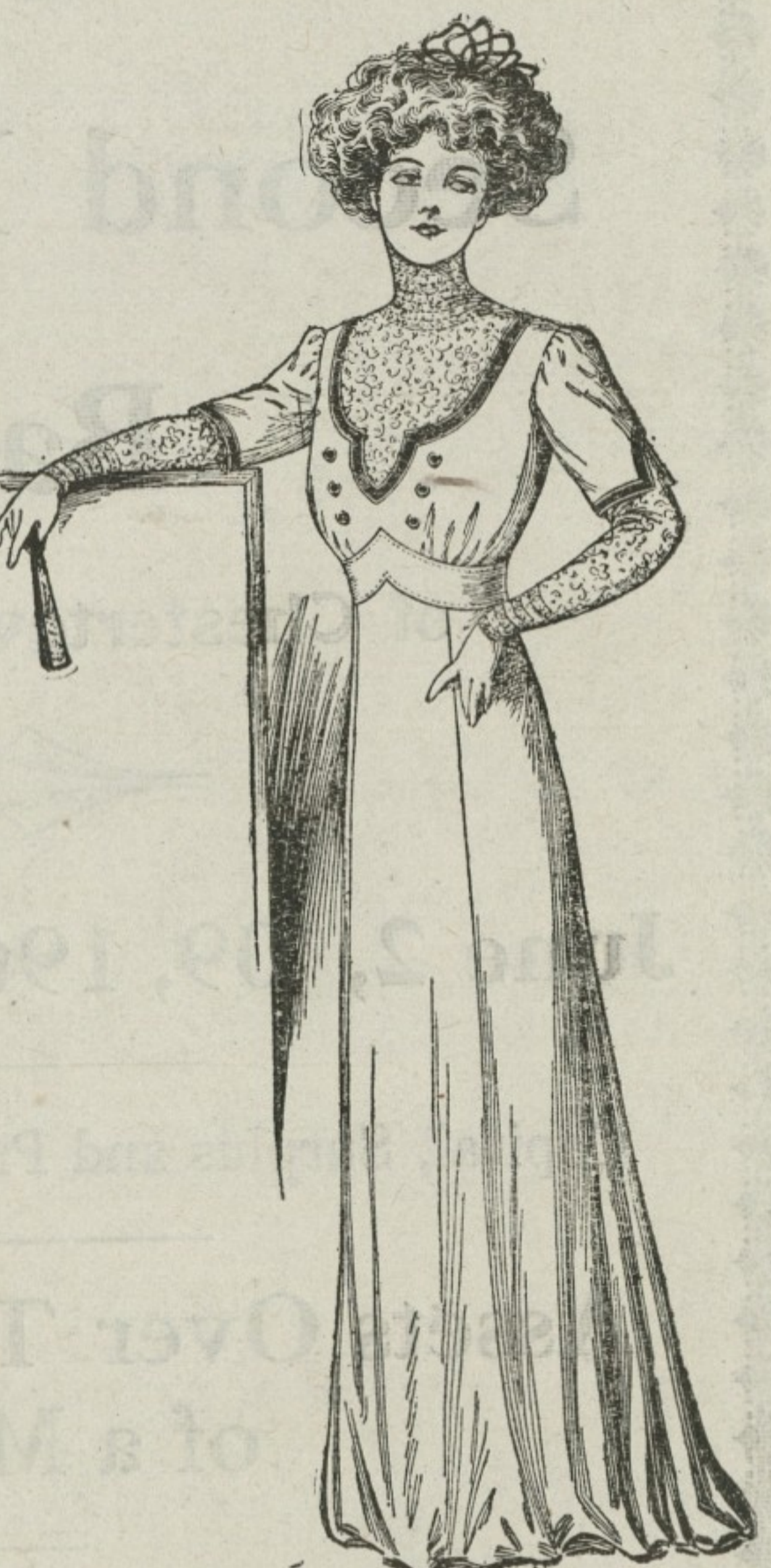
McCALL PATTERN No. 2817 FASHIONABLE GUMPE DRESS

We pride ourselves with carrying one of the newest, cleanest and most up-to-date stock of first-class merchandise that can be found in Kent county. Our store is full of overflowing with a large stock.