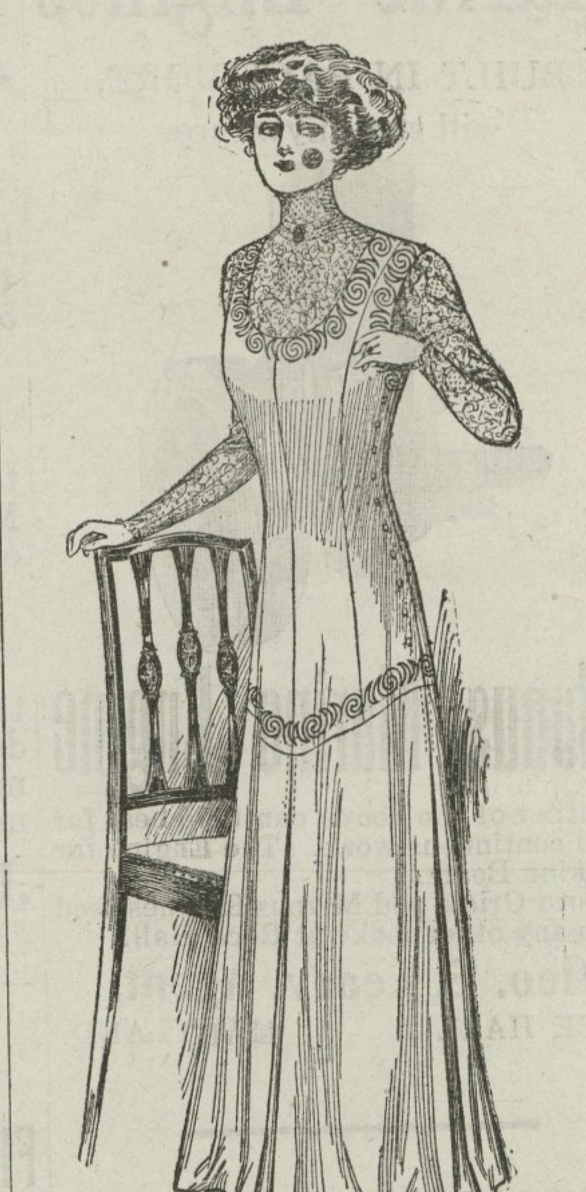
McCALL PATTERN No. 2912 STYLISH LONG-WAISTED MODEL

Make our store your headquarters for the year, and see if we don't sell better goods as cheap, and pay more for your produce than other merchants. Give us a trial.