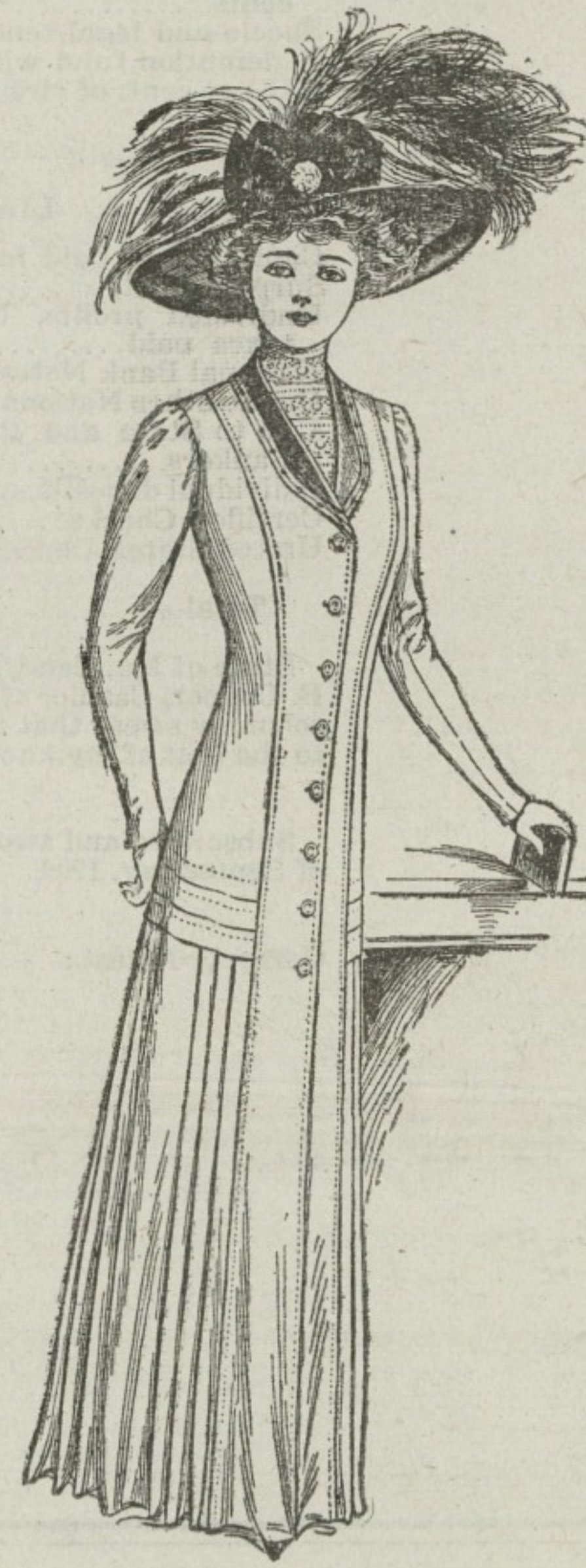
McCall Pattern No. 2637 LATEST COAT DRESS